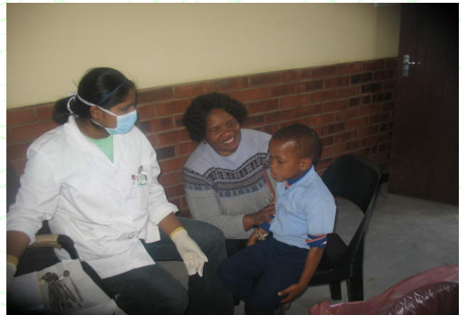
Hospital team waiting to screen one learner

Learners were very excited by this government action as one child commented " This is a good move and we are happy to have our teeth look after by the doctor. The parents were also eager to see the dental team coming back to do the screening for others. Thumbs up to the team.