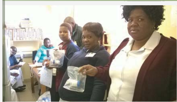
Staff members showing their commitment

The team gave health education on TB and importance of HIV testing. The employees were done vital signs like blood pressure, blood glucose, weight and also taken sputum's for further tests to 45 employees both in the hospital and Kwamahlathi. We would like to extend our gratitude's to hospital and Kwamahlathi staff for their co-operation