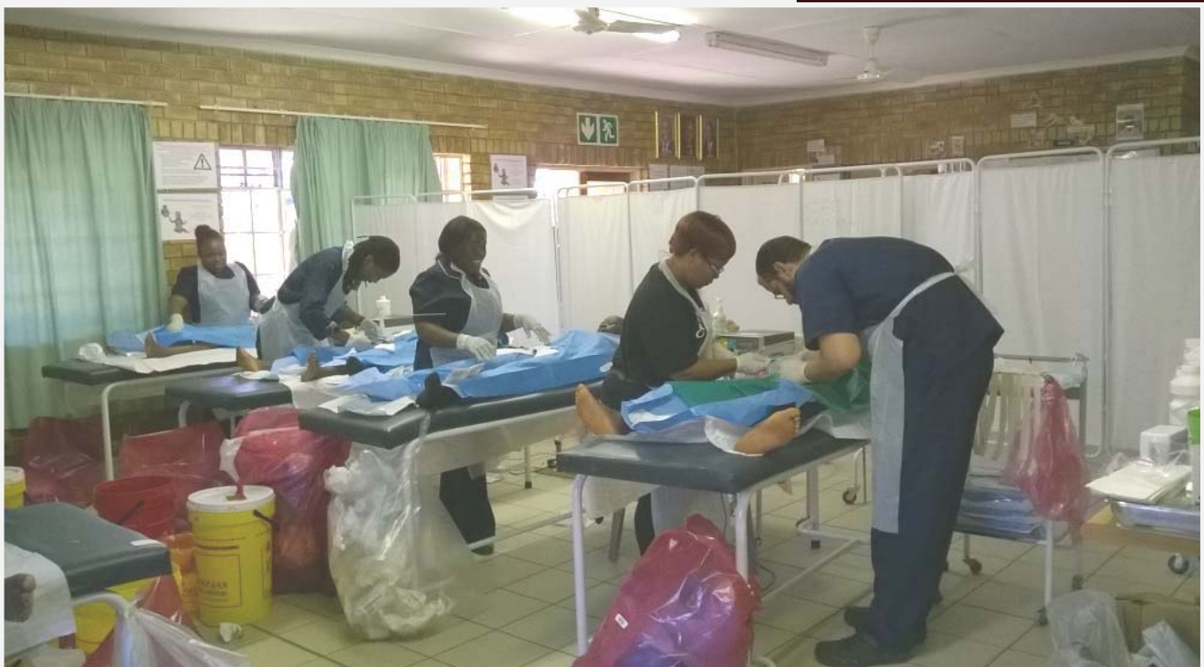
HAST Team together with SACTWU hard at work performing MMC