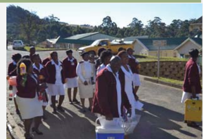
The team signing after successfully conducting the campaign