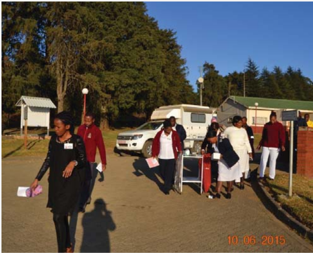
Staff members evacuating the building rushing to assembly point

The drill was conducted at OPD on the 10th June 2015. The purpose of the fire drill was to ensure that all ward and departments have safe and effective procedure for the protection of patients and staff members in the event of fire. To maintain a safe environment for all persons whilst present on hospital property. To ensure the protection against hazards which may lead to fire from the workplace and associated activities.