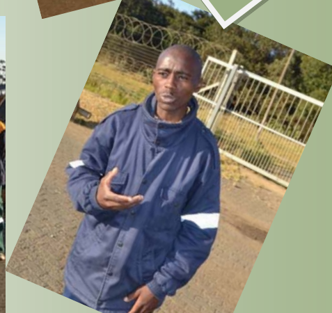
Official from Kwamahlathi giving clarity on other matters related to fire drill