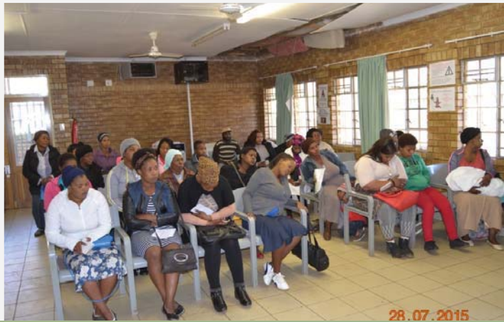
Patients listening to different speakers during Hepatitis Campaign