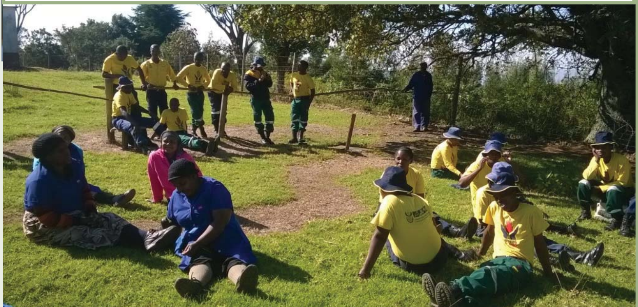
Kwamahlathi staff members listening to health talks by HAST team during the campaign