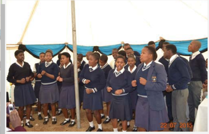
Mfongosi and Ngono High Schools entertaining guests and audience during the awareness