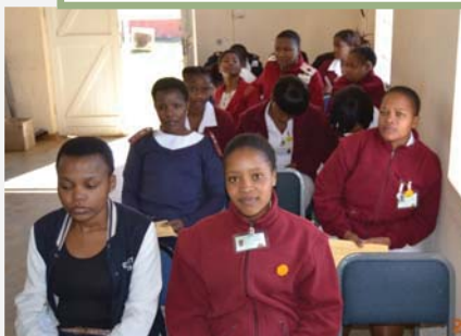
Staff members waiting patiently to be taken vital signs and others