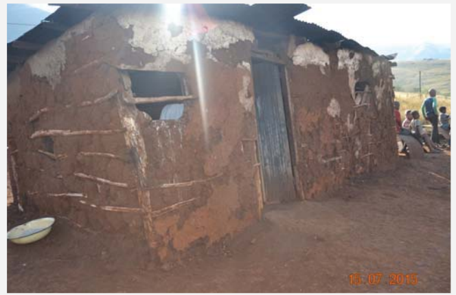
One of the households that was identified during Public Service Voluntary Week