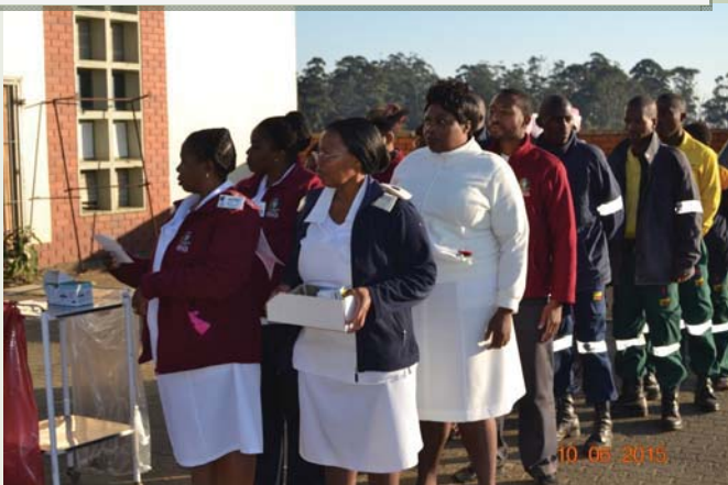
Staff members listening to instruction from Health and Safety Officer