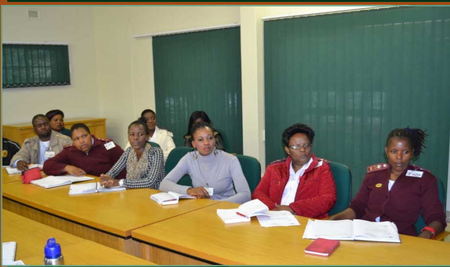
Bottom left photo Staff members listening to our Senior Human Resource Practitioner during the workshop