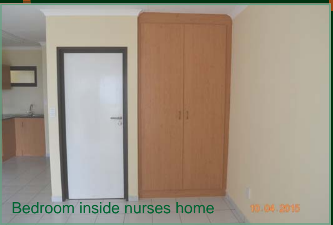
Bedroom inside nurses home 10.04.2015