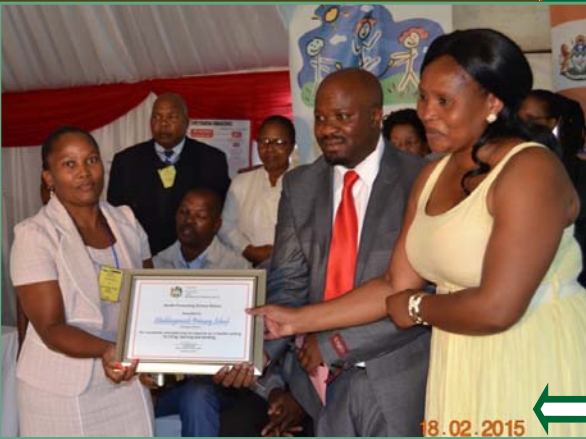
District Manager handing over certifications to the school principal and school governing body