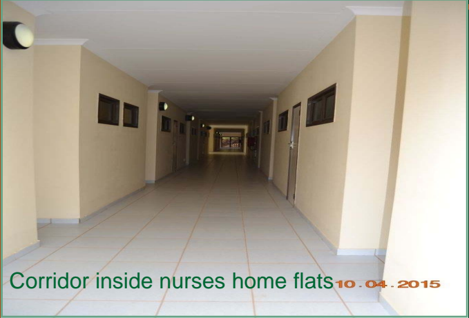
Corridor inside nurses home flats 10.04.2015