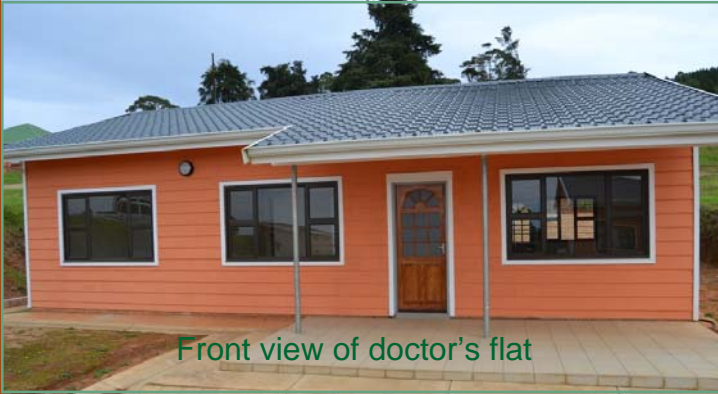
Front view of doctor's flat