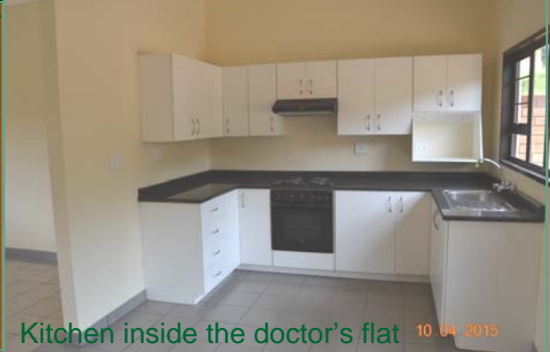
Kitchen inside the doctor's flat 10.04.2015