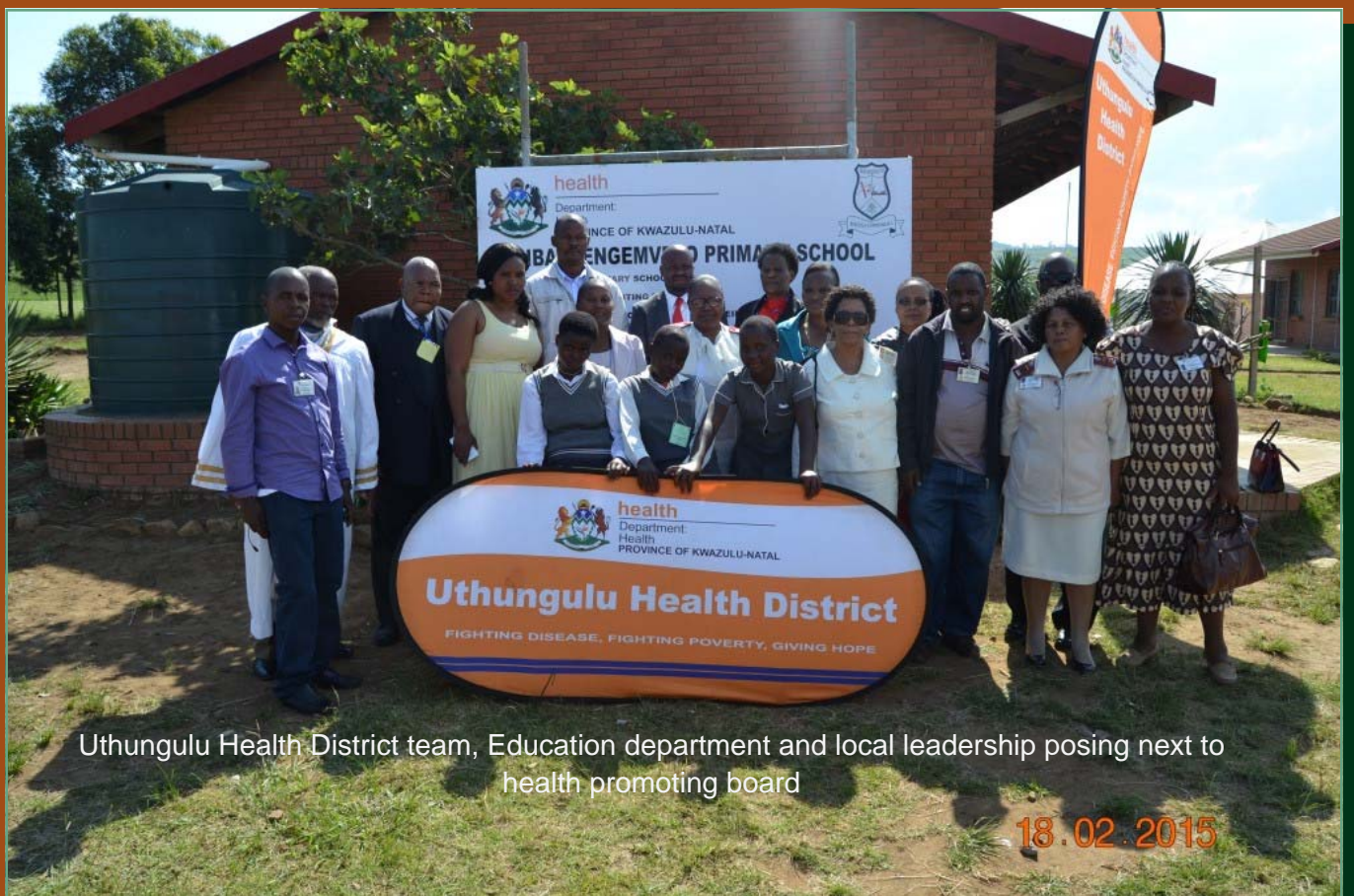
Uthungulu Health District team, Education department and local leadership posing next to health promoting board