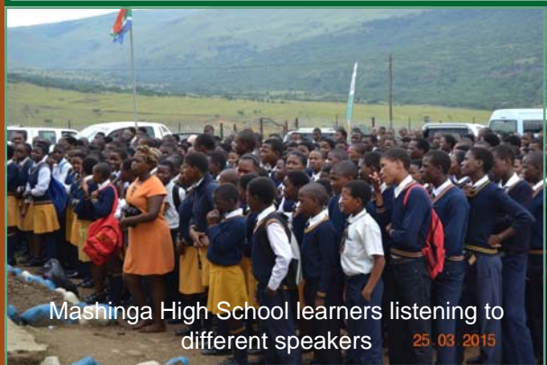
Mashinga High School learners listening to different speakers