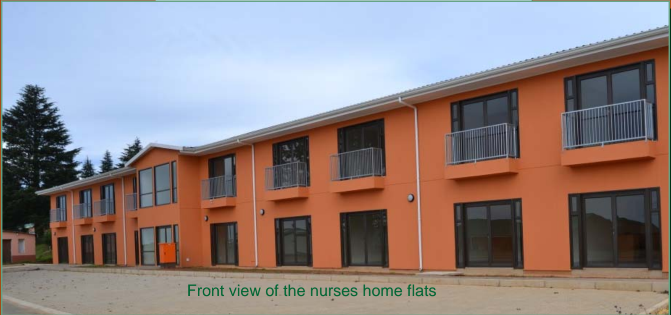
Front view of the nurses home flats