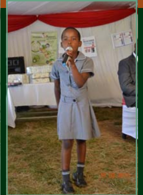
Learner reciting a poem