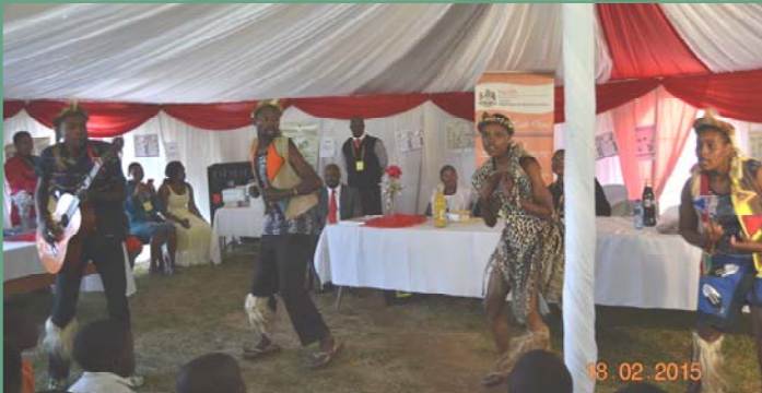
Local music group entertaining the audience and on the bottom right Uthungulu Health District Manager unveiling the health promoting board