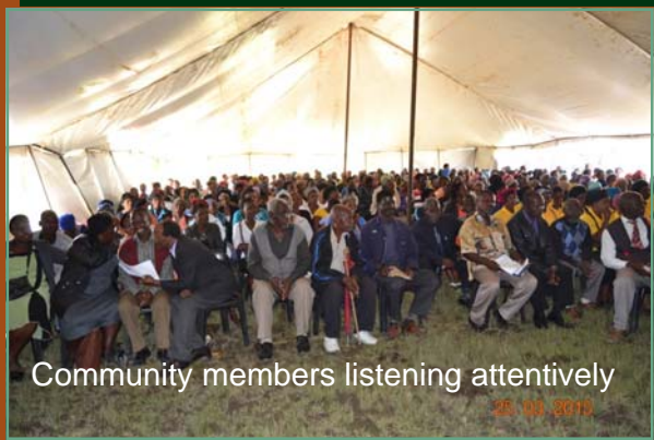
Community members listening attentively