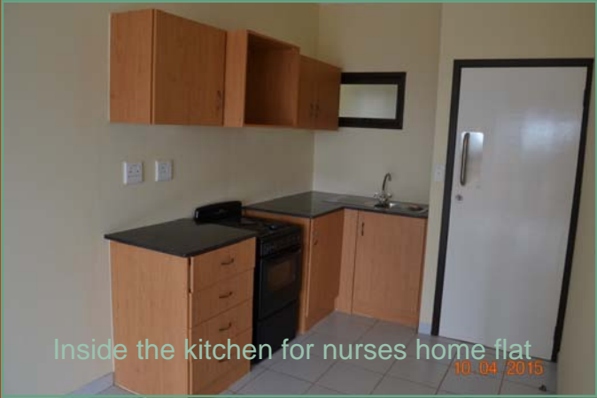
Inside the kitchen for nurses home flat 10.04.2015