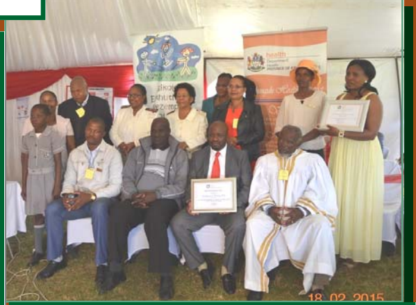
Dignitaries from health and education Departments and local leadership posing for a photo