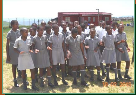
Sibahlangemvelo Primary School learners entertaining the audience