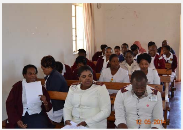
Audience listening to different speakers