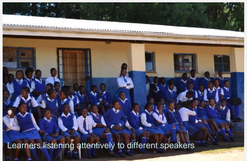
Learners listening attentively to different speakers