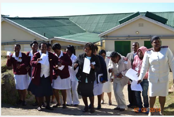
Matrons and other categories of staff doing ama-get down