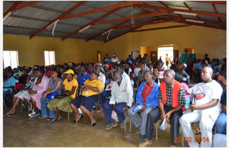
Community members listening to different speakers and waiting patiently for services

Bringing services closer to the people is the main objective of Operation Sukuma Sakhe initiative by the office of the Premier. On 22 March 2014 Operation MBO was held at Dolwane Hall in ward 12. Services from various departments were rendered on the day and members of the community came in numbers to access services.