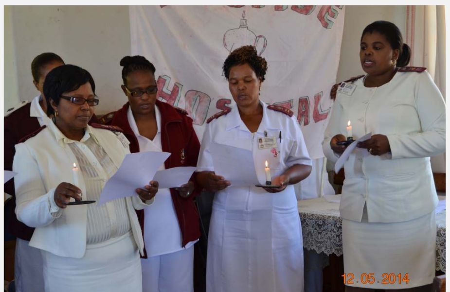
Nursing Management and staff reading nurses pledge during International Nurses' Day commemoration

Fighting Disease, Fighting Poverty , Giving Hope