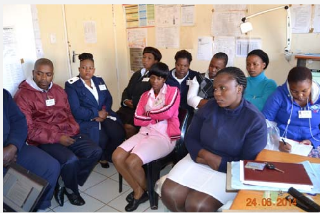
Staff members listening attentively during the training