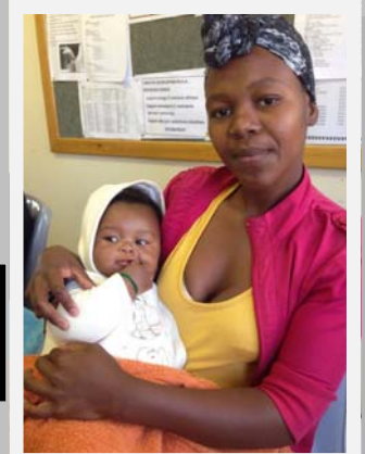
Mother and the baby who were participants

Mothers were given tips on breast self examination if you are in front of a mirror you must stand with the arms relaxed at the side and neck for changes in the color, size or shape of the breast. Now raise both arms above the head and check if both breast rise together. If there are changes in the breast including lumps or swelling contact a health professional for further investigation. Never postpone seeking help it might not be cancer but all lumps must be checked immediately.