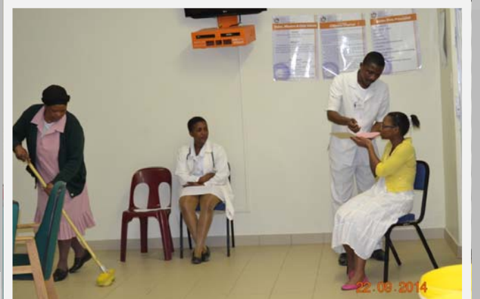
Staff members doing a play on infection control