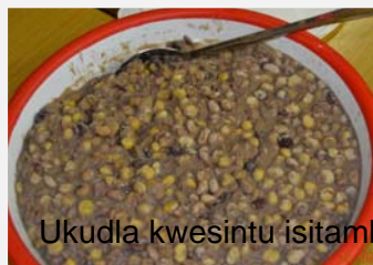
Ukudla kwesintu isitambu kanye nedombolo