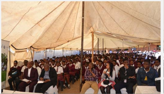
Audience listening to different speakers during career EXPO