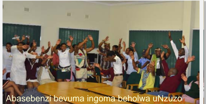
Abasebenzi bevuma ingoma beholwa uNzuzo