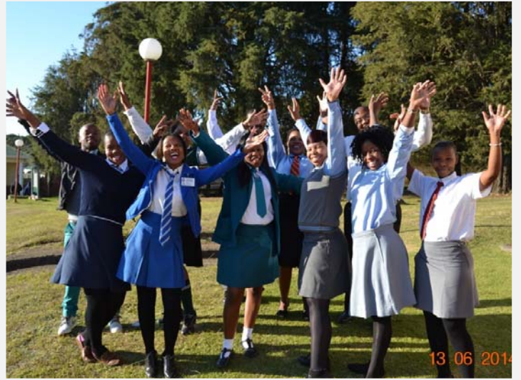
Ekombe Hospital staff commemorating the day in style

After 20 years of democracy we also acknowledge the heroic of the likes of Hector Pieterse and Tsietshi Mashinini to mention a few. We are humbled by the contribution of the class of 1976 in liberating this country.