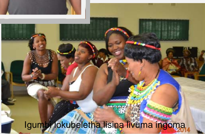
Igumbi lokubeletha lisina livuma ingoma 25/09/2014