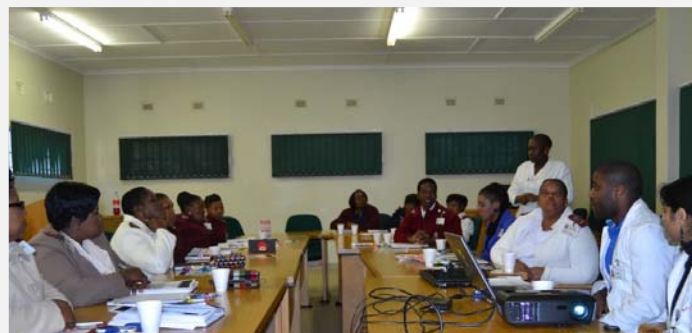
Clinicians listening to pharmacy presentation on antibiotics