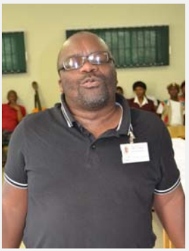
Isikhulumi sosuku uMnuz. Ngidi ekhuluma ngokus- etshenziswa kolimi