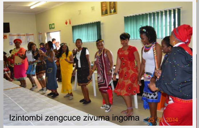
Izintombi zengcuce zivuma ingoma 25/09/2014