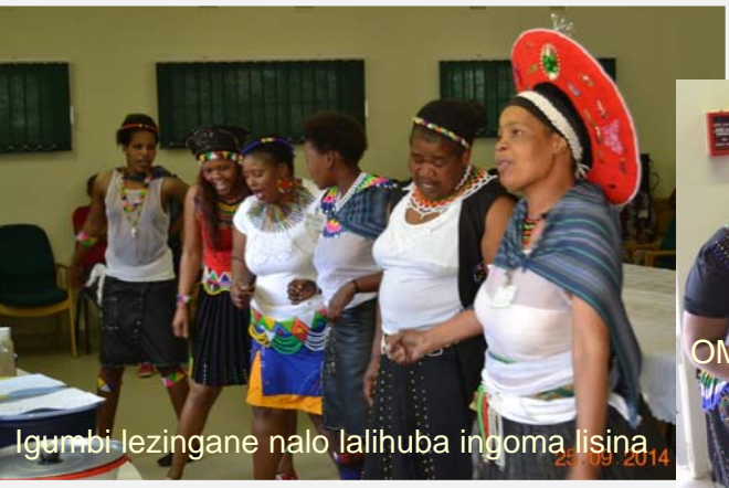
Igumbi lezingane nalo lalihuba ingoma lisina 25/09/2014