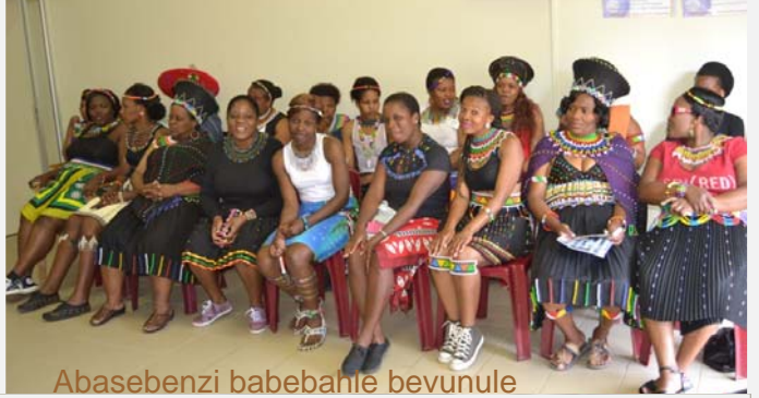
Abasebenzi babebahle bevvunule

Iminyango eyahlukene yasesibhedlela yayikhombisa ngamakhono ahlukene kusukela emculweni wesintu, idlamu. Iminyango kokwehlukana yapheke ukudla kwesintu okunhlobonhlobo Isikhulumi sosuku sakhuluma ngendlela okuyiyiyona noma elungile yokusebenzisa ulimi lwesiZulu. Sithanda ukubonga bonke abenza lolusuku lubeyimpumelelo uNkulunkulu anibusise.