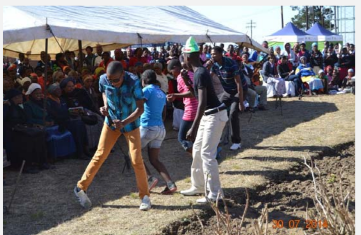
Local music group entertaining the audience