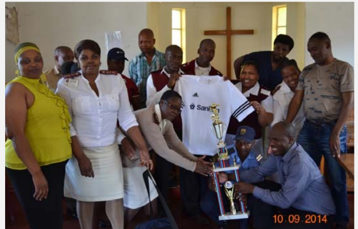
Sport committee handing over the trophy to hospital management

Ekombe Hospital soccer won all the games till they reached the final where they were crowned champions after beating Eshowe Hospital. Our netball team came second place after they were beaten by Eshowe Hospital in the final. Ekombe sport committee would like to thank the management for the support and the district office for planning the wellness day.