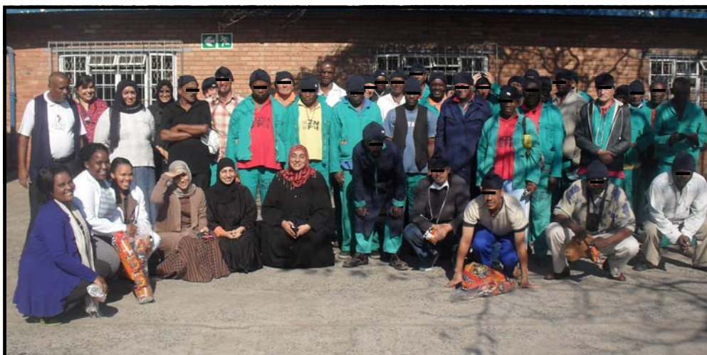
Above: Community Womans Organization representatives and staff from our medical team with section 4 MHCUs