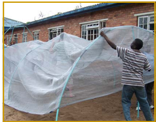
Above: Students helping with the setting up of the veggie tunnel