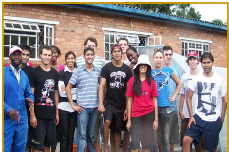
Above: Students from WITS University involved in the setting up of the tunnel and the planting of the spinach