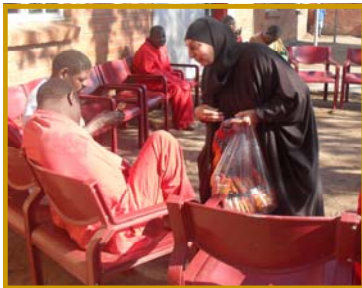
Above: Section 2

The medical team, in collaboration with a few concerned community organizations, initiated a project to provide Mental Health Care Users (MHCUs) with beanies.