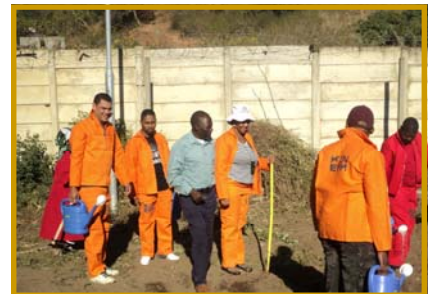
Above: Nursing rehabilitation & agricultural department involved in the gardening project