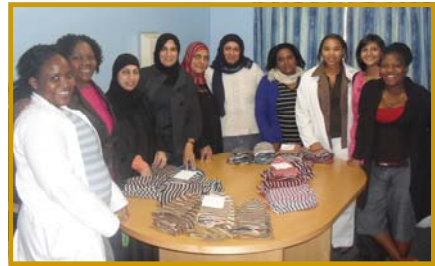
Above: Getting ready to give out the beanies.

We would like to thank all those who generously donated in cash and toward this project.