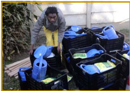
Above: Gardening equipment was donated to assist with the gardening project