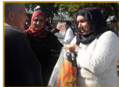
Right: Community Womans Organization representatives