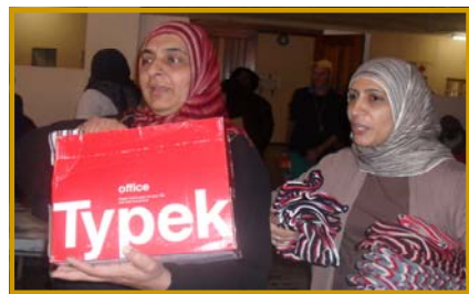
Above: Handing out of beanies and refreshments to the MHCUs