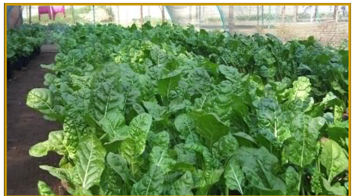
Above: Spinach crops