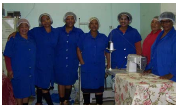
Above: Laundry staff