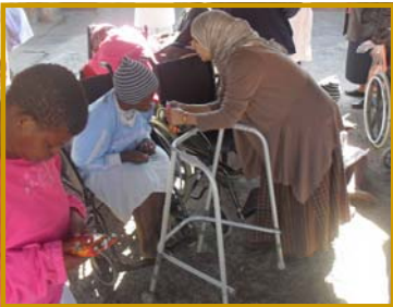
Above: Section 1