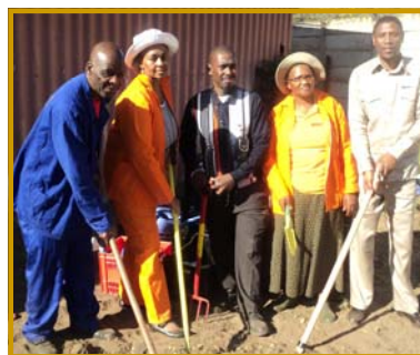
Above: DOH staff joining the Gardening initiative