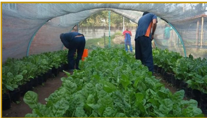
Above: MHCUs working in the veggie tunnel