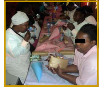
Above: MHCUs enjoying refreshments and receiving gifts at their birthday celebration