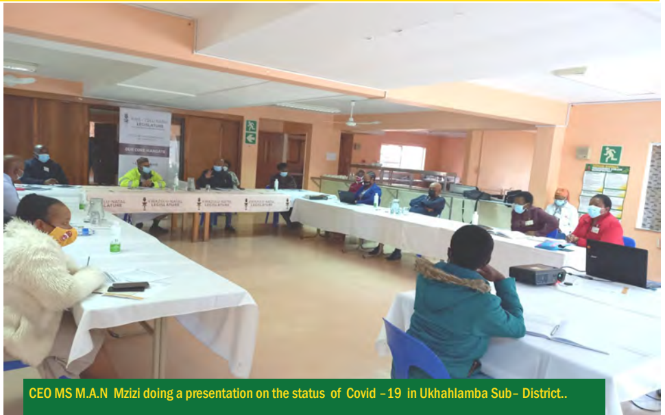
CEO MS M.A.N Mzizi doing a presentation on the status of Covid -19 in Ukhahlamba Sub- District..

A walk about was also conducted to put theory into practice and the site that was visited was the Vaccination site within the facility and the external sight in Bergville ( Sport Complex). Staff working in the vaccination sight took the delegation through the different stations that one goes through when coming to be vaccinated. Mobilization strategies as well as data collection and verification were the main topics as it was emphasized that a demand needs to be created as people are reluctant to come and vaccinate as the social media has negative stories about vaccination so a turn around strategy should be devised so that more and more people will make their way to vaccination site. The Budget was also discussed as a large portion of the budget had to go