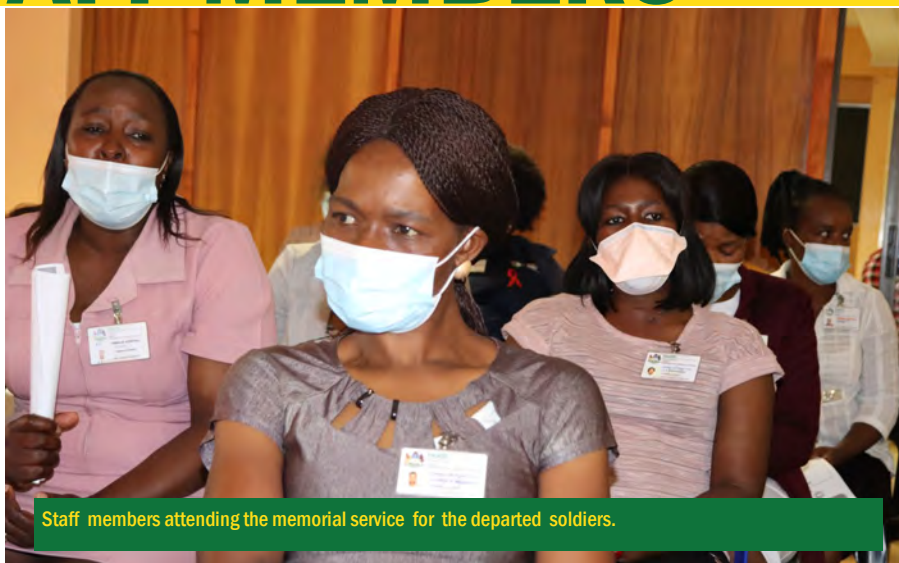
Staff members attending the memorial service for the departed soldiers.

In closing she thanked the bereavement committee for organizing the memorial service even though the funerals had been held already.