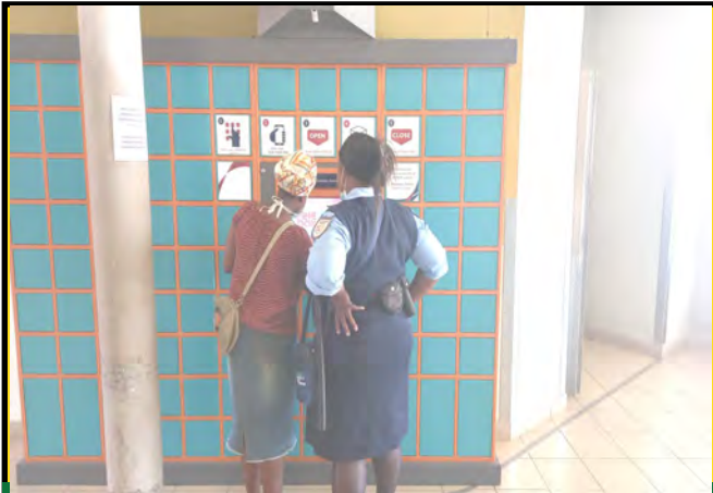
Pele box fully functioning as a client is assisted to get her medication.