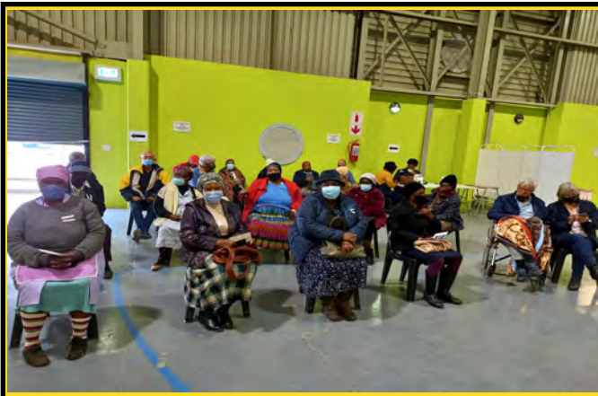
People at one of our Covid -19 vaccination site, after having received the vaccine.