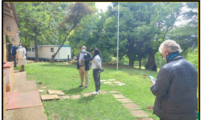
Managers checking the project of renovating staff residencies as part of staff re tainment .