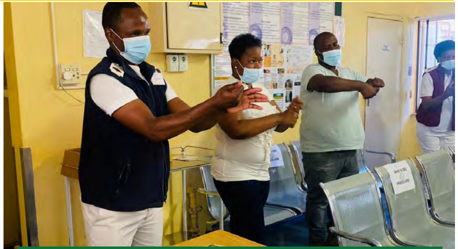
Staff members from MpiLOYethu Clinic demonstrating the steps for hand washing .