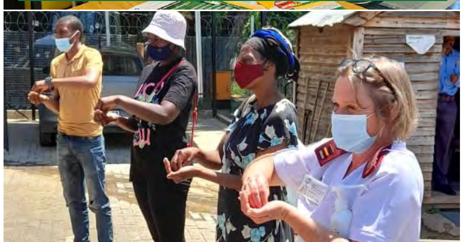
Patients and staff members from Burgville Clinic were also visited and reminded on the importance of washing hands. Below are pictures that show that washing of hands is everyone's business.