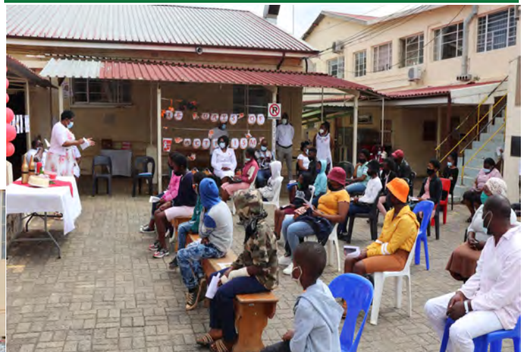
Patients listening to different speakers on the day of the event .