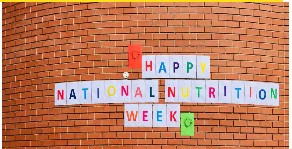
Display on the Pharmacy wall

Nutrition Week was from the 9- 19 th October 2021. The dieticians ran a nutrition week competition (Recipe competition) All participants and winners received gifts and certificates. There were display areas put up around Emmaus Hospital to spread awareness of National Nutrition Week. Posters, badges and pamphlets were made to promote nutrition education. A school and crèche visit was also conducted to re- enforce our National Nutrition Week theme which was: “Eat More Vegetables and Fruits Everyday” . We would like to thank all of those who participated in the competitions that we were running.