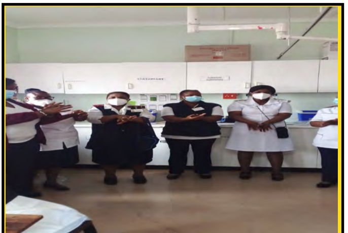
Gateway clinic doing the hand washing steps .