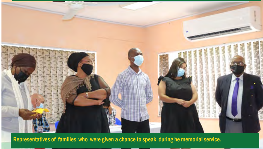
Representatives of families who were given a chance to speak during the memorial service.