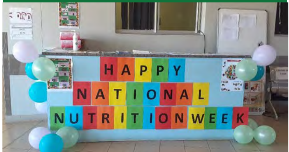
feugiat nulla facilisis at vero eros et accumsan et iusto odio dignissim qui blandit sent