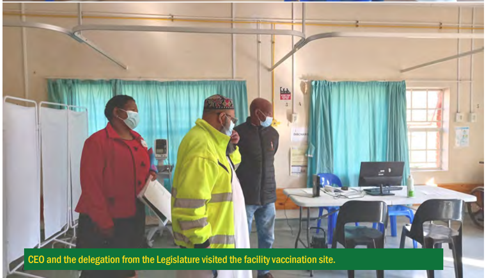
CEO and the delegation from the Legislature visited the facility vaccination site.

to Covid -19 so that the hospitals are ready to provide holistic services to clients. The Legislature team also emphasized that the Management team must also make sure that staff members are working under safe conditions and making sure that protective clothing is provided for all staff members at all given times, that is the role of the