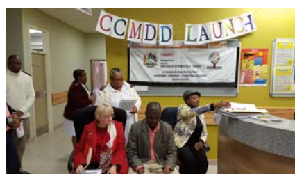
CCMDD Launches READ MORE ON PAGE 04