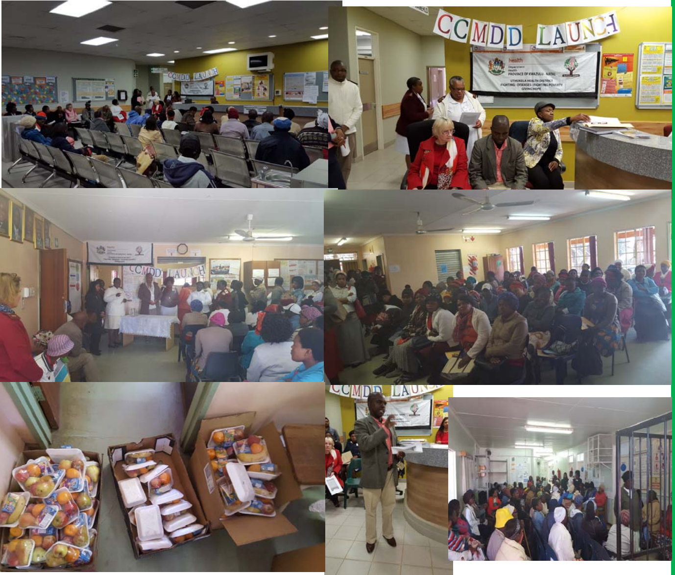
1. Emmaus hospital OPD. 2. Management and hospital board chairperson. 3. Launch at Bergville clinic. 4. Clients at Bergville. 5.

The central chronic medication and dispensing and distribution launches happened in all the clinics. This program aims at decreasing patients who are stable and on chronic medication who only come to collect their treatment every month. For 5 months then return to clinic on the 6th month for new prescription.