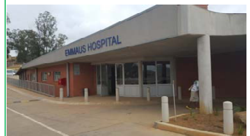
New Building READ MORE ON PAGE 09