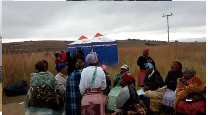
1. Cervical screening. 2. LGBTI testing station. 3. Hypertension and diabetes screening. 4. Tents for screening. 5. Group of clients

On the 22 June 2016 Emmaus Hospitals Mpiloyethu clinic conducted an Outreach programme in the Stulwane area of Emmaus. Joined by Health systems trust (HST) UThukela District and LGBT Ladysmith, the following services were rendered: