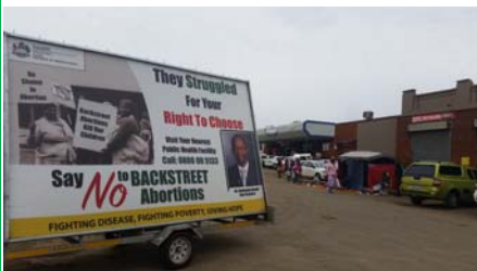
Anti-abortion Campaign READ MORE ON PAGE 1