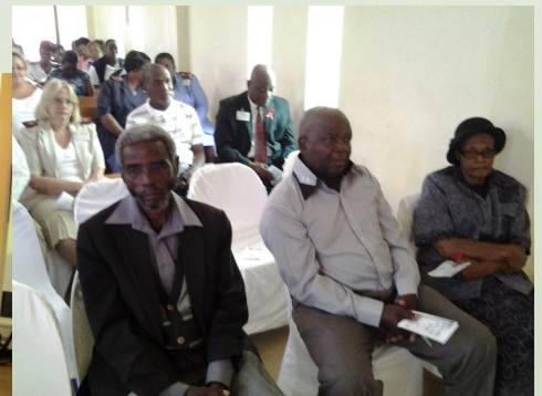
Hospital board members that attended the function.