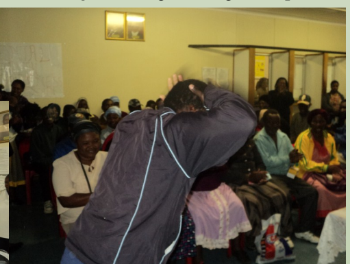
A patient dancing