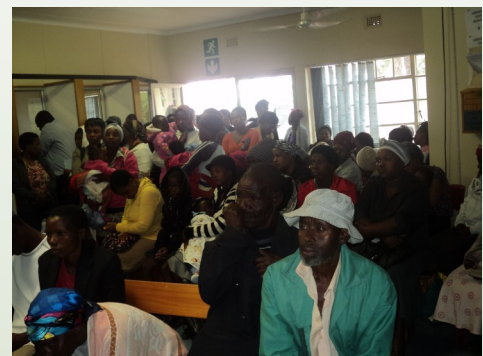
The patients listening to the messages.