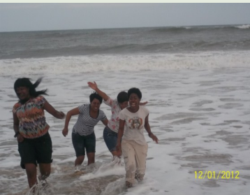
Ladies @ St Lucia beach

We as Emmaus hospital ladies used to have trip to Durban yearly but this year we decided to change Durban to Richards Bay (Heritage Site). The reason for this trip as ladies is to be united and form a ladies support group at Emmaus Hospital. We drove from Emmaus Hospital on the 30 November 2012 early in the morning round about 07H00 am via Durban and arrived in Richards Bay at 20H00 and checked in at Seagull Lodge where we arranged our accommodation for the whole weekend . On Saturday on 1 st of December 2012 we went to Hluhluwe Game Reserve the largest (Siqiyi) in south Africa where we have seen all different types of animals from there we went to ST Lucia at Simgaliso for Cruising. Whilst on the Cruise we saw the biggest different families of Hippo's in South Africa from there we went to St Lucia Beach to swim . On Sunday we went to Richards Bay Mall for shopping from there went back to Emmaus Hospital via Durban. We spent time in Durban as we went to north beach and UShaka marine where we had all the funny and from there went to last mall Pavilion from there we drove to Emmaus Hospital . Next year we are also planning the ladies trip to Sun City in Rustenburg. .Lastly we would like to thank God for our successful trip and keeping us safe in our journey. WALALA WASALA WAVUKA WAZISOLA LETS DO IT AGAIN NEXT YEAR!