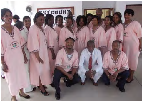
Hospital CEO with the hospital choir