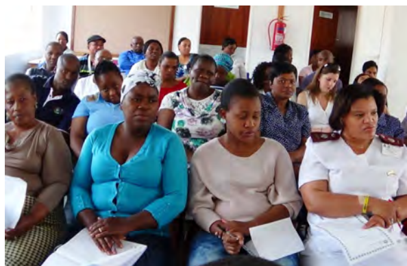
Attendees listening attentively to speeches made on the day.