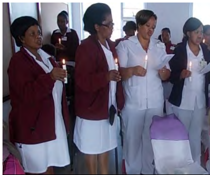
Nurses with their lit candles