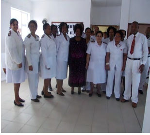
On the cover Launch of wearing of white uniform on nurses day