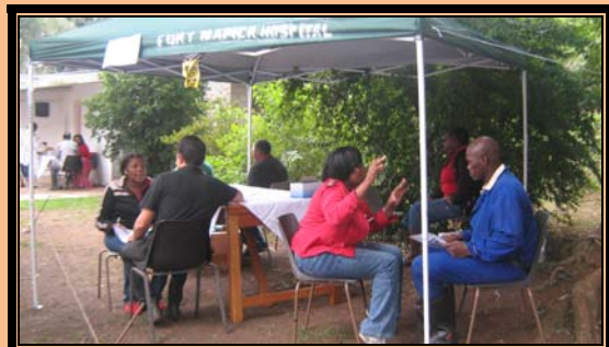
Pre counseling site