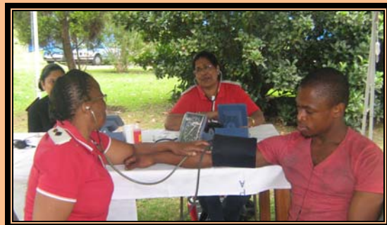
BP testing site