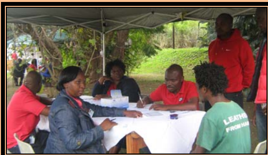
Mental illness counseling