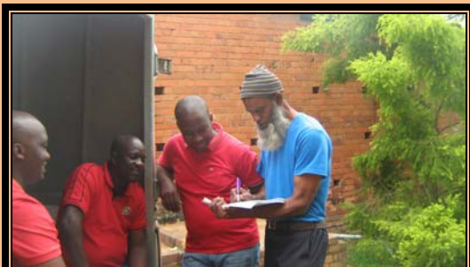
Registration done by the technical team