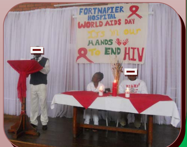
A MHC user delivering a poem