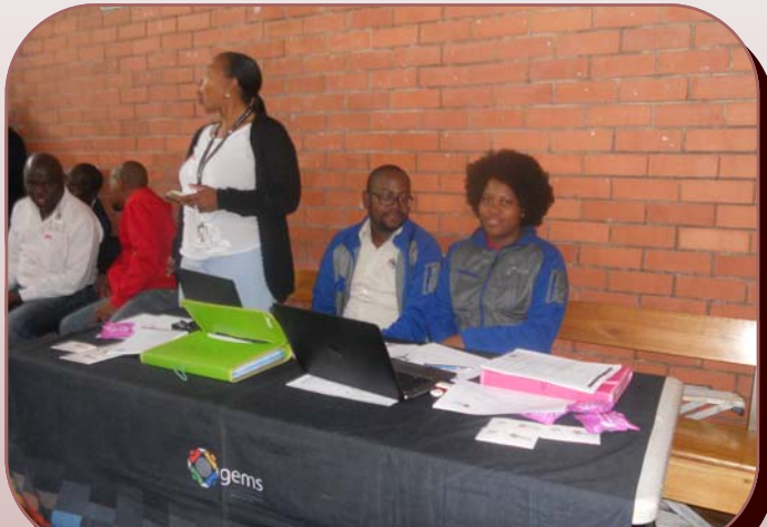
Gems representatives also attended the event