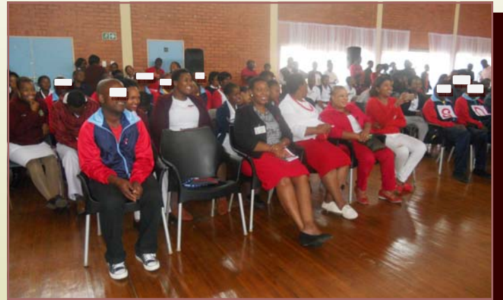
Attendees of the event