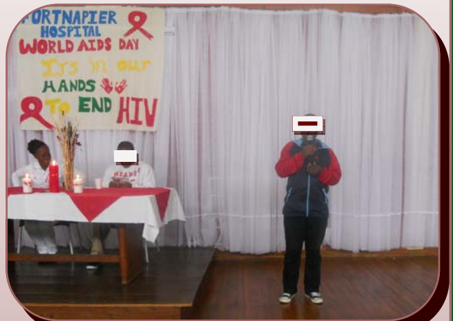
A mental health care user graced the event with a soulful song