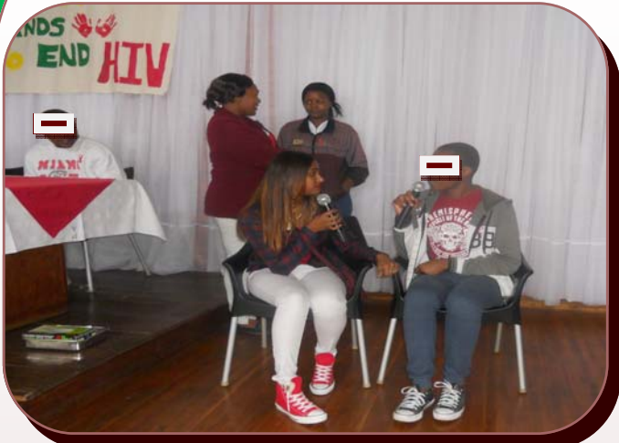
A play performed by a Mental Health Care User and Students