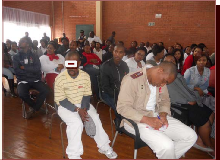
Attendees of the event