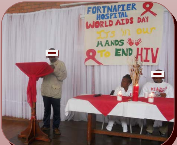
A MHC user delivering a poem