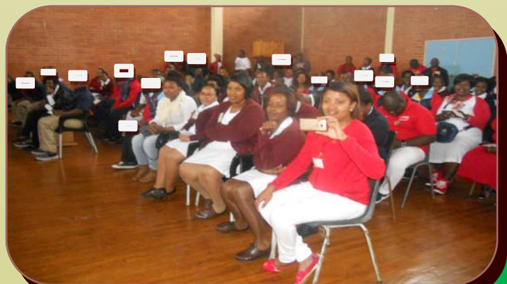
Attendees of the event