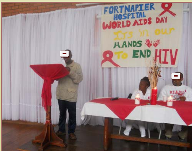
An MHC user delivering a poem