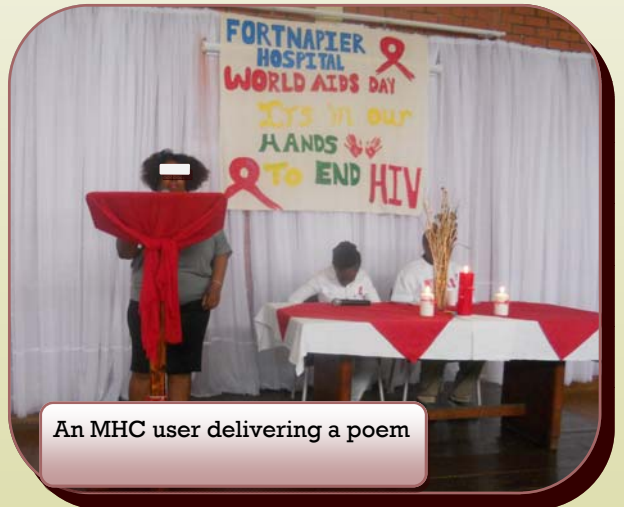
An MHC user delivering a poem