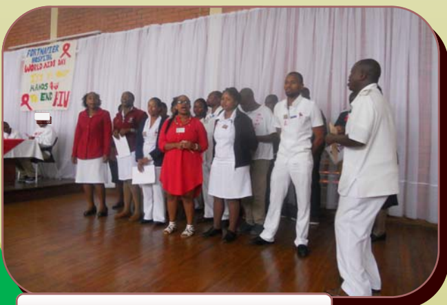
A performance by ward 7 students