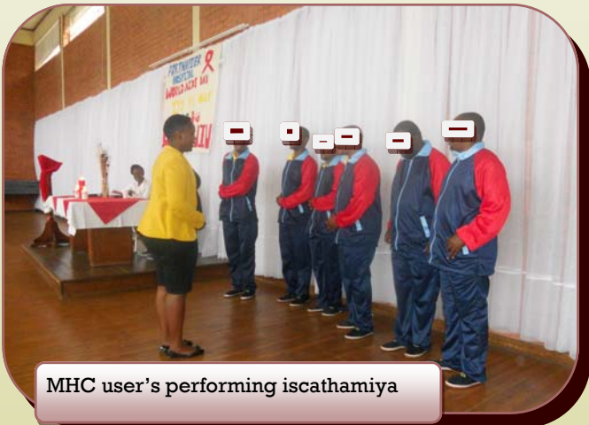
MHC user's performing isicathamiya