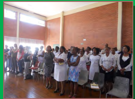
Attendees of the event