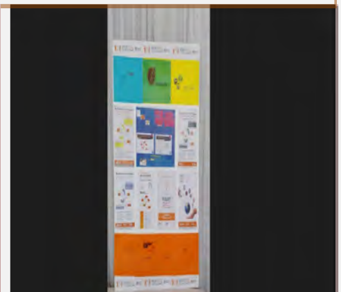
Poster and educational material on antibiotic resistance and the 5 moments of hand hygiene for wound, catheter, peripheral line care provided by the IPC department.