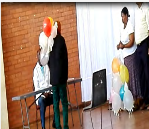
The patient does not take his medication properly due to poor health education. The patient develops antibiotic resistance and germs can now multiply in his body.