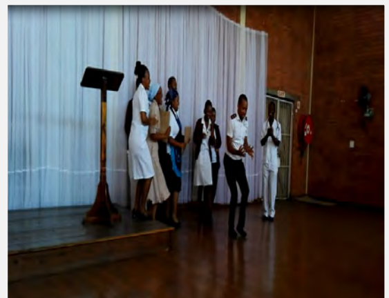
Staff are saying: clean your hands and save a life.