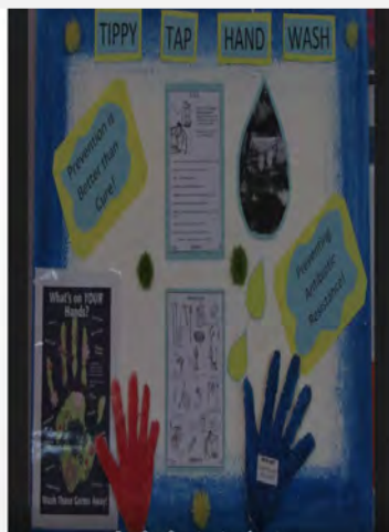
Poster done by the OT department.