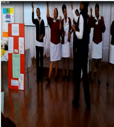
Staff of Fort Napier are saying hands off to unclean hands

Fort Napier Hospital also did a community outreach at the Imbali Mental Health workshop on the 29 th March 2017. The audience consisted of approximately 90-100 MHCUS. The IPC team discussed the importance of hand washing, the problem of antibiotic resistance and prevention of tuberculosis. The visit was well received by the community of mental health care users. Further outreaches are planned and we would also like to teach communities about the tippy tank.