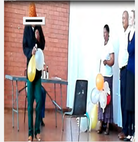
Patient sees the doctor for a commonly treated infection, no health education is given to the patient on how to take the antibiotic prescribed nor on important infection prevention measures.