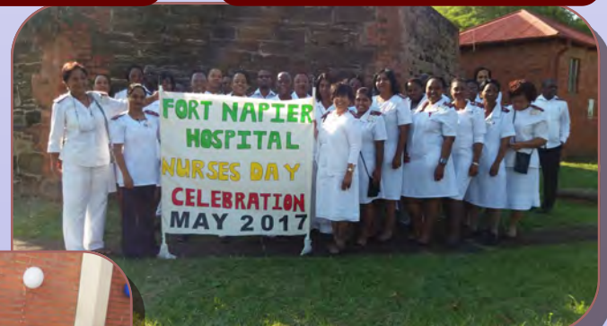
FNH nurses looked like angels