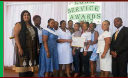
Aerobics team received an Award