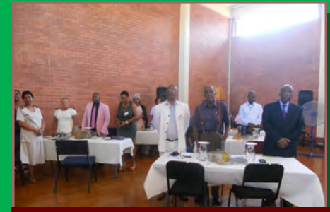
Hospital Board Members