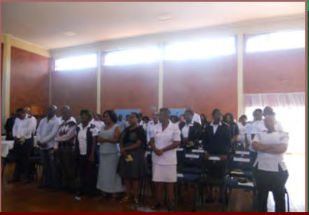
Recipients of Awards