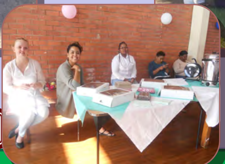
OT Department supported the event