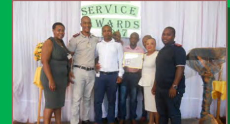
A Soccer Team received an award for their participation