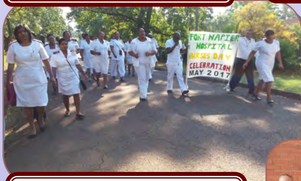
FNH nurses marching to the hall where the main event was held.