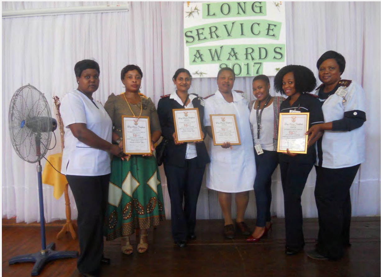
Staff members posing with their Long Service Awards

On 30th March 2017 Fort Napier hospital held a Long Service Award Ceremony. The ceremony celebrated staff members who have served the public sector for ten years, twenty years, thirty years and forty years. The event was organized by Human Resources department working together with the Health Promotions Committee. On the day the Hospital Choir entertained our guests with musical items which were enjoyed by everyone who attended the event.