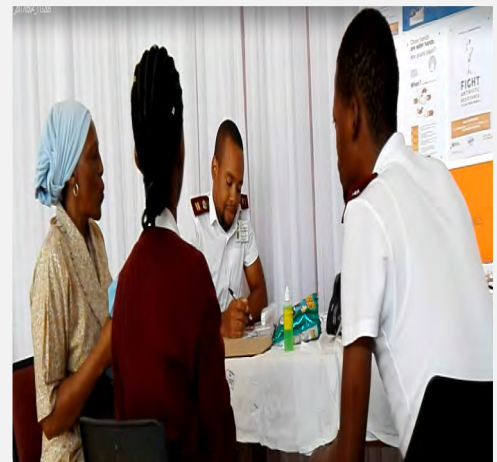
A play showing missed opportunities for hand hygiene. Staff do not practice hand hygiene at any time during interaction with the patient.