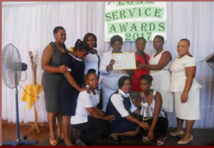
The Netball team received an Award for their active participations in sports