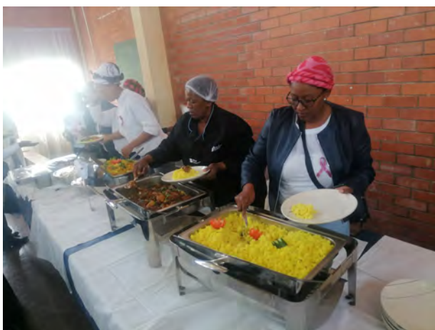
Women dishing out meals during the event

On the 18 August 2022 , Fort Napier Hospital celebrated International women`s day at 9C Hall.