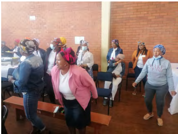
Women singing songs during International Women's Day