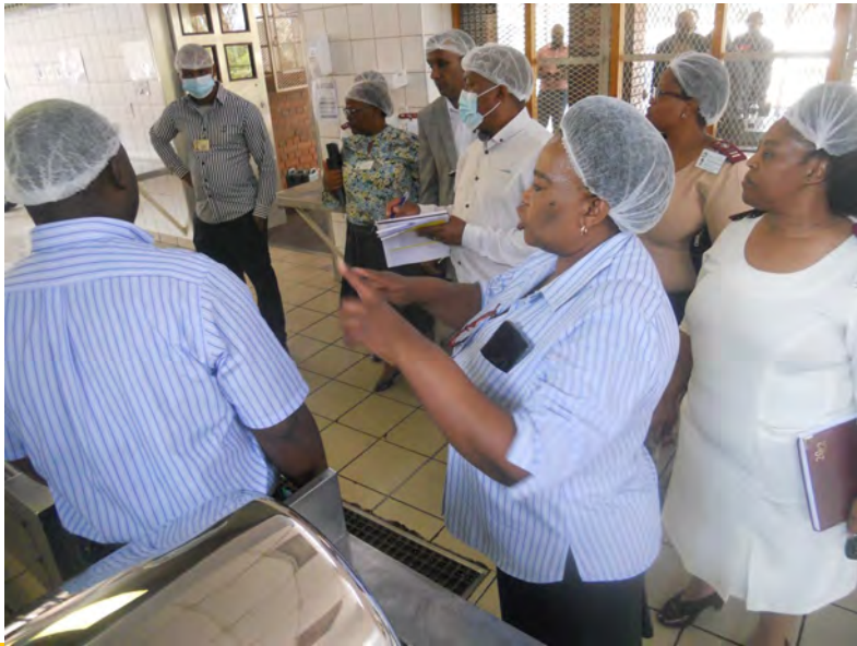
Health Portfolio Committee with Kitchen Service Manager doing inspection at kitchen