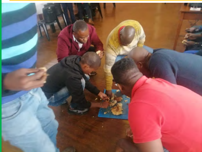
The men eating