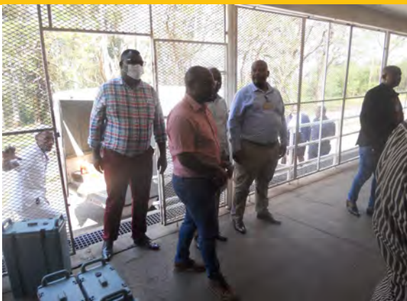
Health Portfolio committee visiting the hospital kitchen