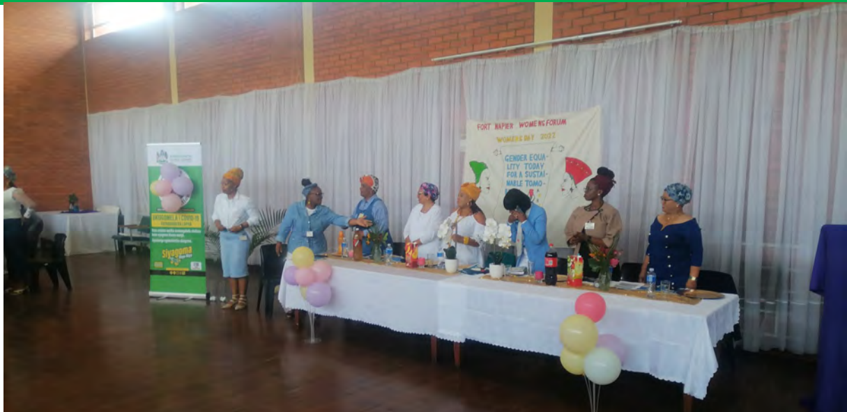
Staff celebrating International Women's Day