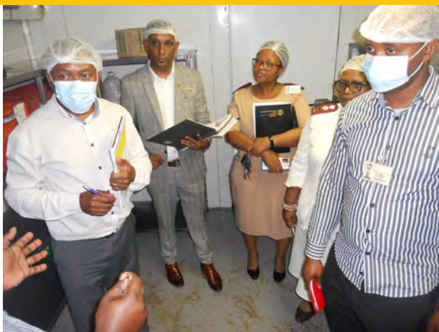
Health Portfolio Committee , Hospital and District Managers inspecting the hospital kitchen .

The Portfolio Committee on Health is a National Assembly of South Africa committee established to oversee the work of the Department of Health .