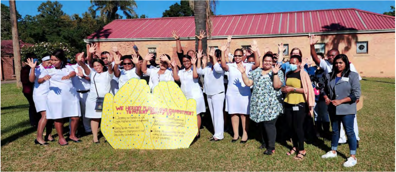
Staff celebrating International Hand Hygiene Day