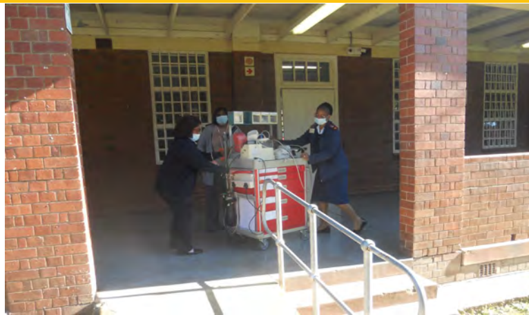
Ward 10 A staff pushing the emergency trolley during a fire drill