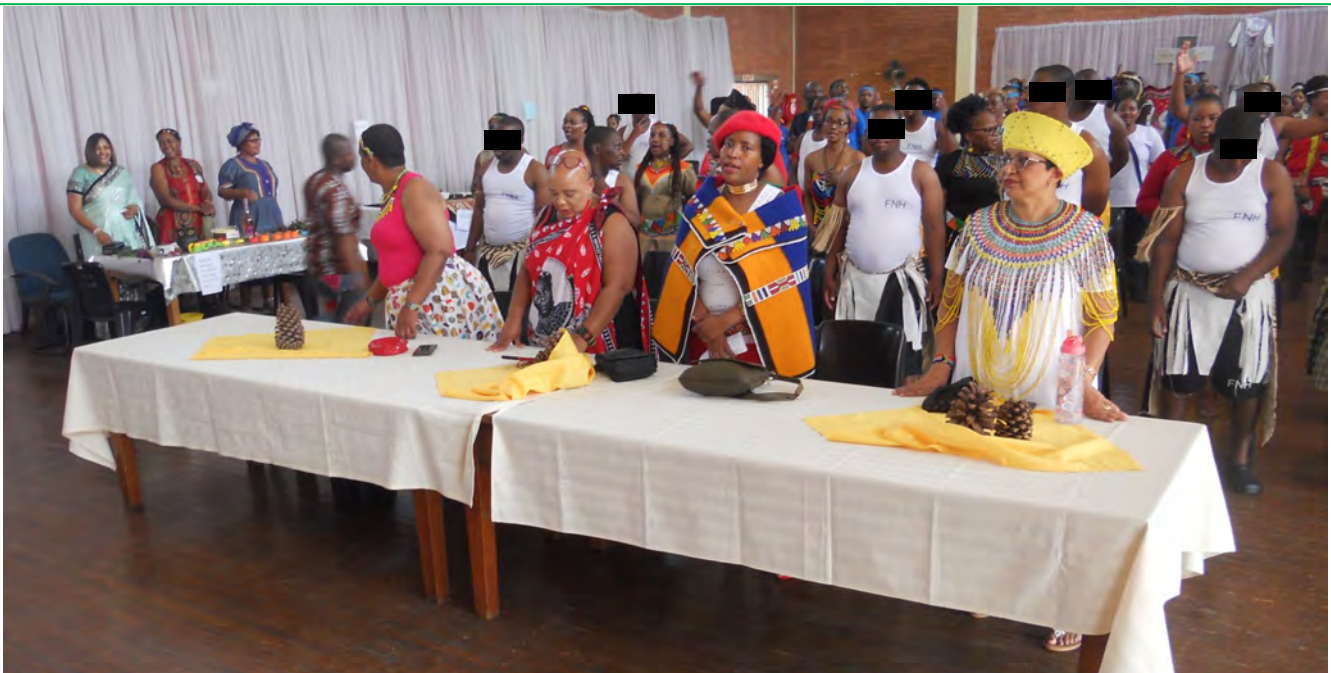
Fort Napier Hospital Management (Exco)