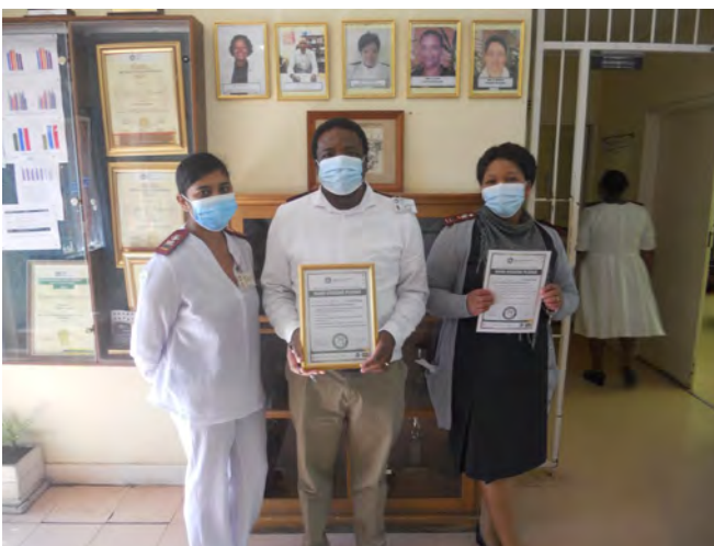
IPC manager( left hand) awarding hand hygiene pledge certificate

Fort Napier Hospital commemorated hand hygiene day by doing an outreach at Gateway Christian school on the 26th and 29th April 2022 . The learners were taught the correct handwash and hand rub procedure . The learners were asked questions and told to demonstrate the hand hygiene procedure and had an opportunity to win prizes .