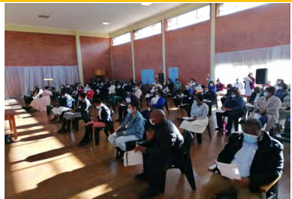
Staff at 9 C hall for staff Imbizo

The imbizo ended with both management and staff agreeing that what ever issues that had been raised were going to be resolved with the urgency it deserve.