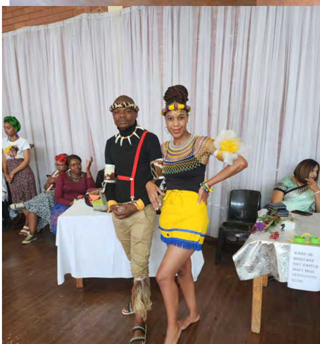
Heritage Day best dressed male and female