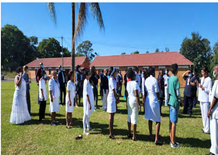
Staff participating in a hand rub relay