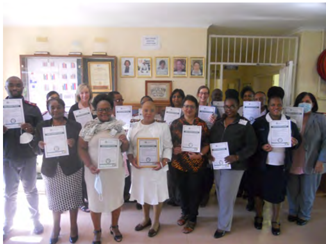
Managers awarded hand hygiene pledge certificate