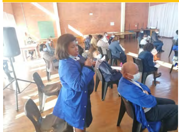
Laundry staff asking management a question