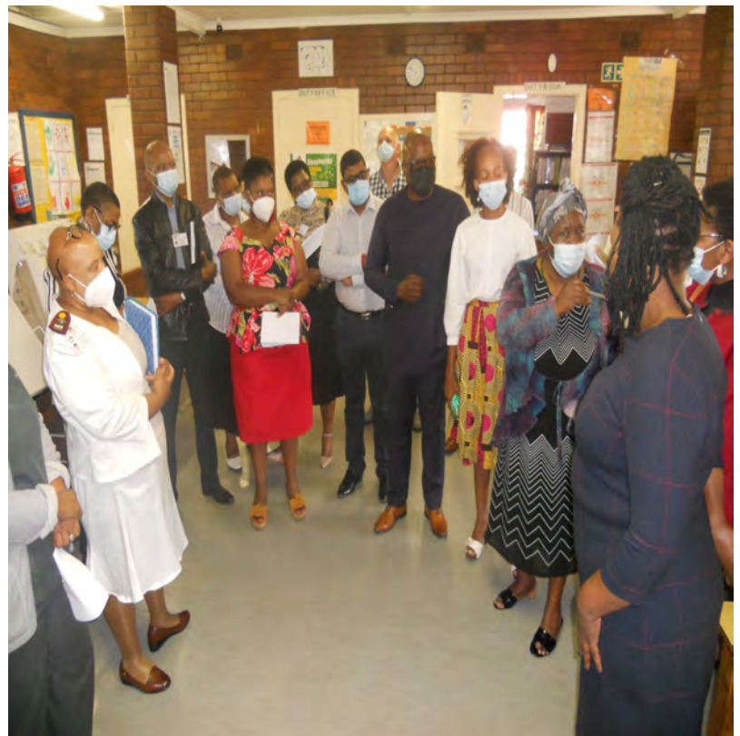
Member of the Portfolio committee addressing management

The walk about ended with a debriefing at the hospital boardroom where the Portfolio Committee raised other concerns about the appointment of Hospital Board committee and poorly maintained grounds .