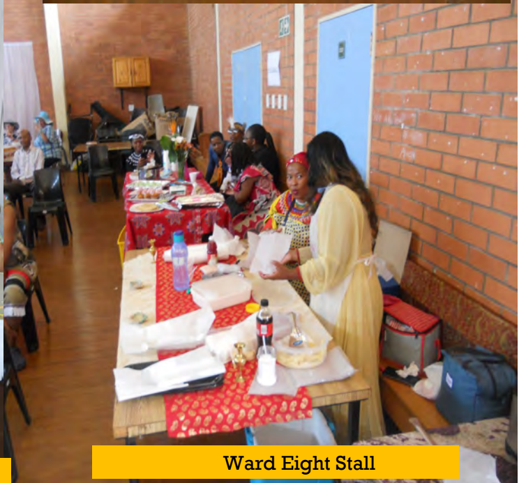
Ward Eight Stall