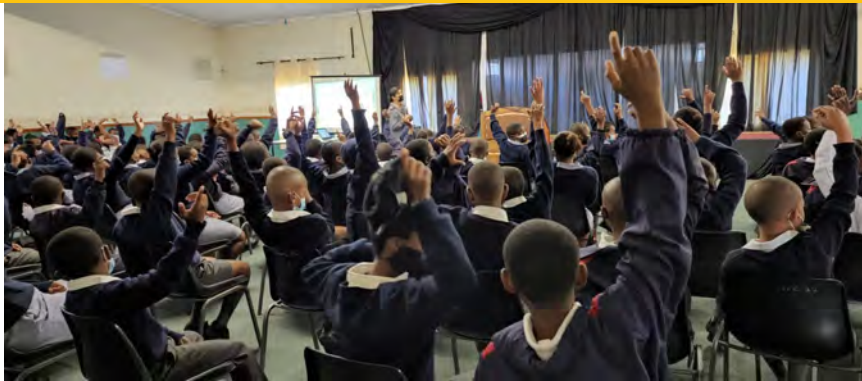
Learners raising their hands to answer questions about the handwash technique