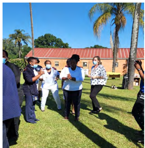
Staff demonstrate the handwash rub technique