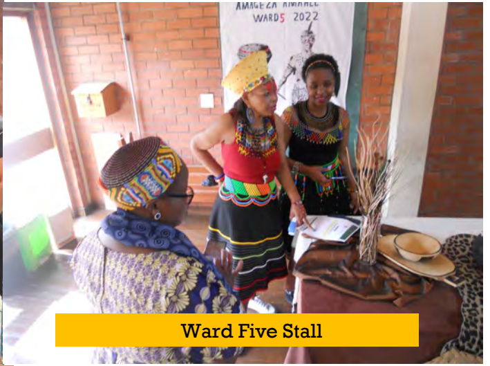
Ward Five Stall