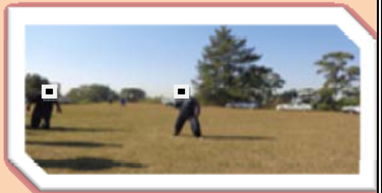
Short put in action