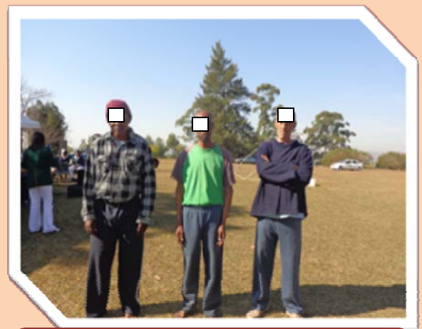
The winners of the men's 100 meter race from first place second and third.