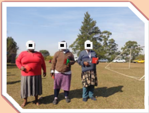
The women's 100 meter race winners, with their gifts from NEHAWU.