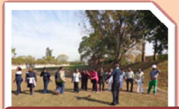
Staff member on the starting line, getting ready to begin their race.