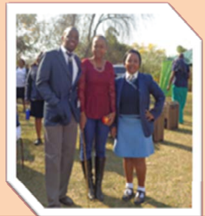
Staff uniformed up as students with their teacher in the middle.