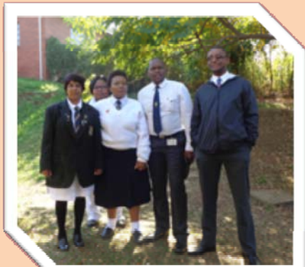
Management all uniformed up, feeling like high school kids again.