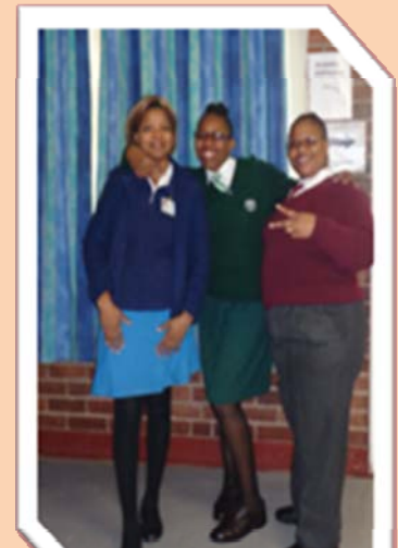
From grey trousers to green and blue uniforms staff looking young.