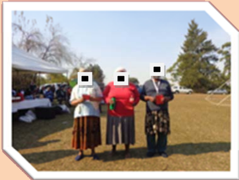
The winners of the women's run with their prizes.