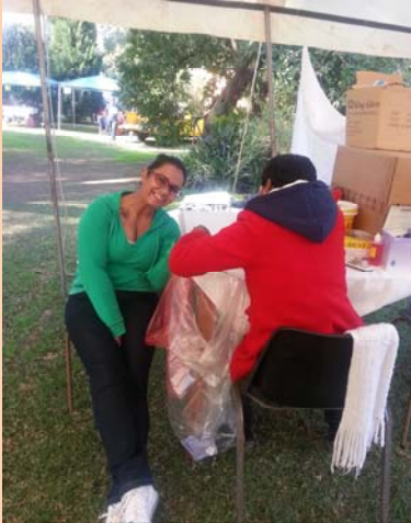
Testing in process