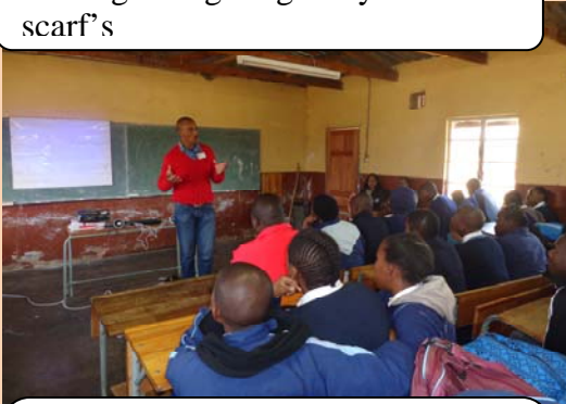
Mr S Mthethwa engaging with students after watching a video on mental health.