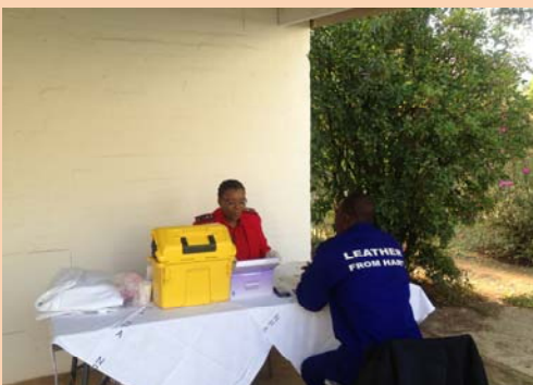
Sr Fihla counseling one of our clients