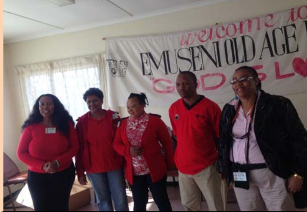
Management Team at Emuseni Old Age