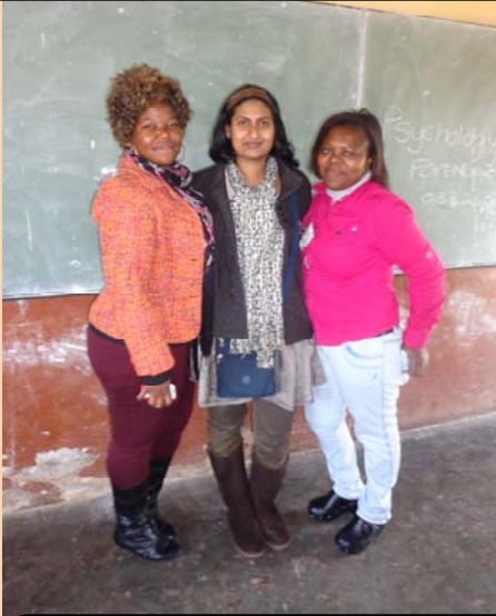
The Health Promotions team after the presentation to the students.