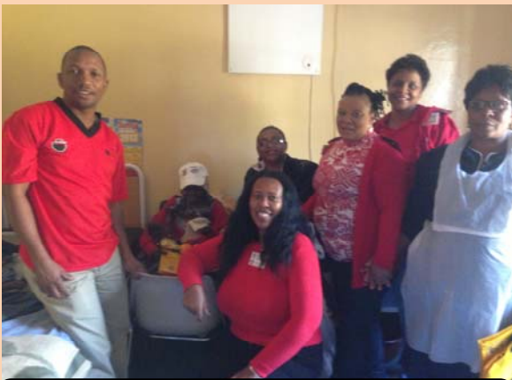
Management also did they part in nursing our senior citizens at the old age home