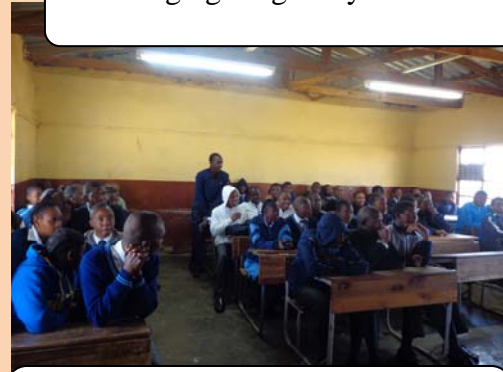
Students asking questions about mental health