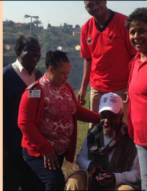
One of the senior citizens was very happy to get a scarf