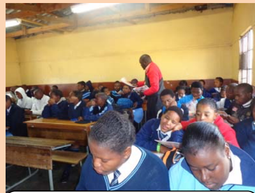
Students receiving text books