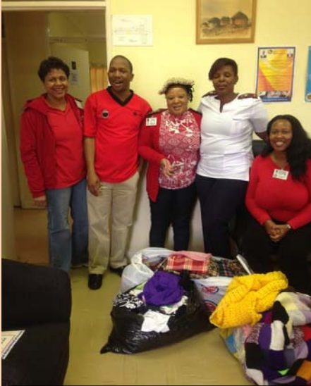
Management team preparing gifts for Emuseni Old Age Home