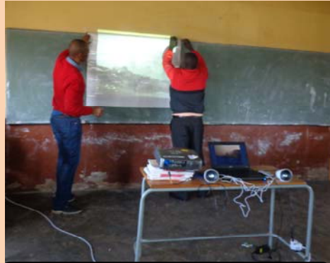
The team preparing for the video