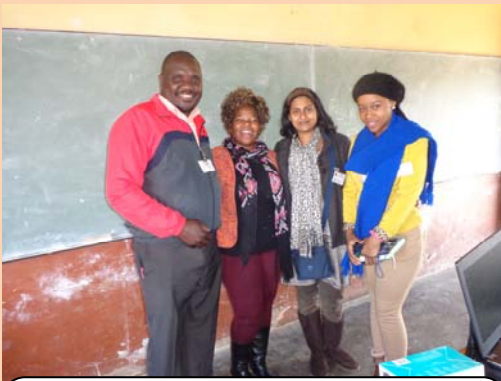
The Health Promotions team, that went to Langalakhe High School.