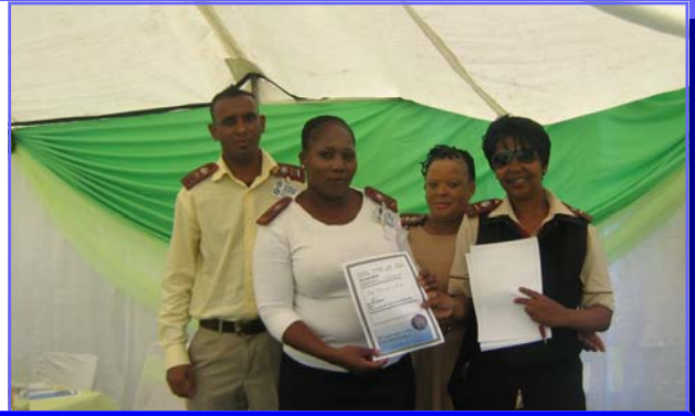
Ward 7 received a certificate for Safe Disposal