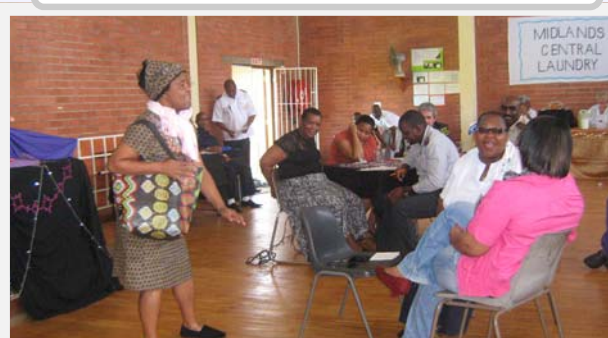
Stage play by Ward 9 B