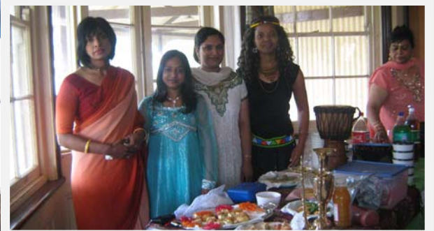
Different traditional food