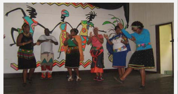
Zulu dance by Ward 15 staff