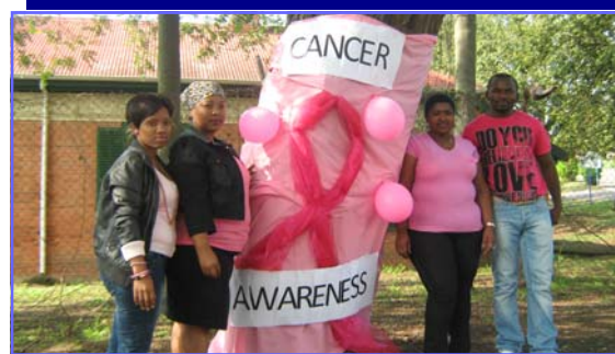
The Health Promotions Committee