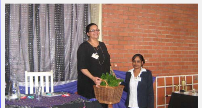
Our honorable guest receiving a present