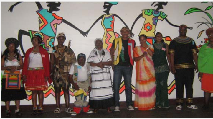
Modeling Competition participants