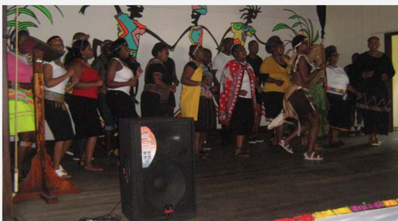
It was all about celebrating our different cultures