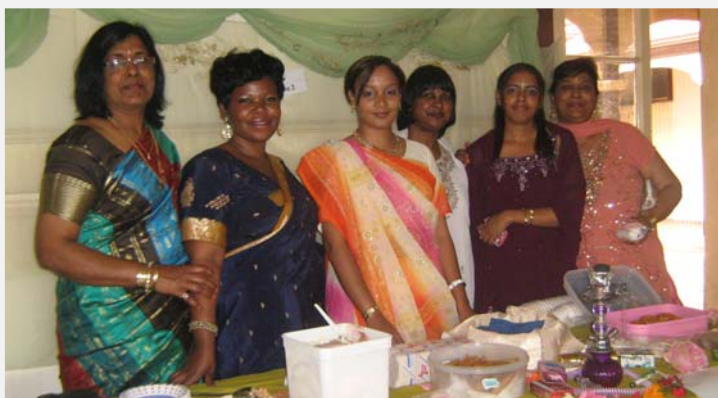
Ladies looking good in their different cultural attire