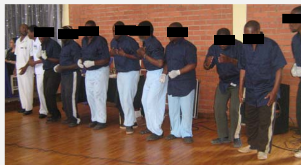
Musical item by patients