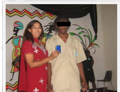
The winner of the Modeling