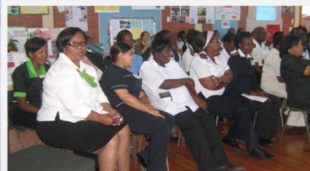
Attendees to the event