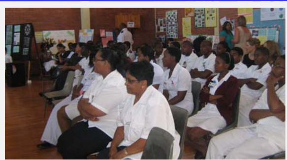
Attendees to the event