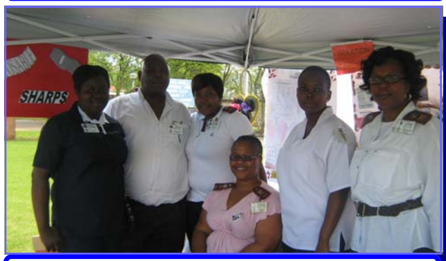
Ward 15 staff in their stall