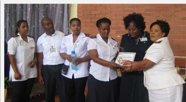
Ward 7 received a certificate