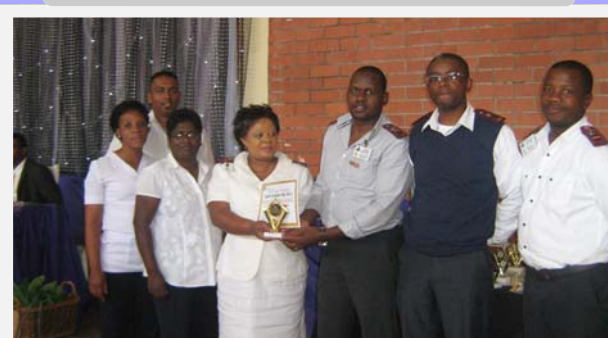
Ward 9A also received a trophy