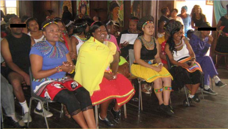
Attendees to the events