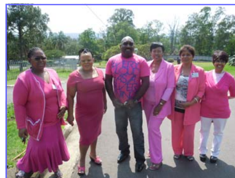
Management leading by example in making an awareness.