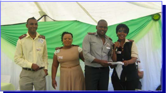
Ward 9A received a certificate