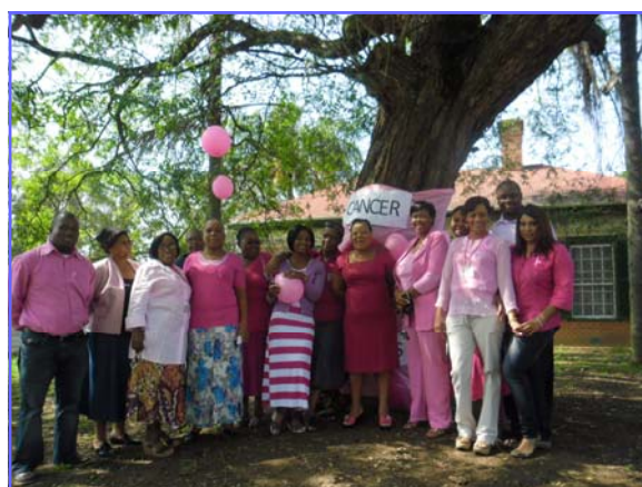
Pink was the color of the day