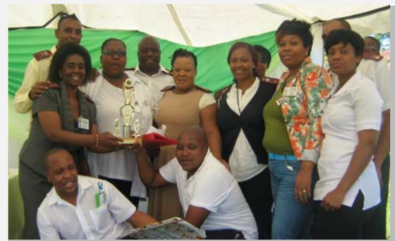
Jovial Staff From Ward 9A with a trophy

Hand washing techniques according to IPC guidelines were assessed to all staff visited. On the 18th October 2012 the IPC Team and the wards organized an event where all wards and department showcased their stalls in terms of IPC. The team devised a tool to measure all participants, those who got a high percentage were given trophies and certificates for their hard work. Sister hospitals such as Umgeni, Townhill and Midlands Hospital were part of the event. The IPC team would like to