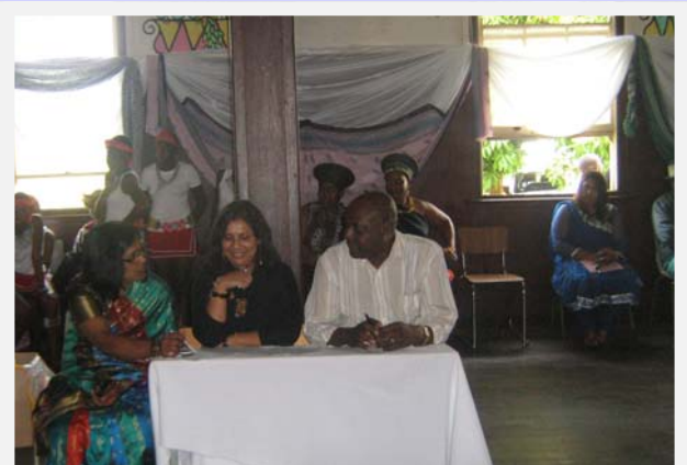
Judges to the modeling competition