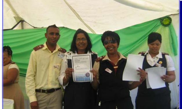
Ward 1 staff received a Certificate