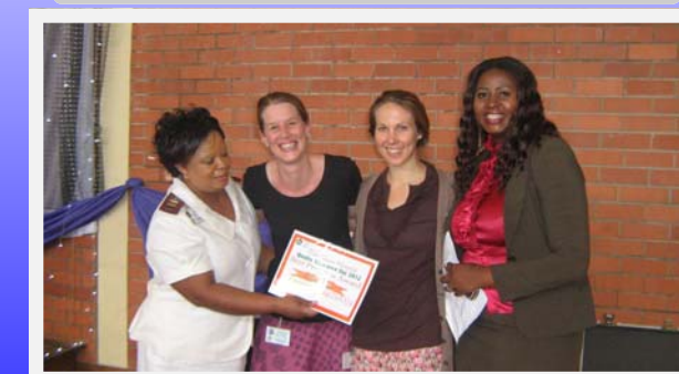
Psychology dept received a certificate