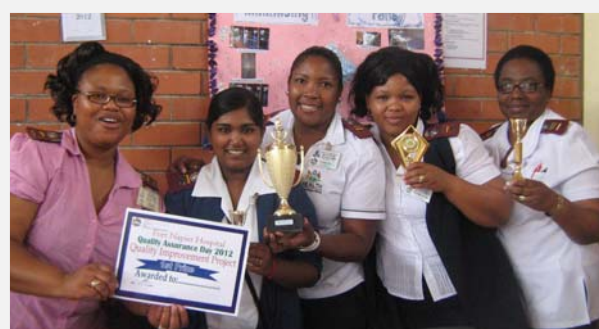
Ward 15 took all trophies