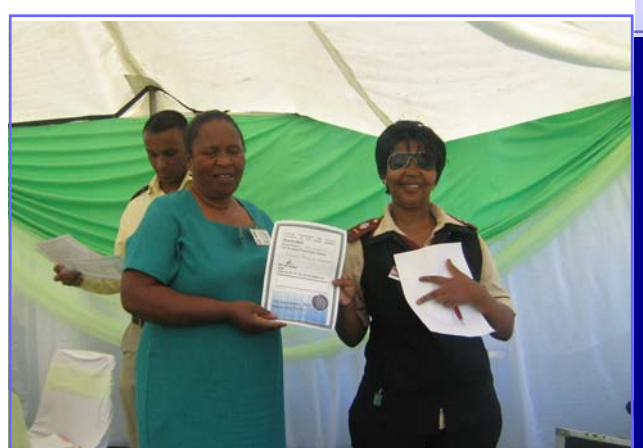
Housekeeping was awarded for participating