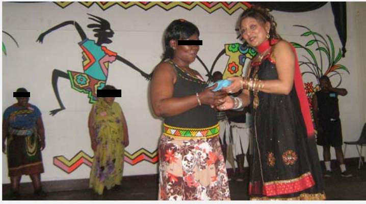
Gifts were given to the winners