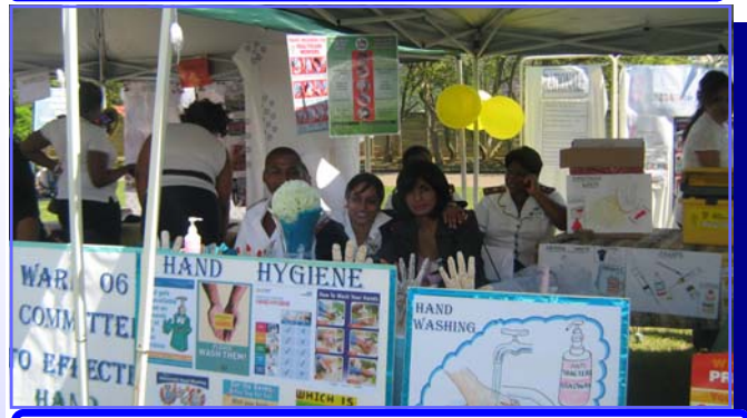
Stall from ward 6