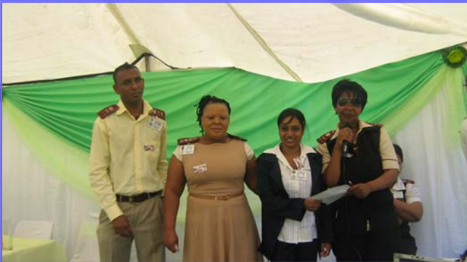
Ward 6 received a certificate for Hand Hygiene