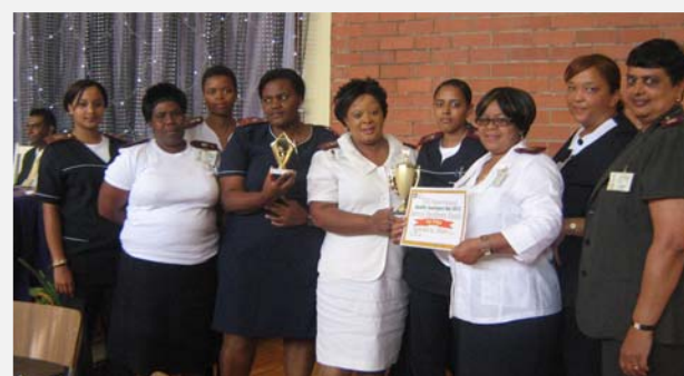
Ward 1 received two trophies