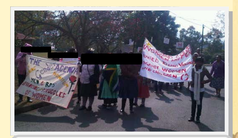
Staff members together with MHCU's staging a march