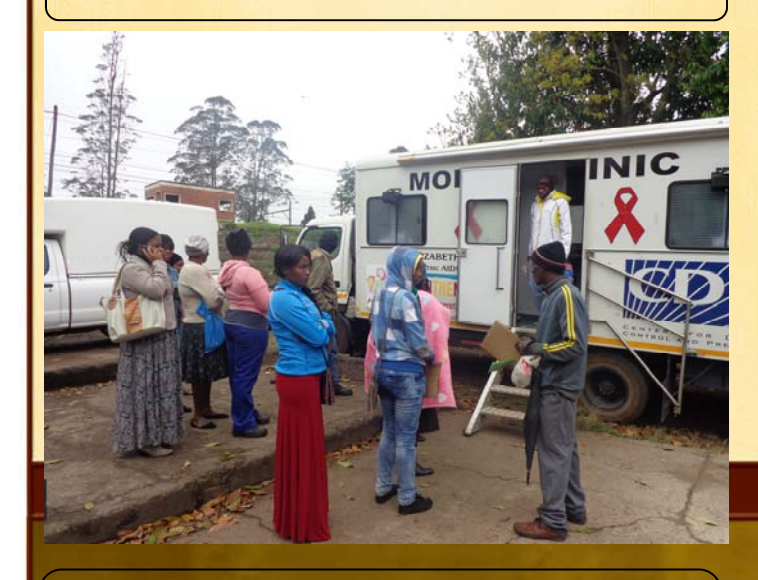
The Mobile Clinic was also available to provide services to the community