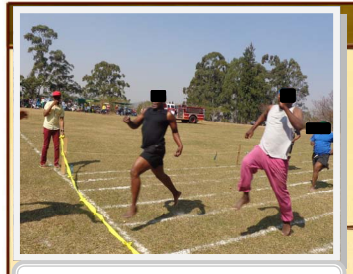
100 meter race for male MHU's