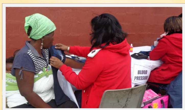
Blood Pressure testing