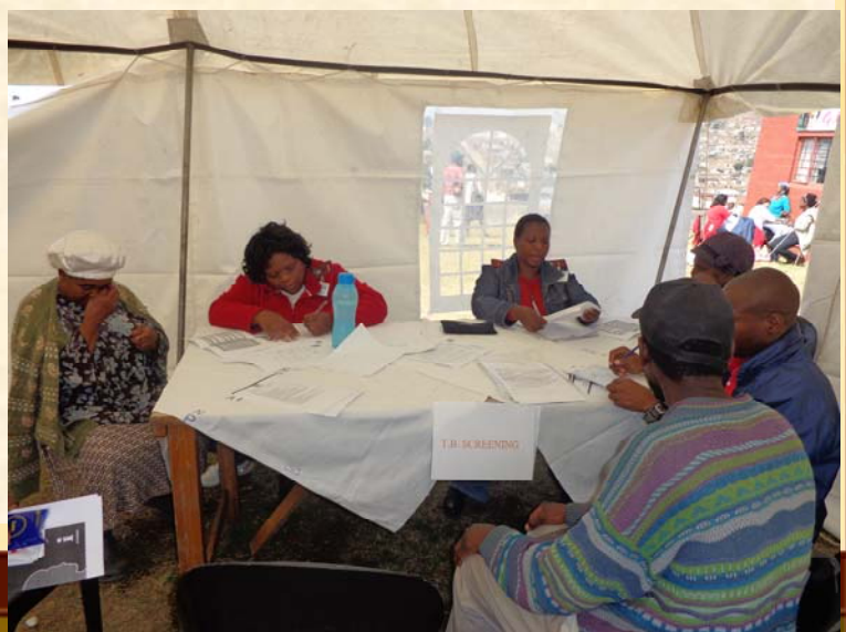
Registration and counseling table