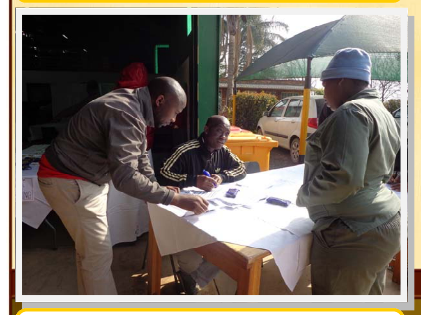
The technical team assisting with registration