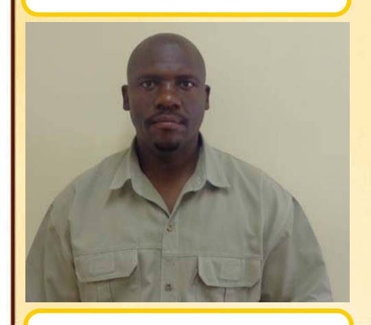
S.S Mhlongo General Orderly