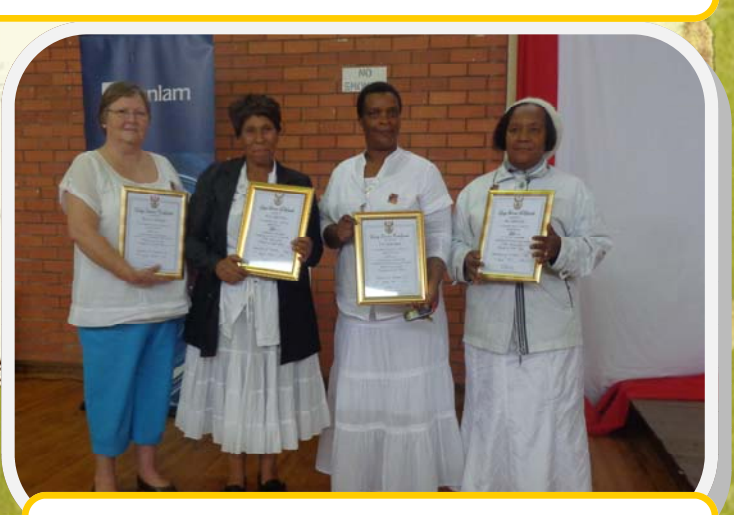
Long Service awards certificate