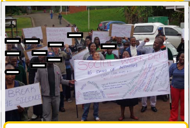
MCHU and Staff staging a March