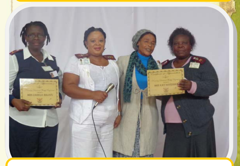
Ward 8 Operational Manager got a certificate