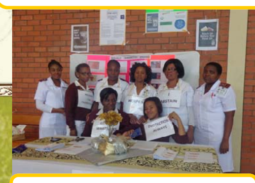
A stall from Ward 1