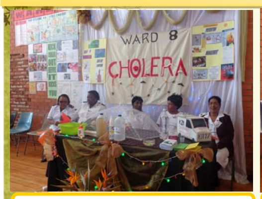
A stall from Ward 8