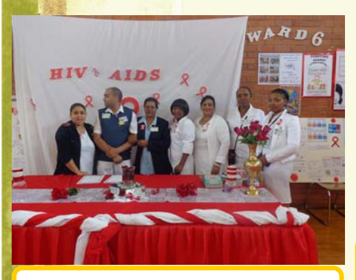
A staff from Ward 6