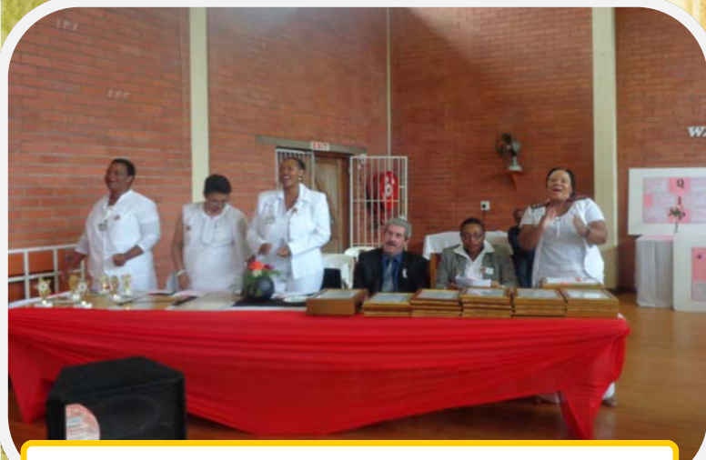
The Hospital Management