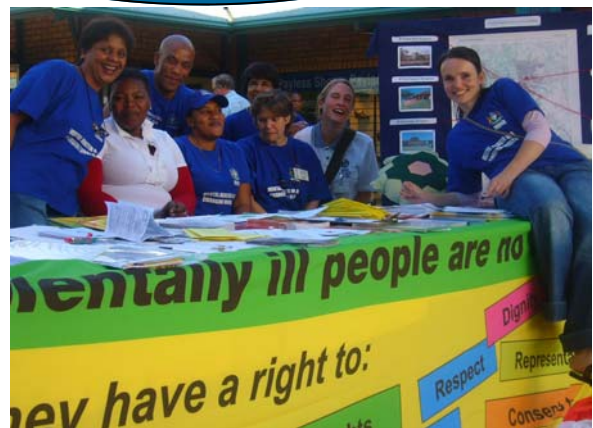
A VERY SUCCESSFUL DAY!! 😊