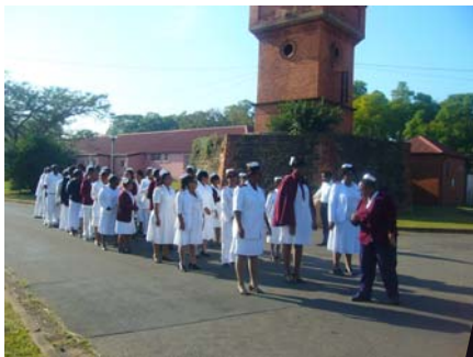
Nurses were led in their parade by drummers and banner carriers