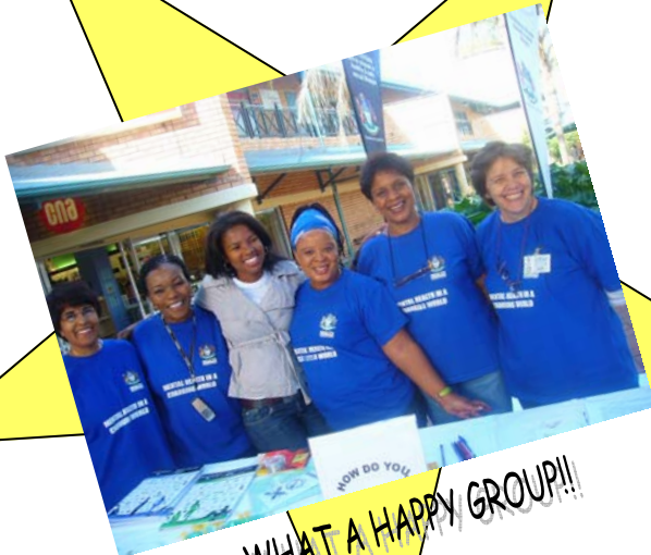
WHAT A HAPPY GROUP!!