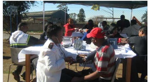
Above pictures: HCT conducted at Ramsay Engineering