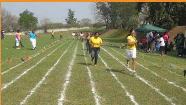
The race in action