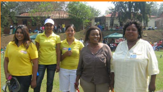
Winners of the 100 meter race.