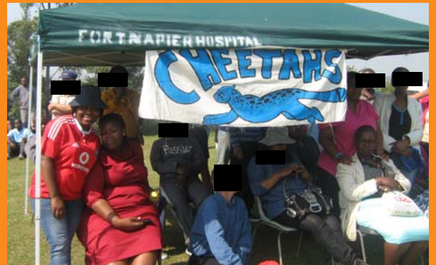
Cheetahs the overall winners of the event