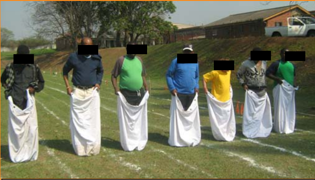
The start of the sack race