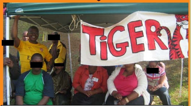
Patients and staff enjoying the sports day