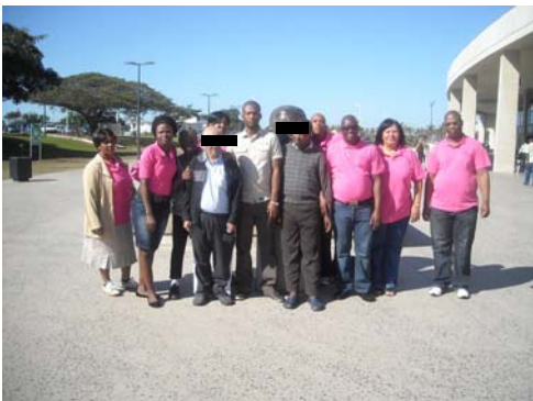
MHCU together with staff at Metro Radio.

braai which was prepared by staff for MHC users which was also an excellent team building exercise. It is very obvious that staff are committed to providing the best patient care for all MHC users as they were very successful in organizing the trip and funded most of the activities for the day.