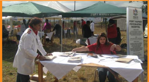
HCT registration table.