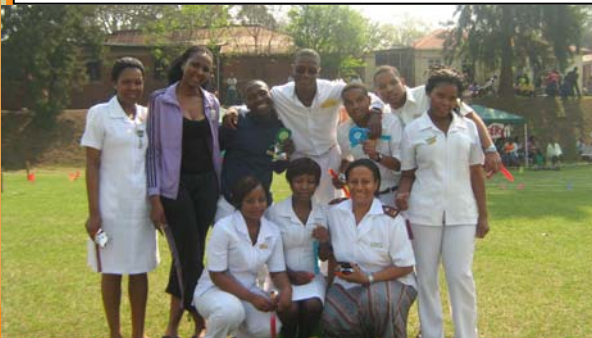
DUT students also took part in one the races