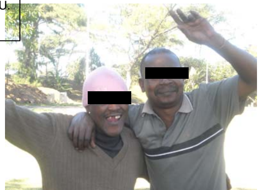
MHCU were very excited, as you can see