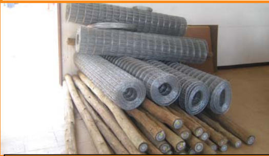
Fencing was provided by BUILD IT.

port of all UN member states and co-sponsorship of over 165 members, from all regions of the world. This represents the overwhelming support of the entire international community in honouring Mr Mandela. We hope this signals the beginning of greater involvement by the global community in this movement for good.