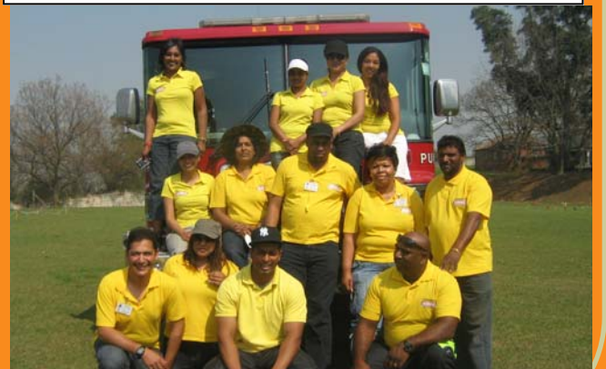
The organizing team