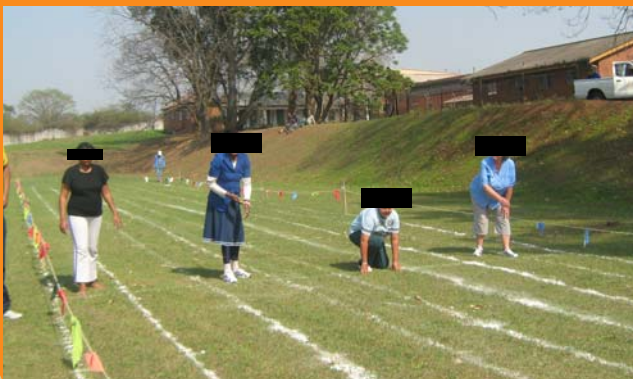
The start of the 100 meter race for patients.