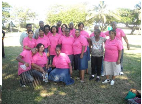
Ward 5 staff, the organizing team