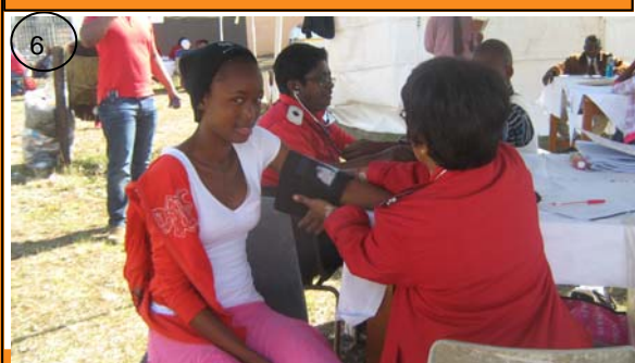
Clients came in their remarkable numbers