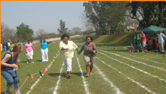
Senior staff members participated on the 100 meter race