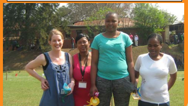
The winners of the 100 meter race