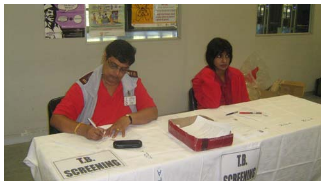
HCT TEAM AT SHURLOCK COMPANY