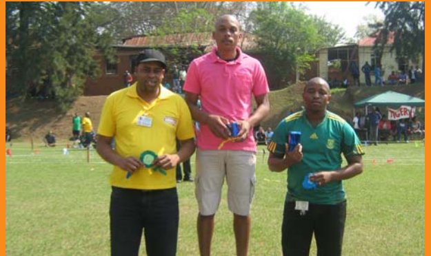
Winners of the 100 meters men's race