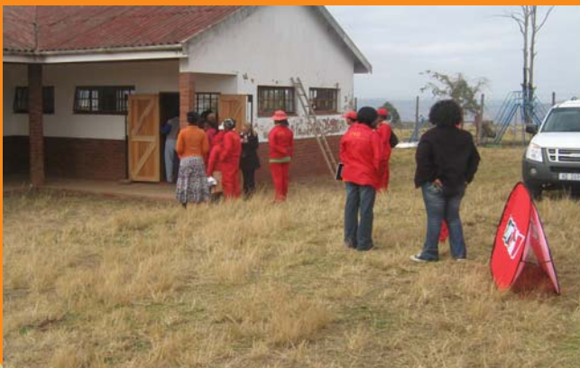
Private public partnership for the good cause to uplift the community