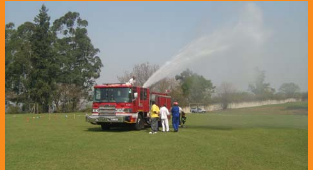
Fire Department was also part of the event