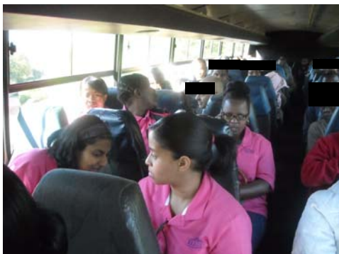
Staff members with MHCU users in a bus