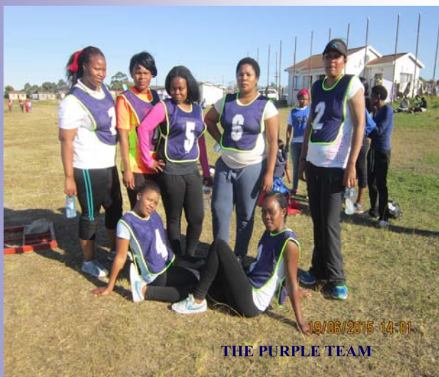
THE PURPLE TEAM