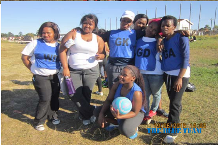
19/06/2015 14:03 THE BLUE TEAM