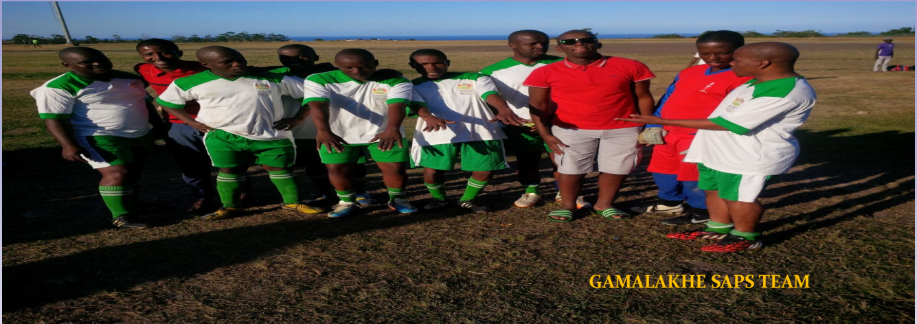
GAMALAKHE SAPS TEAM

This was a very exciting day for every one who took part in the sports as well as the Gamalakhe CHC staff members who attended the event. Among the people who visited us were the Gamalakhe SAPS which were also our opponents in some of the games played ( Soccer and Tug-of-war). These were very interesting games as the Gamalakhe CHC Soccer Team was beaten with a penalty shoot by the SAPS. On the other side of the field in the Tug-of-war the Gamalakhe CHC guys gave the SAPS a thorough beat down two times in a row, now that is what we call Tough Competition.