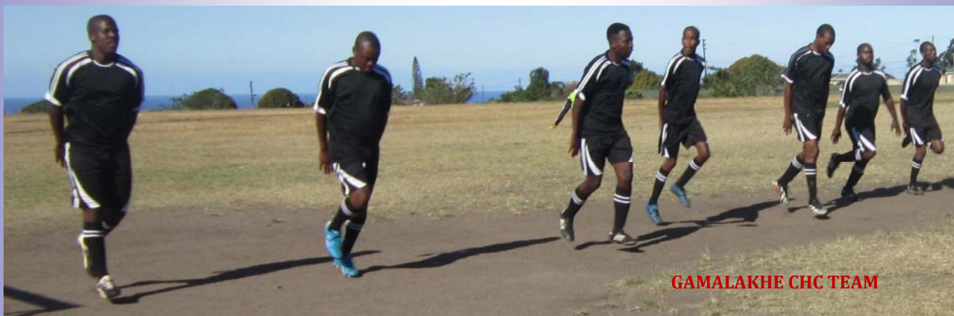
GAMALAKHE CHC TEAM