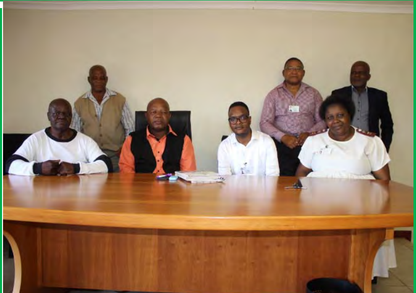
Mavundla traditional leadership paused with Gamalakhe management and Clinic Committee.