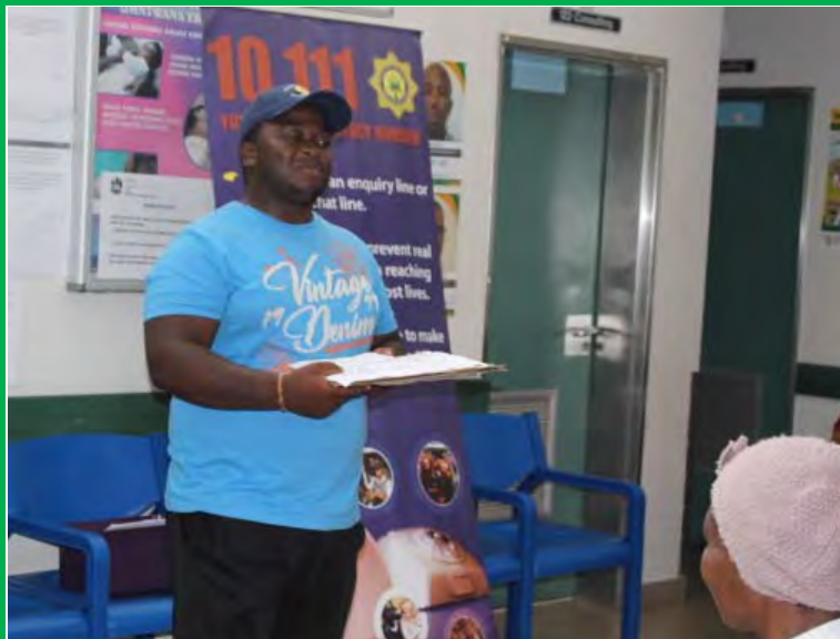
16 days of activism on the 25th November 2019