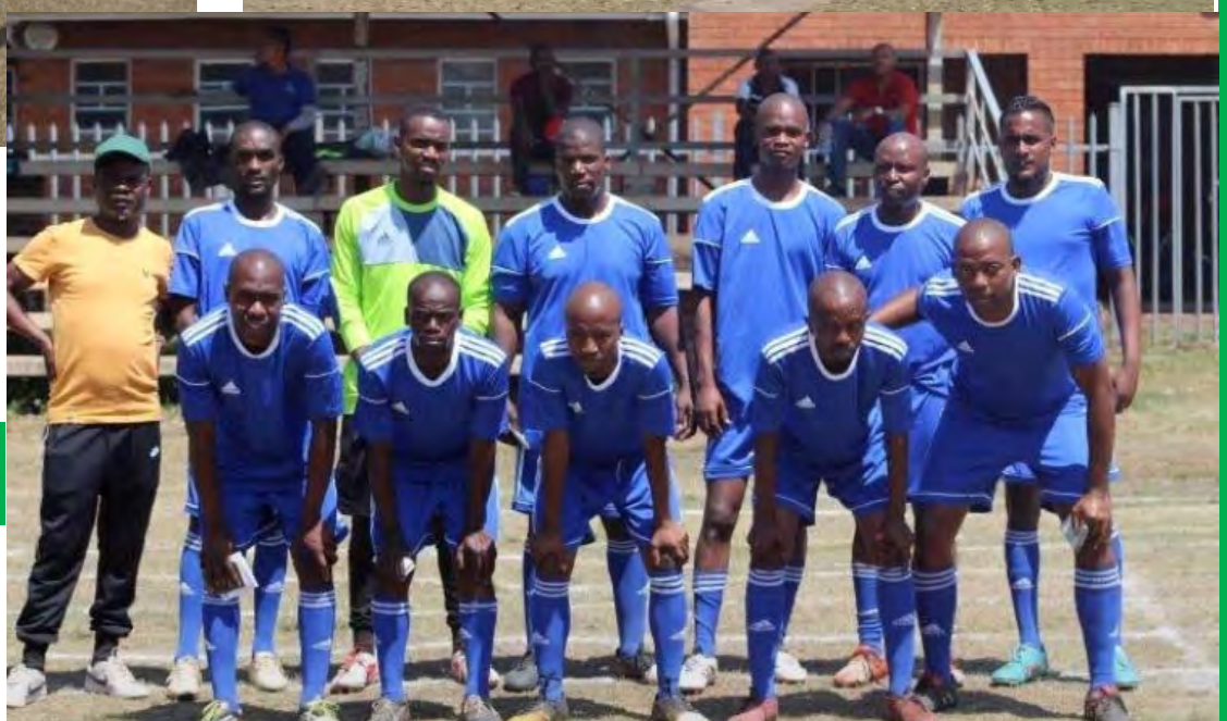
GAMALAKHE CHC SOCCER TEAM