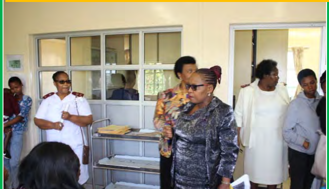
Chairperson of the Health Portfolio engaging with the clients at Ntabeni Clinic.