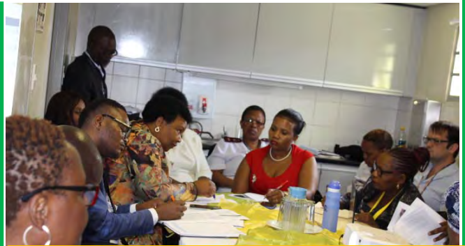
Discussions at Port Edward Clinic

This approach arms the legislature's Portfolio and Standing Committees with information to be utilized in their engagements with the Executive. Ntabeni Clinic and Port Edward Clinic were visited respectively on the 18 November 2019.