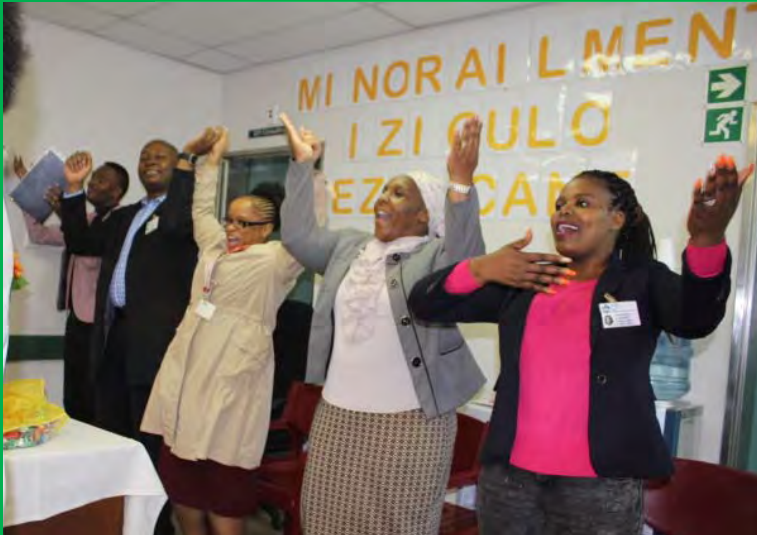
End year prayer on the 18th December 2019