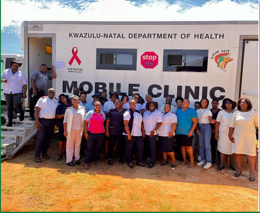
Team from Gamalakhe Community Health Centre visited residents of Okhalweni.