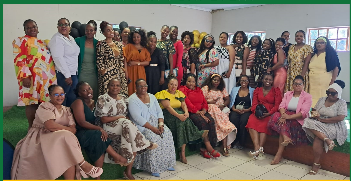
Female staff members from Gamalakhe Sub-district

Camalakhe CHC commemorated women's health month on the 26th May 2024 by hosting heels and clutch event which was held in ZG Community Hall.