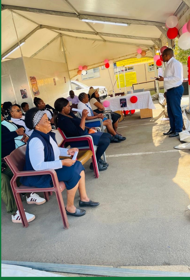
Commemorating June 16 at Ntabeni Clinic