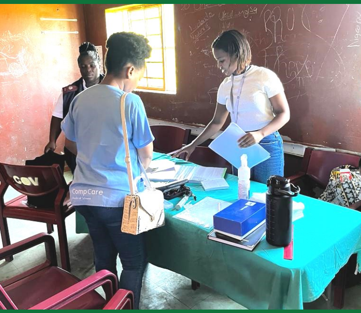
Team from Rehab Department and Eye Clinic