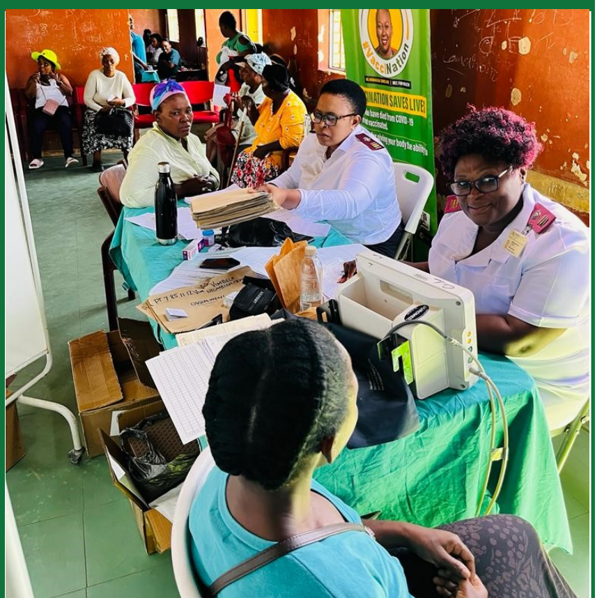
Residents were screened for various types of diseases

amalakhe Community Health Centre supported the Health MEC initiative by visiting communities that are far from the facilities. While KZN has clinics and hospitals, one of the issues addressed by Isibhedlela kubantu is the pressing challenge of access.