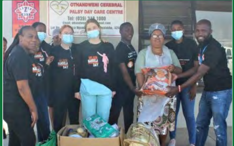
GAMALAKHE CHC & OLD MUTUAL STAFF DURING HANDING OVER AT OTHANDWENI DAY CARE CE-

The facility will be targeting non-profit organization that cater to the elderly next year.