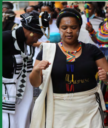
DOCTORS & ALLIED HEALTH PERFORMING XHOSA CULTURE