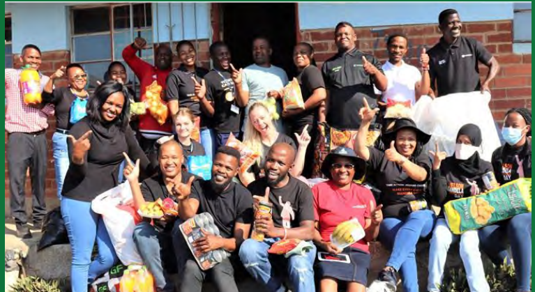
GAMALAKHE CHC & OLD MUTUAL STAFF DURING HANDING OVER AT VUKUZITHATHE