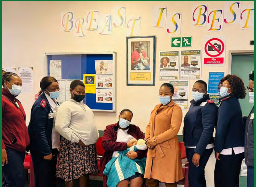
MARTENITY STAFF: PROMOTING BREAST FEEDING

The goals of breast feeding education are to increase mother's knowledge and skills, help the view breastfeeding as normal, and help them develop positive attitudes towards breastfeeding.