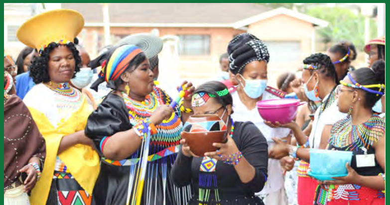
CHILD HEALTH & MATERNITY