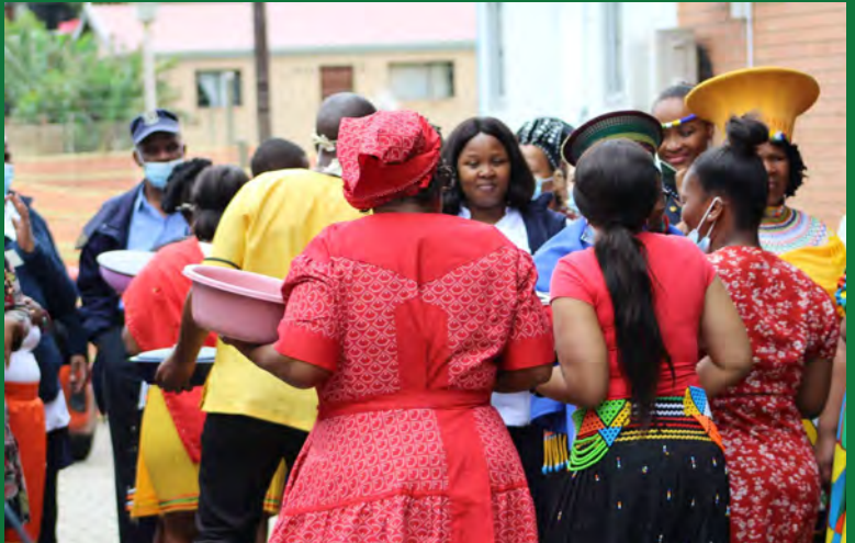
SYSTEMS DEPARTMENT AFTER PRESENTING THEIR TRADITIONAL FOOD