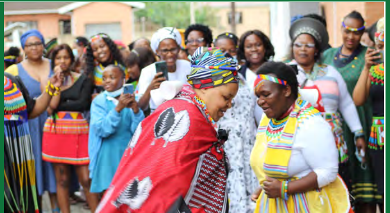
OPD DEPARTMENT PERFORMING VENDA CULTURAL DANCE