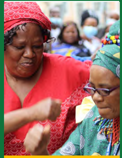
SOME OF THE STAFF MEMBERS ENJOYING THEMSELVES