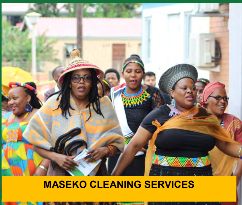
MASEKO CLEANING SERVICES