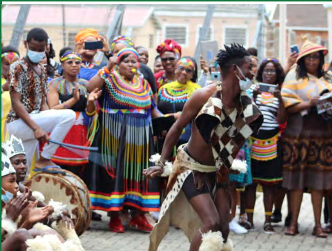
IZIMPUNGA ZEHLATHI ENTERTAIN-