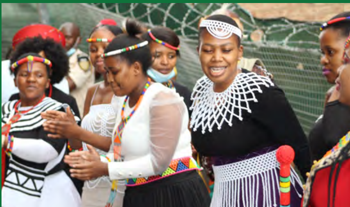
HR DEPARTMENT PERFORMING ZULU CULTURE