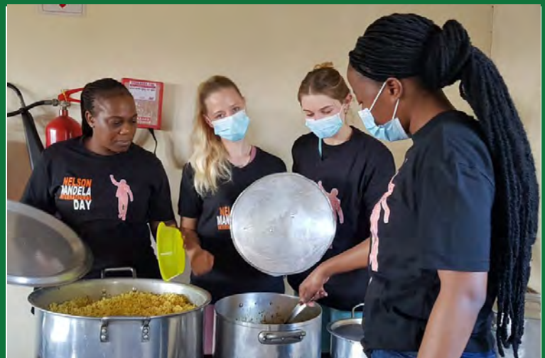
GAMALAKHE CHC STAFF MEMBERS PREPARING LUNCH FOR KIDS AT VUKUZITHATHE