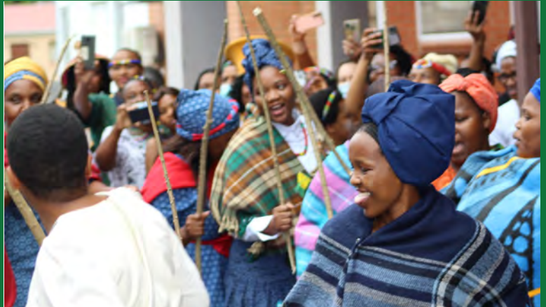
FINANCE DEPARTMENT PERFORMING SOTHO CULTURAL DANCE