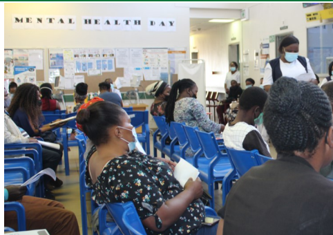
MENTAL HEALTH DAY READ MORE IN PAGE 6