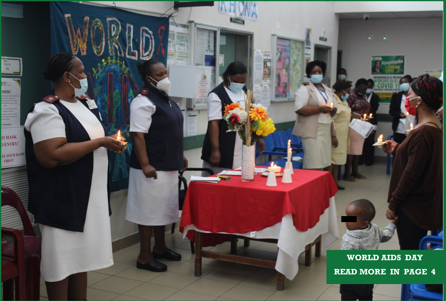
WORLD AIDS DAY READ MORE IN PAGE 4