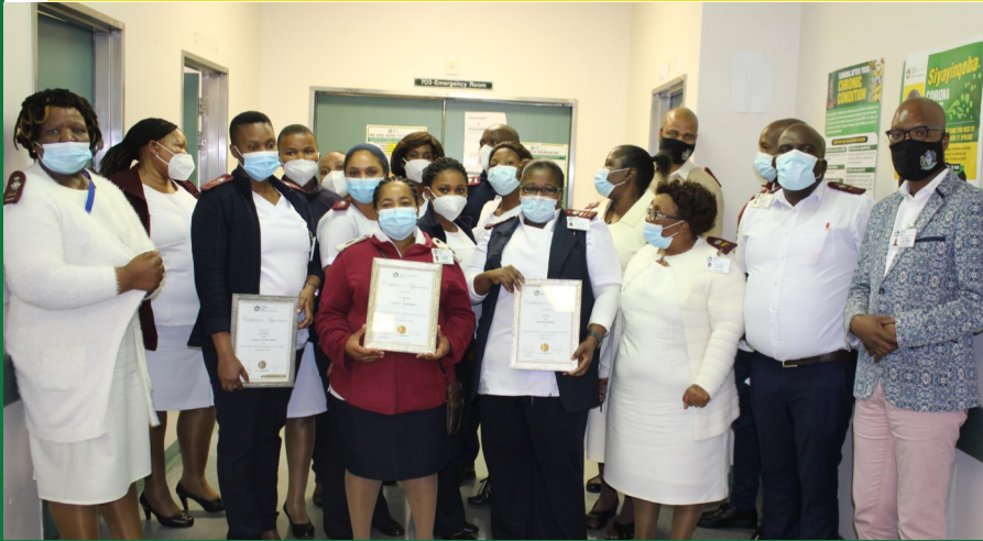
CASUALTY DEPARTMENT STAFF