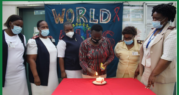
During candle lighting