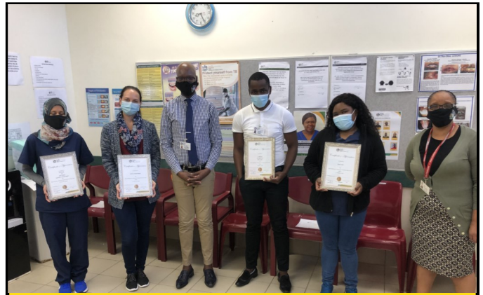
Dental Department and Eye Clinic paused with certificates