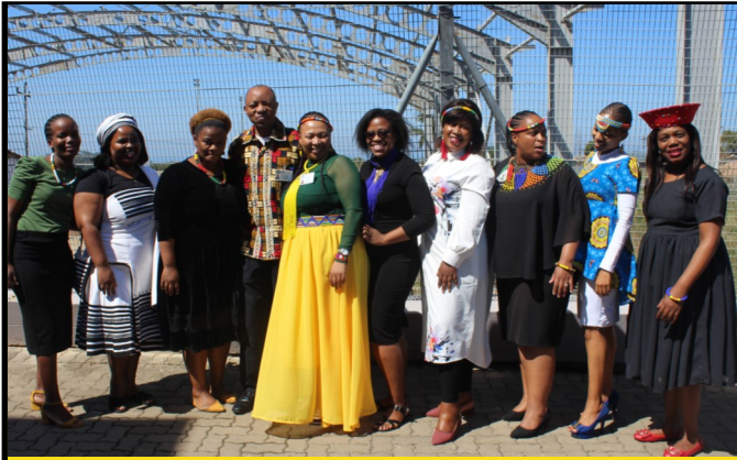
Staff members paused for photo as month of September is Heritage Month