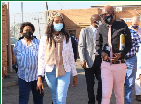
LEGISLATURE VISIT READ MORE IN PAGE 5