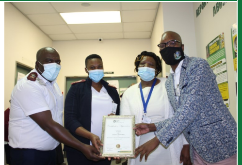
AWARDING OF STAFF READ MORE IN PAGE 7