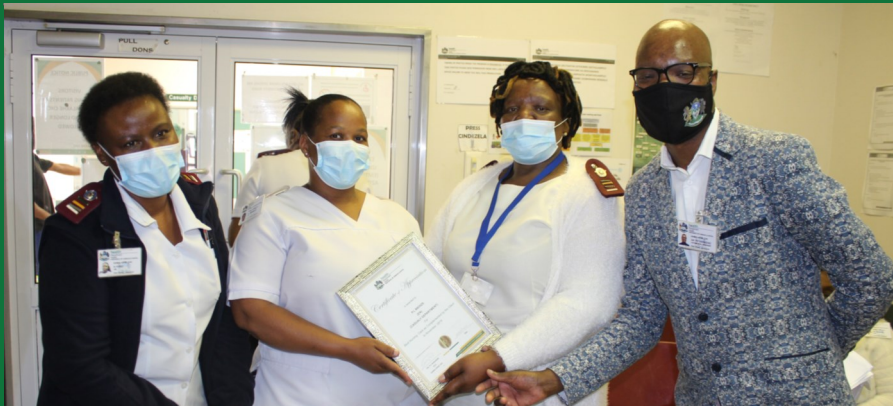
MARTENITY WARD STAFF RECEIVING THE CERTIFICATE FROM THE CEO