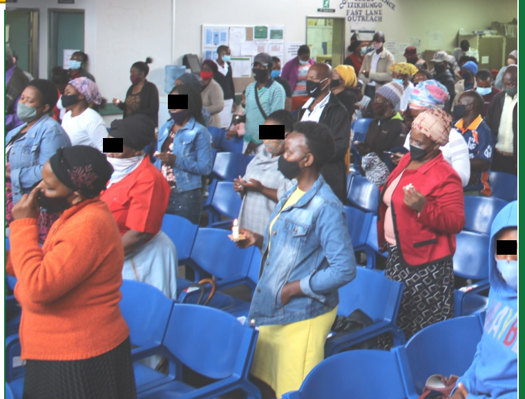
Clients holding candles during prayer

The message in the four candles during World Aids Day symbolizes love, hope, light and faith. ■