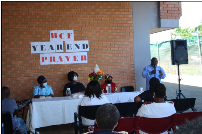
HCF End Year prayer