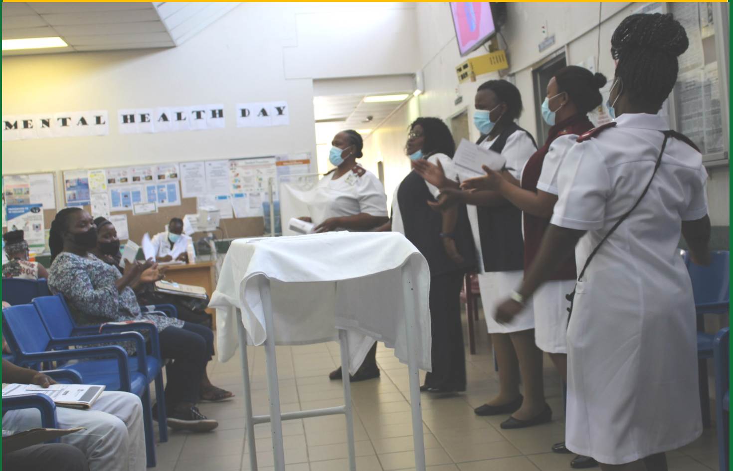
OPD nursing staff during opening remarks

M ental Health Day is commemorated on the 10th October is aimed at creating public awareness to make issues related to mental health a global priority. Mental disorders comprise a broad range of problems with different symptoms. However they are generally characterized by some combination of abnormal thoughts, emotions behavior and relationships with others. This year's theme was 'Mental Health for all' and on the 10th October 2020 Gamalake CHC joined the country in commemorated this day.