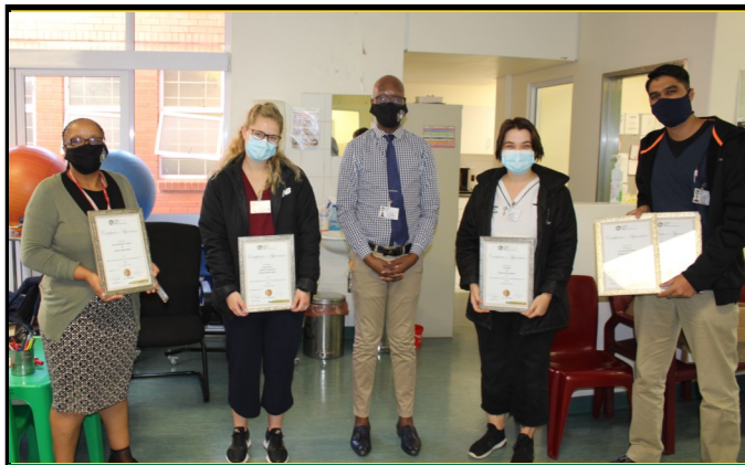
Rehab team paused with certificates from the CEO's office