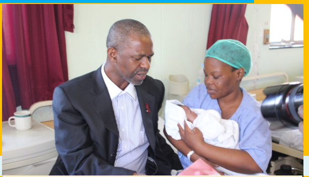
MEC giving the new mother a baby Hamper