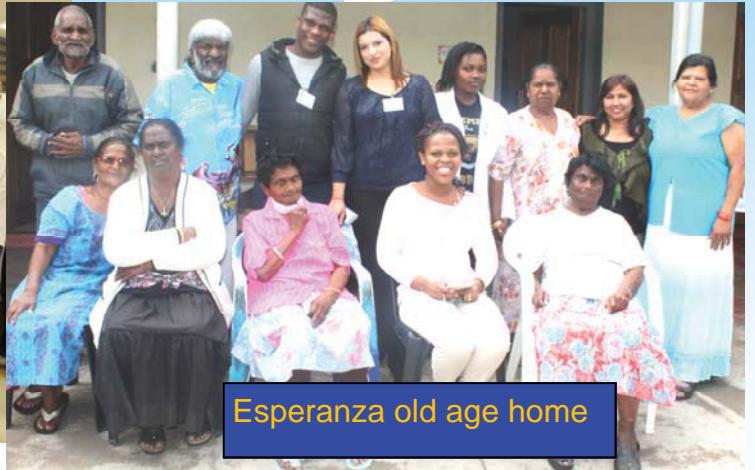
Esperanza old age home