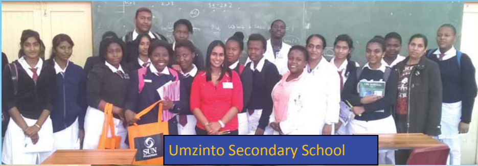
Umzinto Secondary School