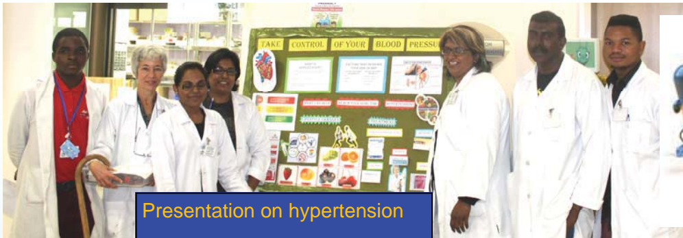
Presentation on hypertension