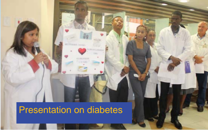
Presentation on diabetes