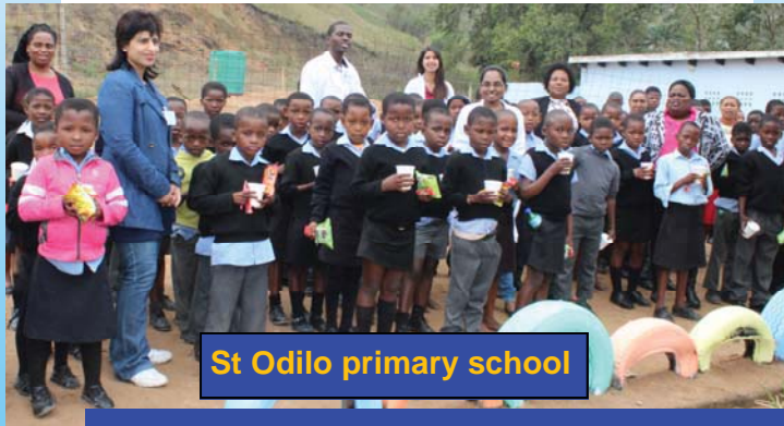
St Odilo primary school