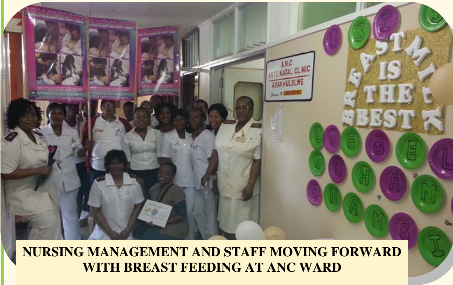
NURSING MANAGEMENT AND STAFF MOVING FORWARD WITH BREAST FEEDING AT ANC WARD

Department: Health PROVINCE OF KWAZULU-NATAL