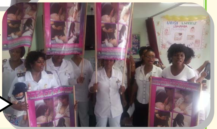
NURSING STAFF SINGING BREAST-FEEDING PROMOTIONAL SONGS