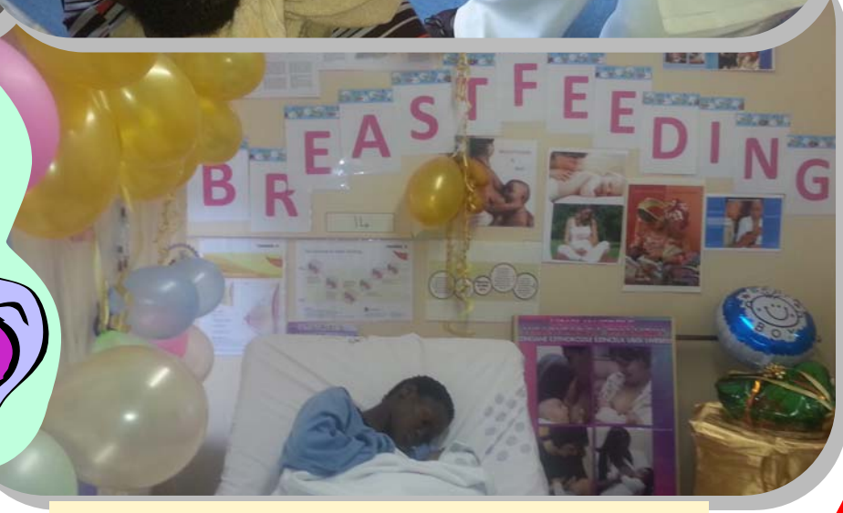
Mother of the first Born for the day, breastfeeding her child in Labor Ward