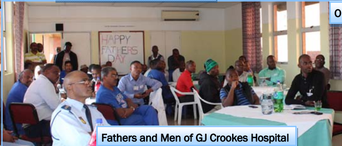
Fathers and Men of GJ Crookes Hospital