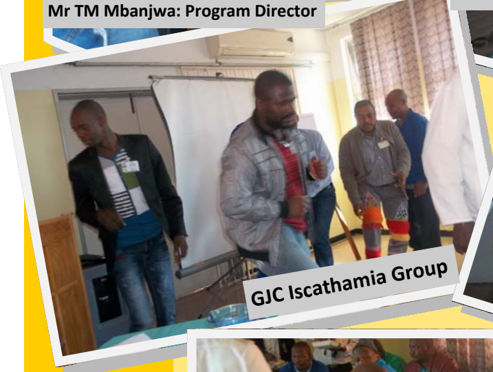
GJC Iscathamia Group