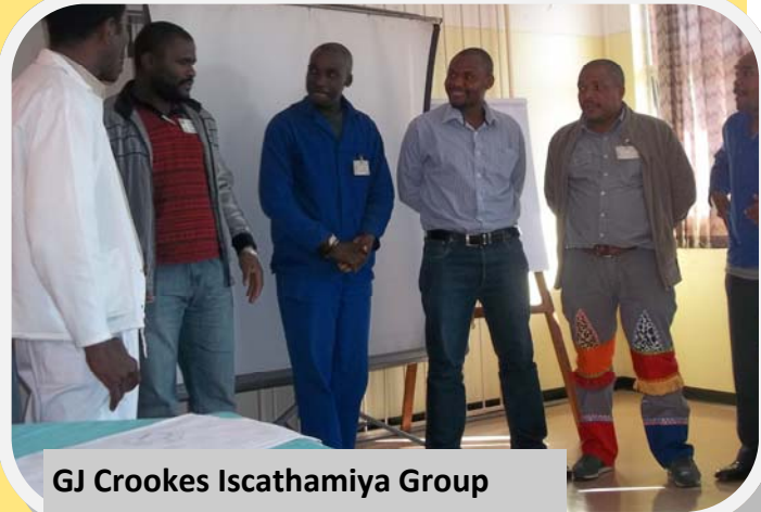
GJ Crookes Iscathamiya Group