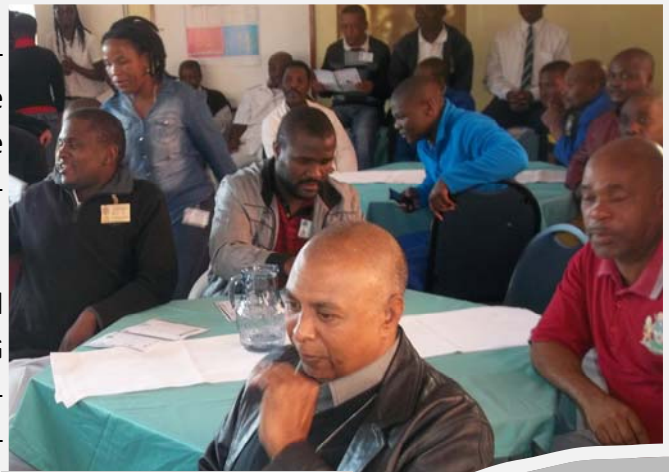
GJ Crookes Hospital Men