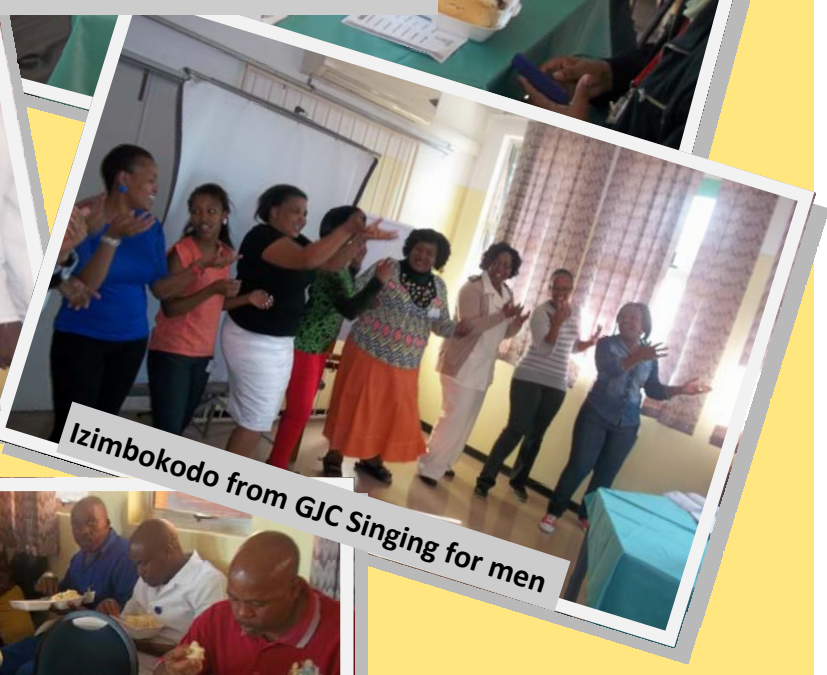
Izimbokodo from GJC Singing for men