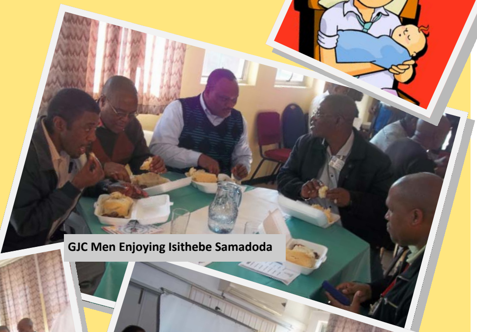
GJC Men Enjoying Isithebe Samadoda