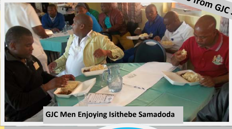
GJC Men Enjoying Isithebe Samadoda