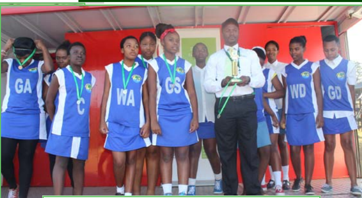
GUGU LESIZWE HIGH SCHOOL 2ND POSITION