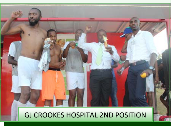
GJ CROOKES HOSPITAL 2ND POSITION