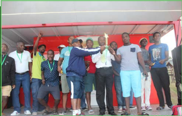
GAMALAKHE CHC 2ND POSITION