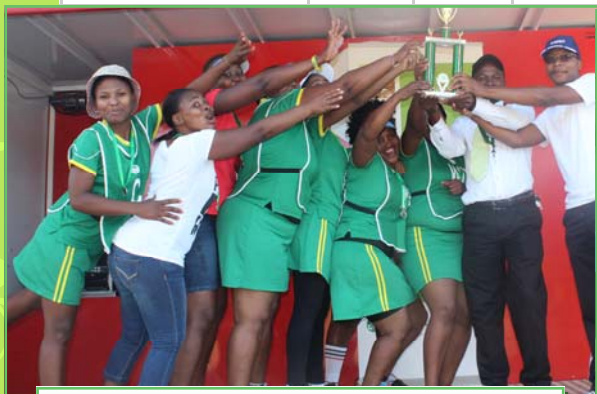
GJ CROOKESHOSPITAL NETBALL CHAMPIONS