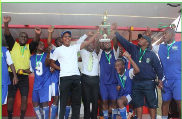
TURTON CHC. WELLNESS CHAMPIONS 2015