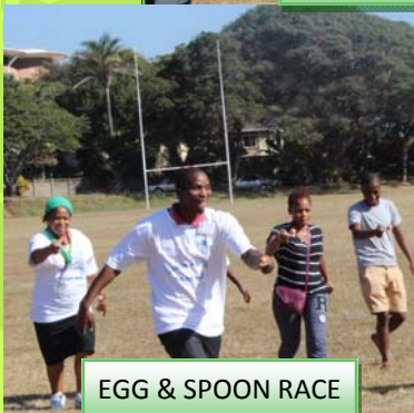
EGG & SPOON RACE