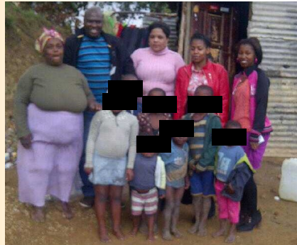
Team 4: Some of the staff members with a granny of 8, with her 7 grandchildren