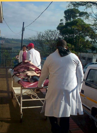
Team 6: Nehawu trade union representatives assisting pushing a sickly patient from the taxi rank to the hospital.

They gave bibs and boots to new born children at the nursery in the maternity ward.