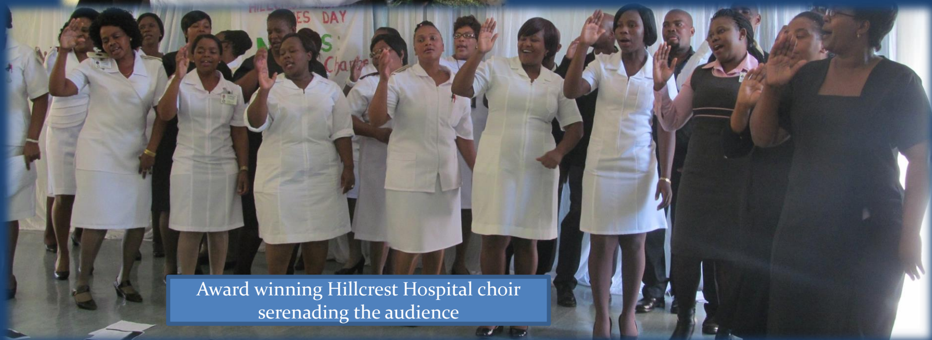
Award winning Hillcrest Hospital choir serenading the audience