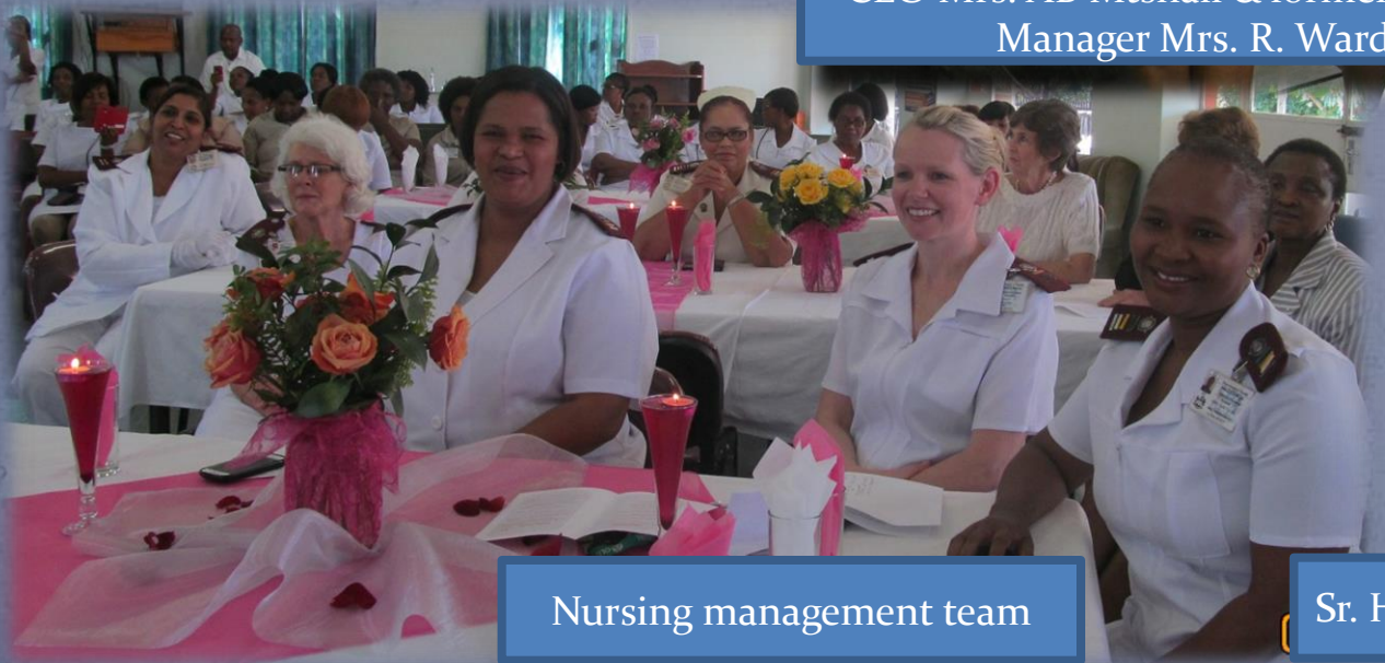
Nursing management team