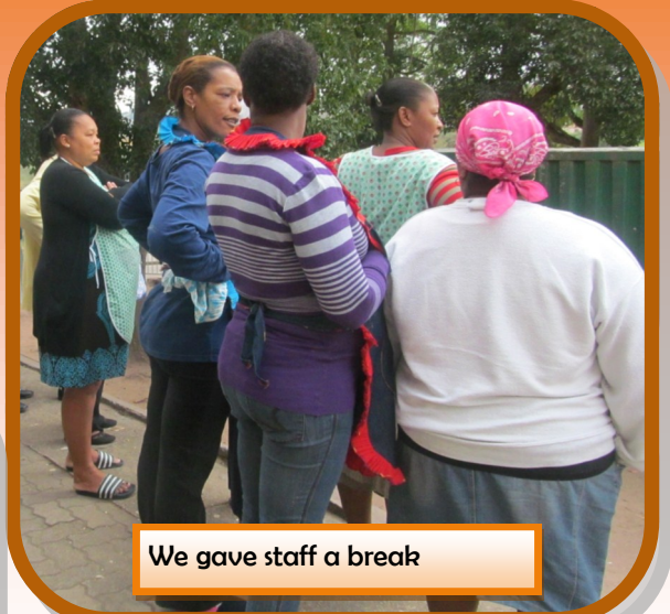
We gave staff a break