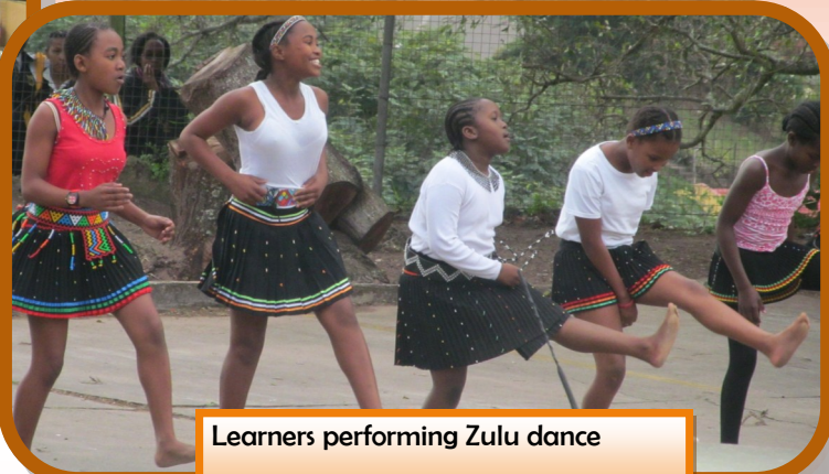
Learners performing Zulu dance