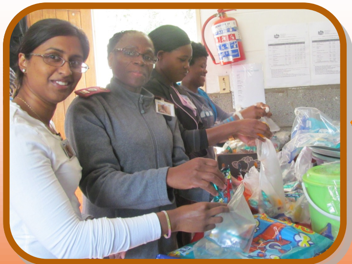
Hillcrest Hospital staff preparing lunch and snacks for the learners