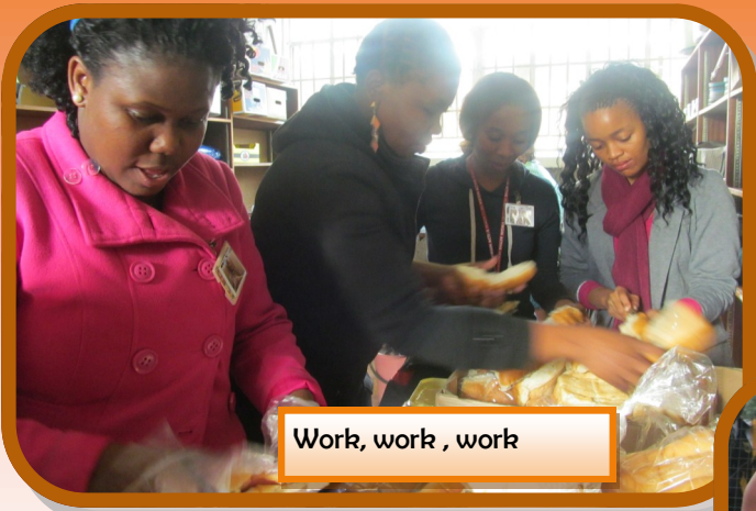
Work, work , work