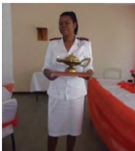
Nurses day..... READ MORE ON PAGE 2

My wish and plea is for Hillcrest hospital and our partners to work together even when differences prevail to ensure the delivery of quality, reliable, ethical, effective and efficient healthcare for our clients. The ultimate goal is for the institution to be the best of its kind and united we can make it.