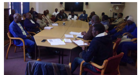
Men's forum 5 READ MORE ON PAGE