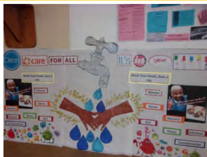
IPC READ MORE ON PAGE 3