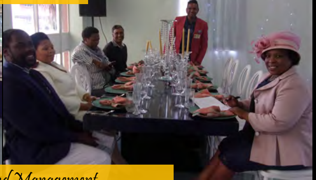
Guests and Management