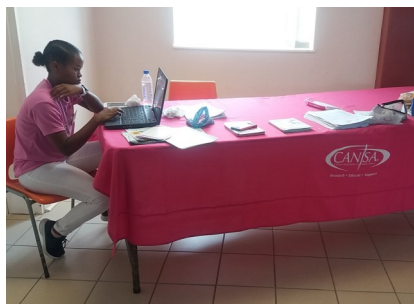
Cansa Screening table, a number of self screening assessment questionnaires were issued to staff