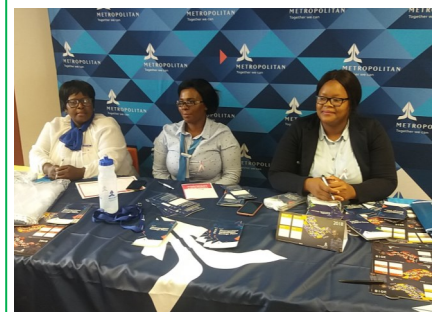
Metropolitan Consultation table maned by Professional Financial Advisor