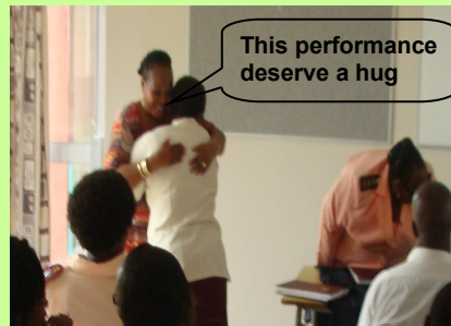
This performance deserve a hug