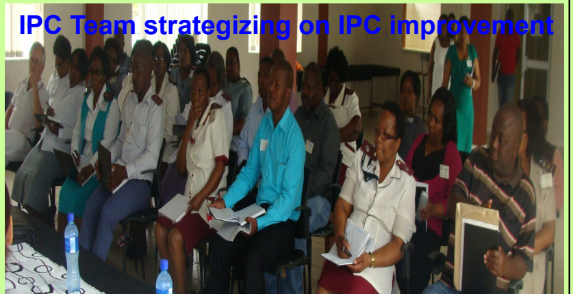
IPC Team strategizing on IPC improvement

A team spirit was noted to all team leaders within the facility who stood up for they sections to ensure that safety of the staff as well as clients against cross infections is not compromised, as a result all sections had action plans that were talking to their gaps identified during the audit; and those action plans were well implemented within the 30 days time frame set.