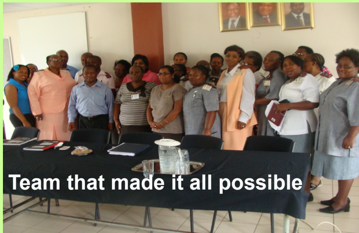
Team that made it all possible

After the gaps that were noted as threats to the existing IPC measures it was required for the Hlabisa Hospital to come up with the an action plan to resuscitate those IPC measures. the quality improvement plan was done and submitted to the auditors with a time frame of 30 days to improve set by the facility on its own. And now the province came back to check either the facility was complying with the activities and commitments that we set for ourselves.