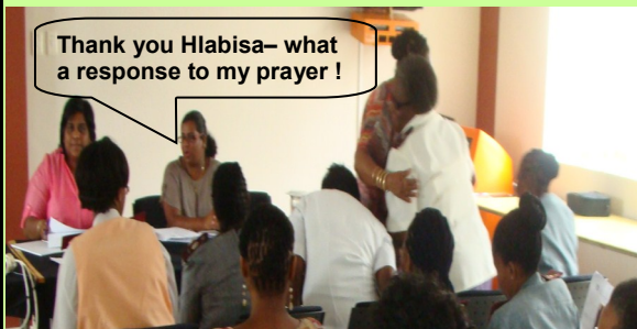
Thank you Hlabisa- what a response to my prayer!