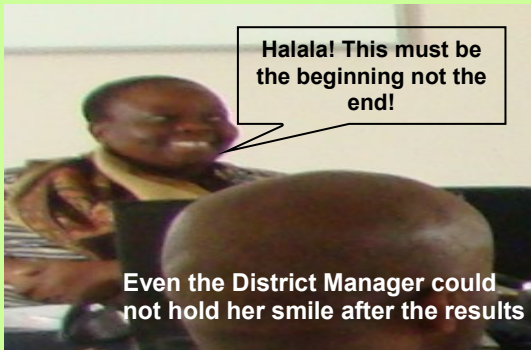
Even the District Manager could not hold her smile after the results