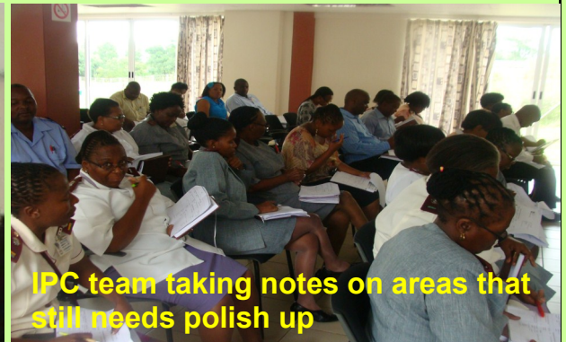
IPC team taking notes on areas that still needs polish up