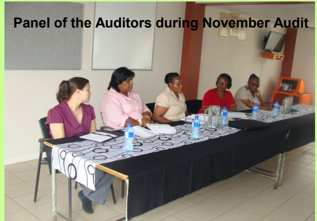
Panel of the Auditors during November Audit

A mongst the 6 Priorities of the National Core Standards in transforming and revitalising the provision of Health Services is the Infection prevention Control (IPC). Hlabisa Hospital had shown a huge improvement in this priority area of the National Core Standards. This was declared by the Provincial IPC Auditors after an IPC audit held at Hlabisa Hospital on the 4 th of February 2013. This was a very important and exciting exercise where by facility was to be audited either it has improved in all gaps that were identified during the initial audit conducted previously by provincial IPC Audit team on the 06 th of November 2012.