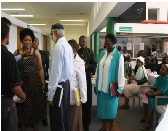
MEC with clients and Hospital Management