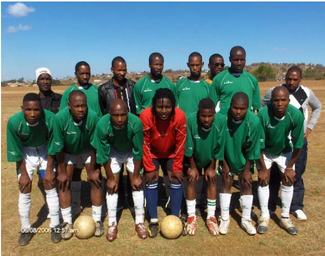
Yilo leli iqembu lesibhedlela lebhola lezinyawo eliqeda abantu.