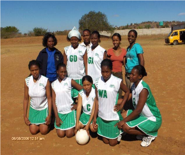
Iqembu lesibhedlela lebhola lomnqakiswa basazophela abantu isibhaxu.