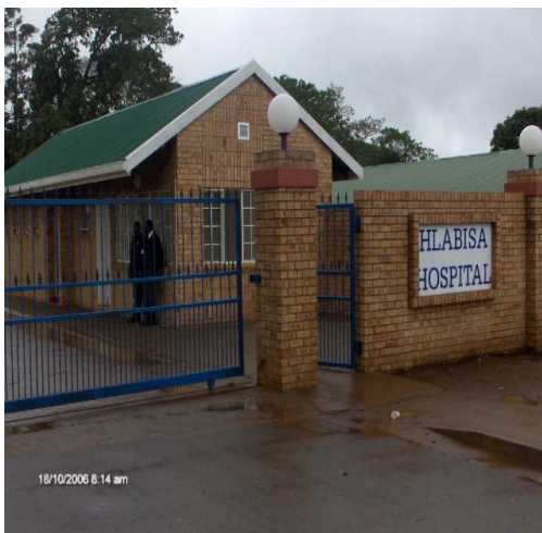
The hospital Main gate that has recently handed over.