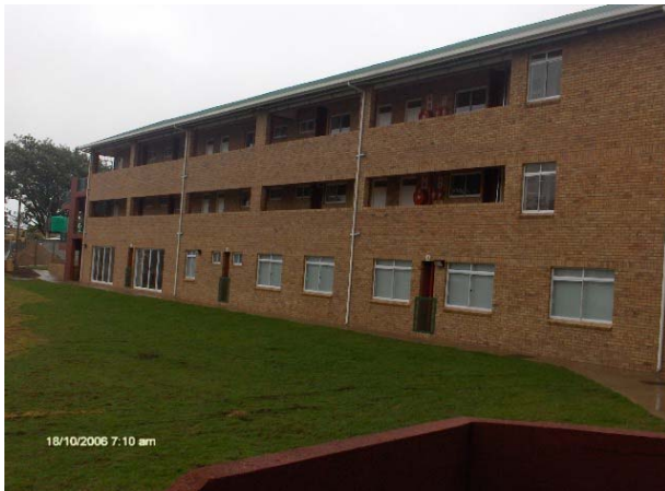
The new nurses home for trainees and professional staff