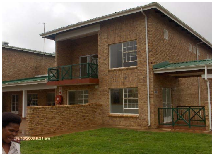
Recreation facility with a basket ball court, volleyball and squash court

The first phase of the Presidents project is over, it includes the recreation facilities that are tennis court, indoor basket-ball court and squash court. There are new doctor's houses fully furnished to try and resolve the challenge of medical staff shortage in our hospital, there is also a new nurses home with about 150 rooms to stay for our training staff and professional staff