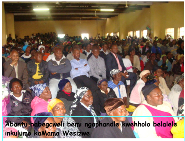
Abantu babegcwelelwa bemi ngaphandle kwehholo belalele inkulumbo kaMama Wesizwe

Waqhubeka enkulumeni yakhe lapho anxusa omama nentsha ngokuziphatha wakhuzwa nomkhuba wokuhlelwa kwezingane ezincane (teenage pregnancy). Wanxusa kakhulu abazali ukuba baxoxiswane nezingane ngezindaba zocansi lokho okulekelela kakhulu ukuthi