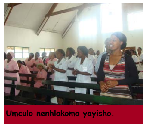
Umculo nenhlokomo yayisho.