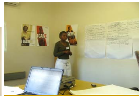
PRO facilitating the workshop