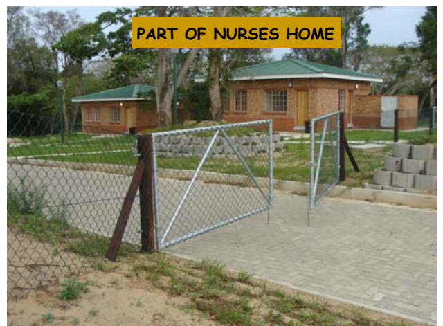
PART OF NURSES HOME

Lena ingxenyane yezindlu zokuhlala abahlengikazi ekhona futhi egcekeni lomtholampilo.