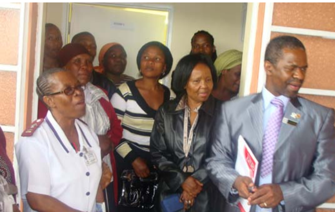
Community at Somkhele could not believe it when seeing the MEC at Somkhele.

The structure of Machibini Clinic was donated by RBM in November 1994 functioning in March 1995. It was a small 3 roomed house. One room was used as a medicine room, the other one as a general storeroom and the last one as a both the consulting and waiting room. Although it was a small but it managed to get health services off the ground. Almost all the essential services were provided including emergency deliveries