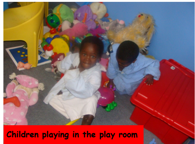
Children playing in the play room

all dressings and procedures are done. Phela omambana baze bakhohlwe ngisho ukuthi kodwa kuyadliwa uma sebedlala, ukube kuya ngabo ngabe balala khona lapha endlini yabo yokudlala ngoba phela kunezinto zokulala lapho belalisa khona onodoli babo ngesikhathi bedlala. Ukudlala lokhu kubalekelela kakhulu emiqondweni nasekwazini ukulungisa emakhaya. Bayaye bafundiswe futhi nangokuqoqa endlini lapho baye bethi uma sebehliphize kwagcwala indlu, bese befundiswa ukuqoqa ngononina, okwasekhishini, endaweni yokulala, endaweni yokuphumula etc.