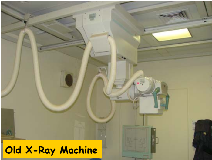
Old X-Ray Machine

Film okuyaye kuthi uma engekho noma amanzi engekho kube khona ukuphazamiseka ngokusebenza. Bekuyaye kuthi nxa amafilimu engekho kume nse ukusebenza e—X-Ray ngalesosikhathi asuke esayocelwa nakwezinye izibhedlela ezingomakhelwane.