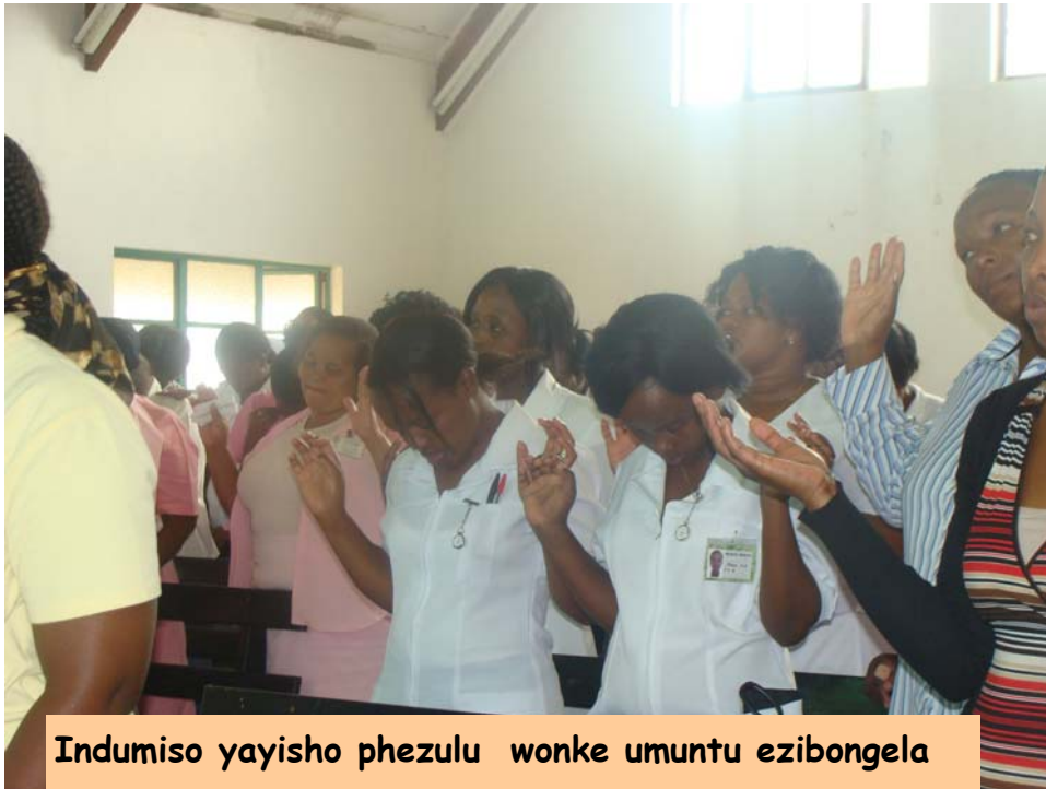
Indumiso yayisho phezulu wonke umuntu ezibongela