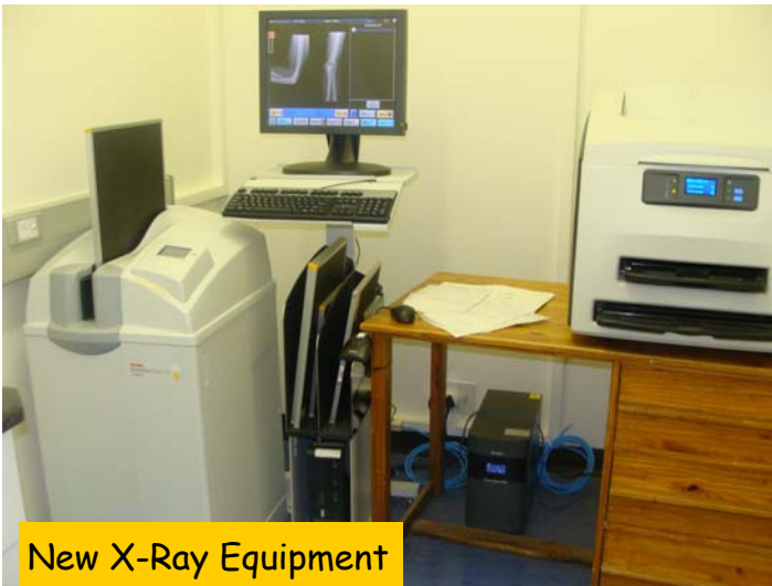
New X-Ray Equipment

Film okuyaye kuthi uma engekho noma amanzi engekho kube khona ukuphazamiseka ngokusebenza. Bekuyaye kuthi nxa amafilimu engekho kume nse ukusebenza e—X-Ray ngalesosikhathi asuke esayocelwa nakwezinye izibhedlela ezingomakhelwane.