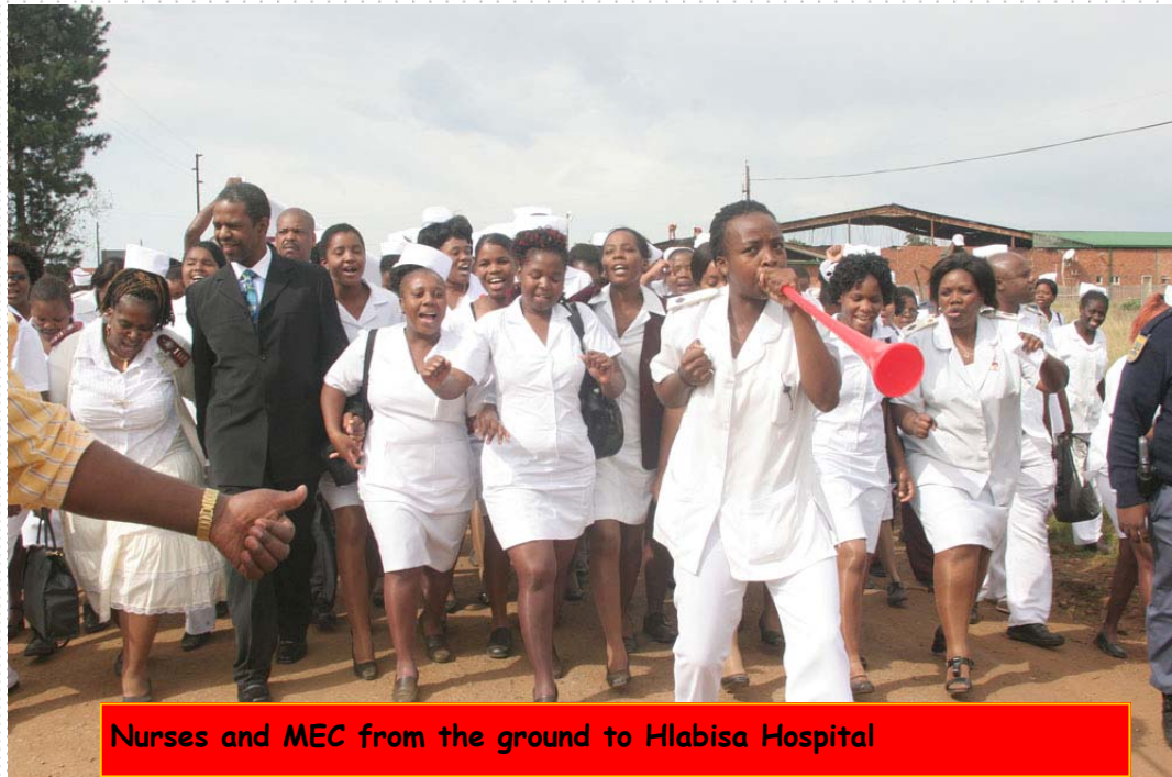
Nurses and MEC from the ground to Hlabisa Hospital

On the 16th of May 2009, we were blessed by the MEC's visit here at Hlabisa Hospital. It was the International Council of Nurses Nurses Day which was celebrated in Hlabisa Hospital with the