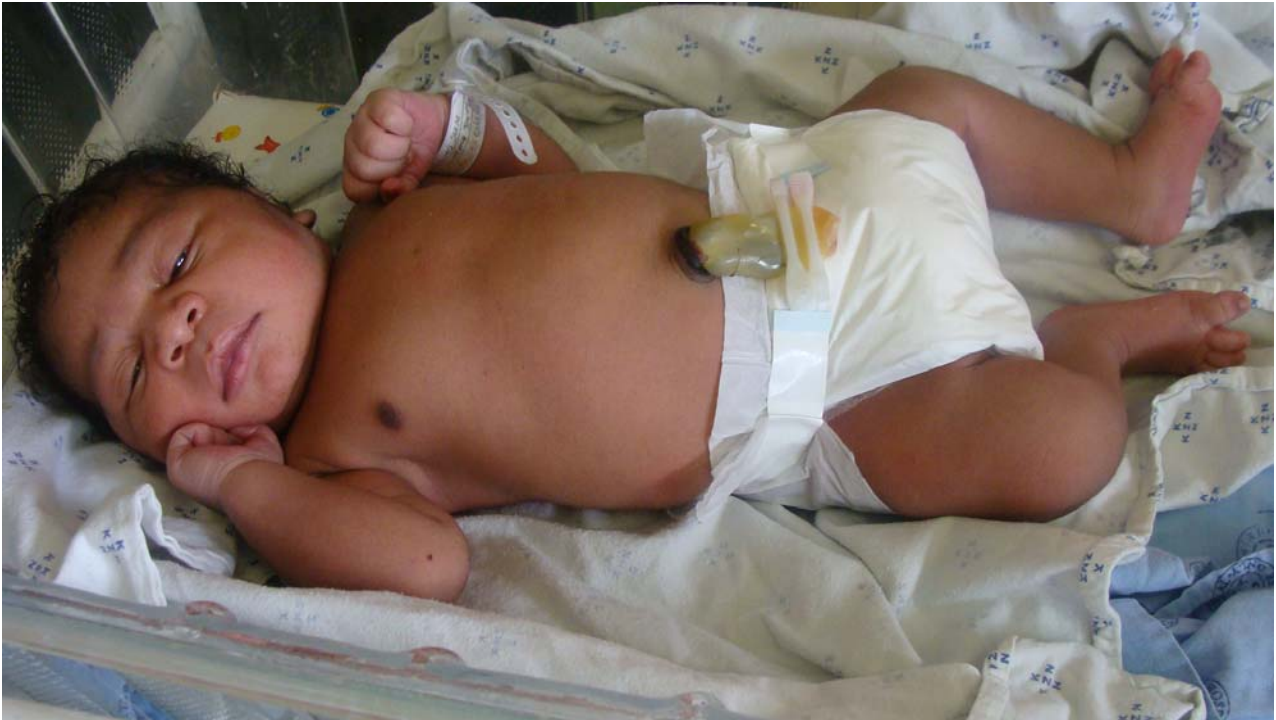
Big Baby-boy Xoliswa Nqazini oshaye u 4.3 KG ngomhlaka 03 ku August 2009 kwa Hlabisa ngaphandle kwenkinga futhi nomama wakhe u-Nowazi Gazu (33) wase—Macekeni khona kwaHlabisa akatishwanga.

Uma isibhedlela sakwa-Hlabisa sithi "ukuba sakhe isimo esiyokwenza ukuba sikwazi ukubambisana nokuhlanganyela ekwakheni izimo ezincono kuwona wonke amazanga Abantu ngokohlelo oluphucuzekile lwezempilo" sisike singasho nje ngoba sisho kepha sigcwalisa umgomo wethu. Lokho phela kufakazelwa yimiphumela emihle ekhiqizwa yile-sisibhedlela. Ukukhipha izingane ezinkulu ngaphandle nje kwenkinga sekungumkhuba walesisibhedlela lokhu okwenza futhi umphakathi usethembe lesisibhedlela hhayi ngoba kuyisona sodwa isibhedlela kwa-Hlabisa.