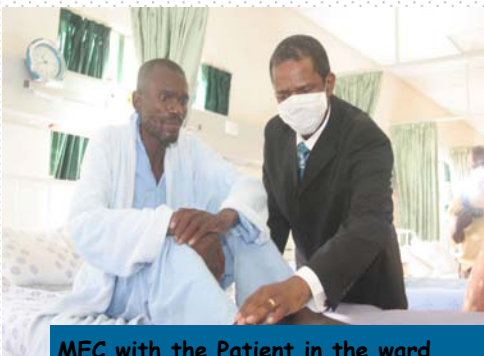
MEC with the Patient in the ward

and even mentioned that Nurses are working hard. He also said that he is a doctor but during