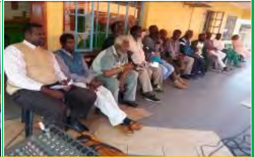
Leadership of Ntondweni Community attending Ntondweni Clinic Open Day