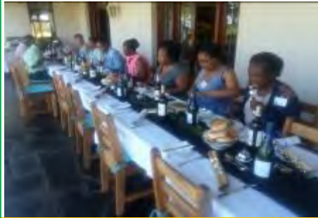
Mondi Mobile Health Team having lunch after their last 2018 Quarterlyly meeting.