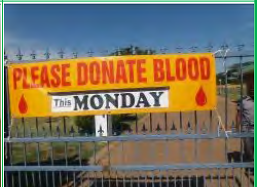
Hlabisa embarked on Blood Donation drive to save lives of those need Blood