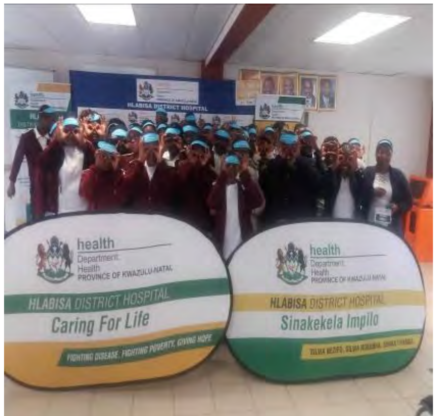
Nursing Students Demonstrating Eye Protection during the Eye Care Awareness