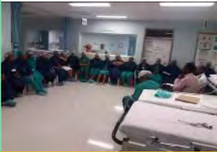
CEO Attending Theatre Sectional meeting to get their concerns on service delivery.

W hen walking around the Hlabisa/ Mtubatuba Sub-District between 01 July and 31 December 2018, This is what I found my camera focused into:- Be careful Next time singakubambi offside!