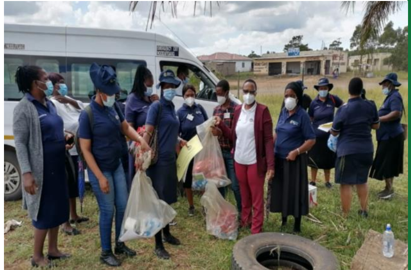
Clinicians and CHWs preparing to move house to house, educating families about TB.

Hlabisa Hospital and Mpembeni clinic partook in TB awareness on World TB day. Hlabisa was raising awareness in a form of door to door, in surrounding areas, educating households about TB, screening and testing those that showed symptoms. Mpembeni Clinic hosted a TB awareness event at a local community hall to give a talk about TB symptoms and treatment and also screen the audience.