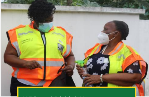
MEC and District Manager having a little chat