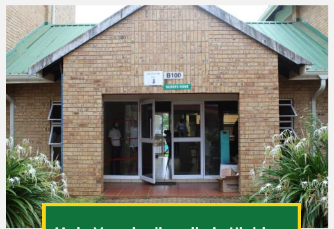
Main Vaccination site in Hlabisa Hospital