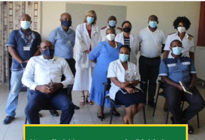
Hospital Management , District management, AHRI and SAMRC