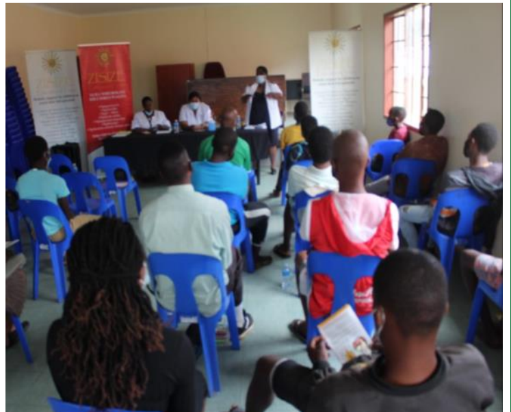
Audience at the TB awareness held at Mpembeni local community.