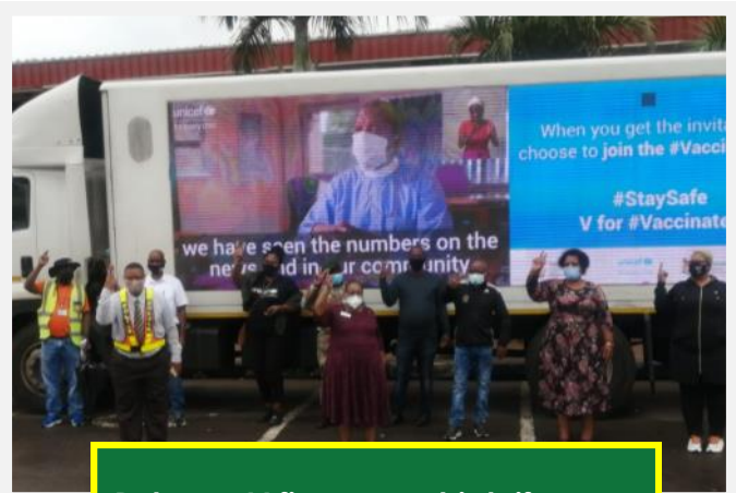
Put your V fingers up high if you choose vaccine!