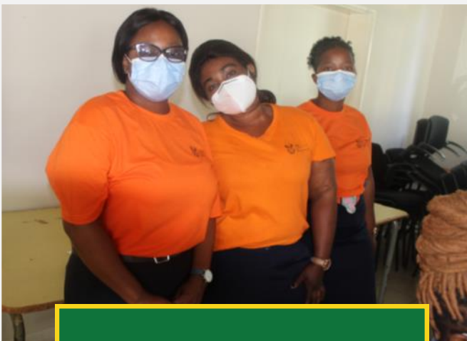
Our beautiful ushers on Prayer day