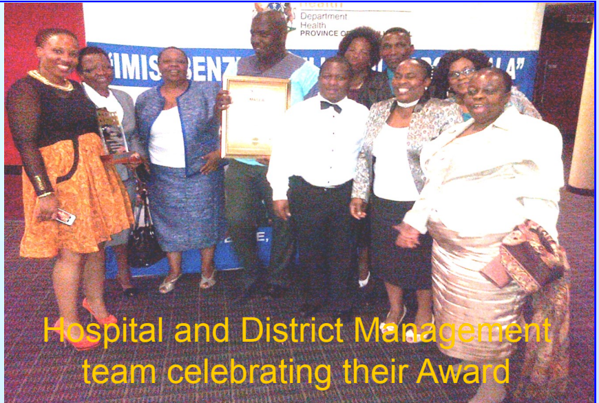
Hospital and District Management team celebrating their Award