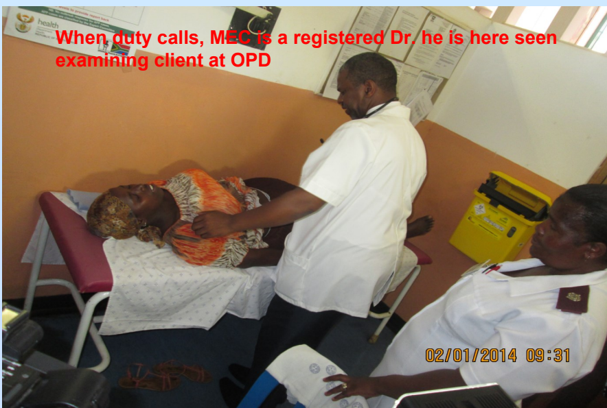
When duty calls, MEC is a registered Dr. he is here seen examining client at OPD

During lunch he took a hospital tour to note some improvement and challenges. After lunch he met with the Hospital Management to share ideas; targets and challenges for the year.