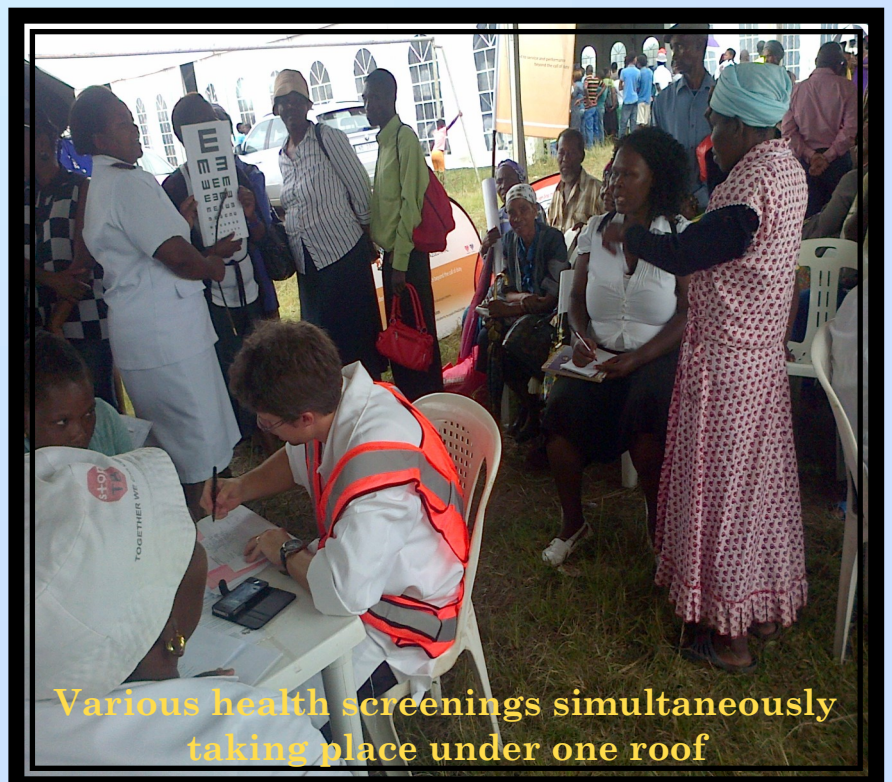
Various health screenings simultaneously taking place under one roof

Human Rights Day Celebration held at Ward 6 of Mtubatuba Municipality organised by the Office of the Premier. The event was held to promote human rights as stated in the Constitution of this country. The event was blessed by the presence of Provincial MEC's and Premier S Mchunu. All Departments were present to render their respective services. 21 staff members from Hlabisa Hospital attended a total of 334 clients.