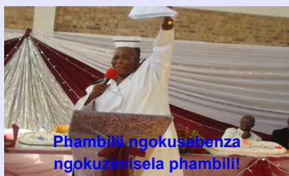
Phambili ngokusebenza ngokuzimisela phambili