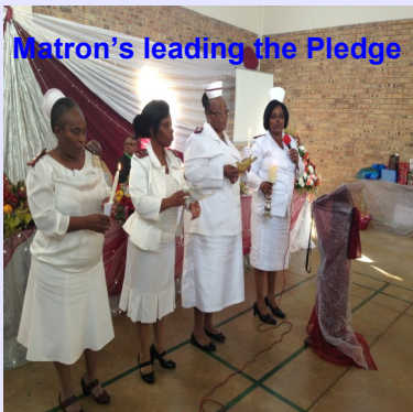
Matron's leading the Pledge

with the packed house to ensure that even on times where they should lost hope they should get stronger and carry their mandate as the nursing is not about employment but is about a calling.