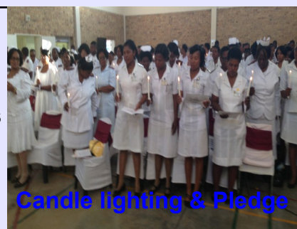
Candle lighting & Pledge