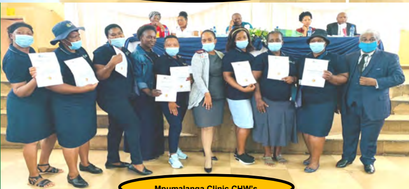
Mpumalanga Clinic CHW's