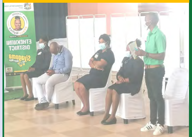
Community Representatives giving their inputs