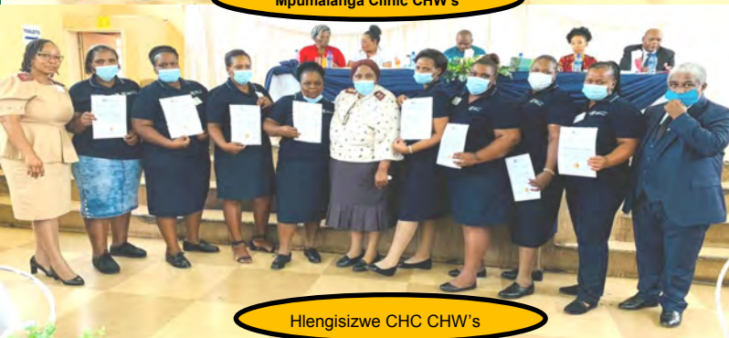
Hlengisizwe CHC CHW's