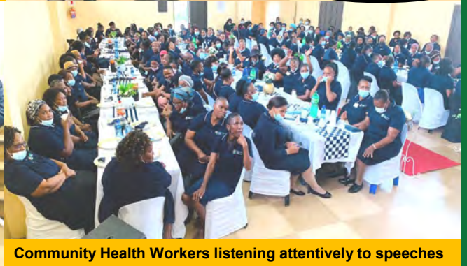
Community Health Workers listening attentively to speeches