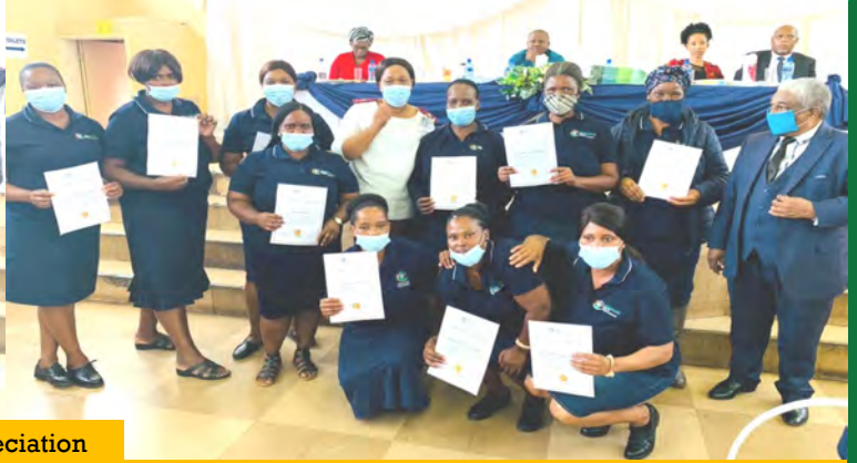
Ntshongweni Clinic CHW's receiving Certificates Of Appreciation