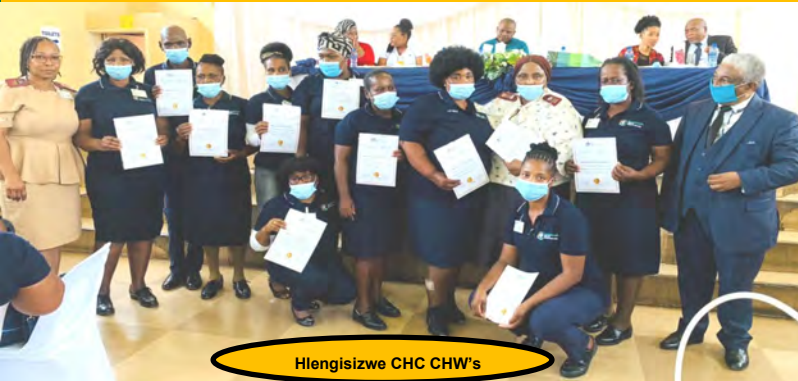
Hlengisizwe CHC CHW's