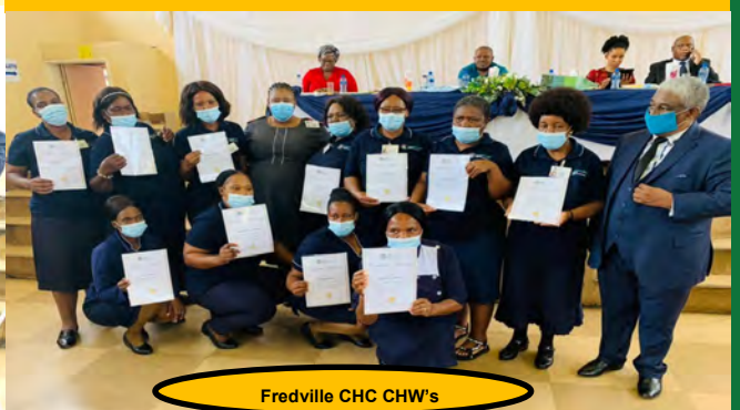
Fredville CHC CHW's