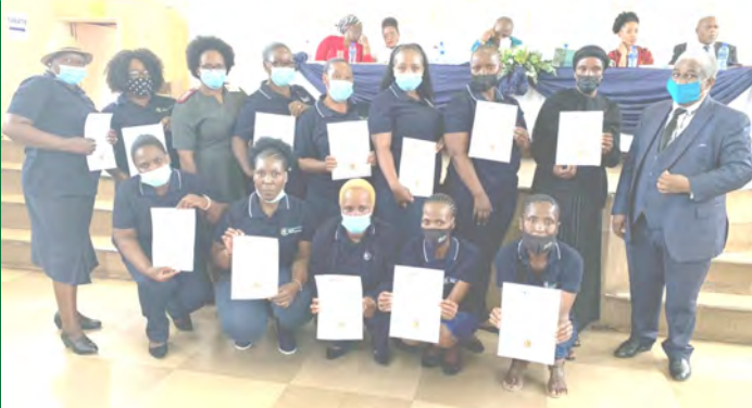
Peaceville Clinic CHW's receiving their Certificates Of Appreciation