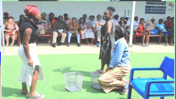
Simunye Group performing Zulu dance and stage play