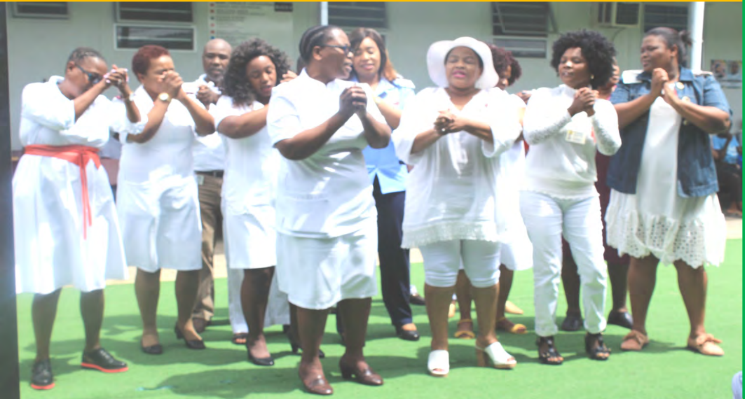
Hlengisizwe Community Health Centre staff bringing awareness through music during the World Aids Day

H lengisizwe CHC commemorated World Aids Day on the 6th of December 2019 in HAST Department.