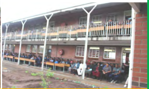
Attendees listening attentively to speeches during the launch