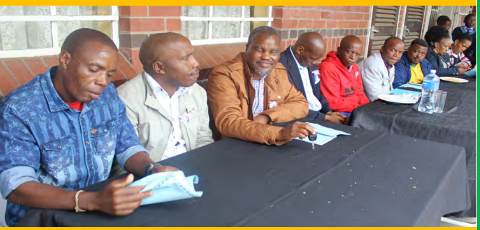
Prominent guests attending the launch of Emalulwini as a Health Promoting School