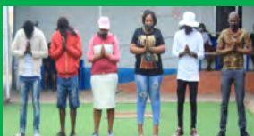
16 Days of Activism READ MORE ON PAGE 2