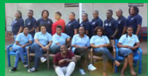
Pharmacy Week Commemoration READ MORE ON PAGE 6