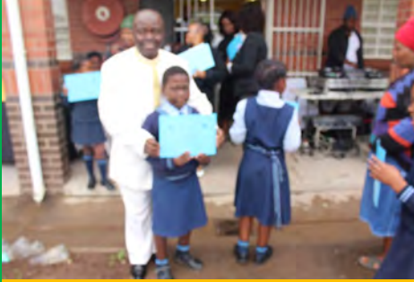
Emalulwini PS Teachers and parents congratulating learners for their achievements in different categories during the Health Promotion Day