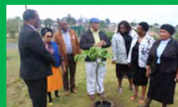
School Health Gallery READ MORE ON PAGE 5