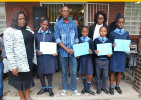
Teachers and parents congratulating learners