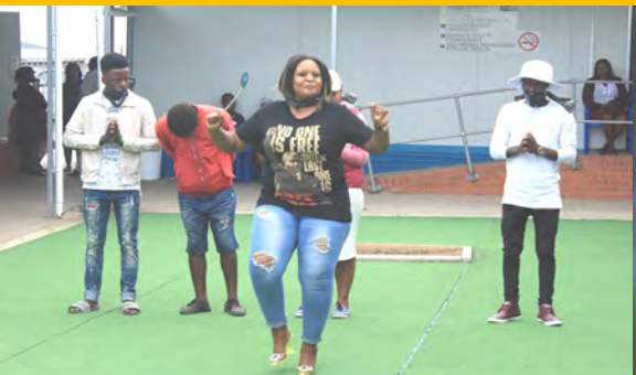
Imbizo Cultural Group entertaining with music