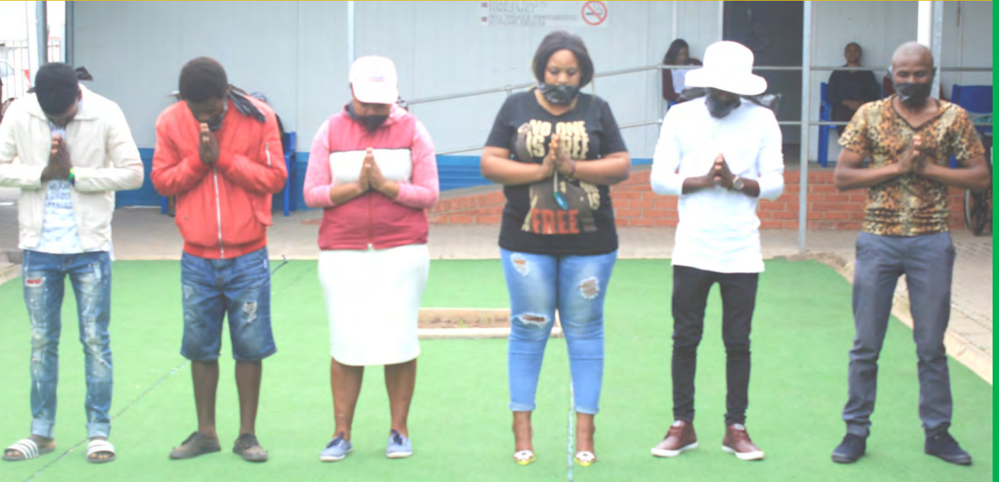
Imbizo Cultural Group leading moment of silence to remember those who perished of gender based violence and abuse

Hlengisizwe CHC commemorated 16 Days of Activism of gender based violence against women and children.