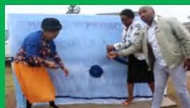
School Health Promotion READ MORE ON PAGE 4