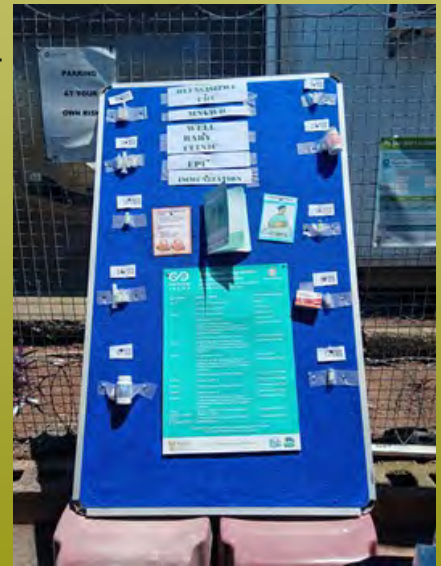
MARTENITY WITH ITS PROJECT PRESENTED

symbol of personal and team building exercises and achievement. The day was designed