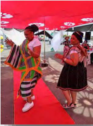
PHOTO GALLERY HERITAGE DAY HLENGISIZWE CHC