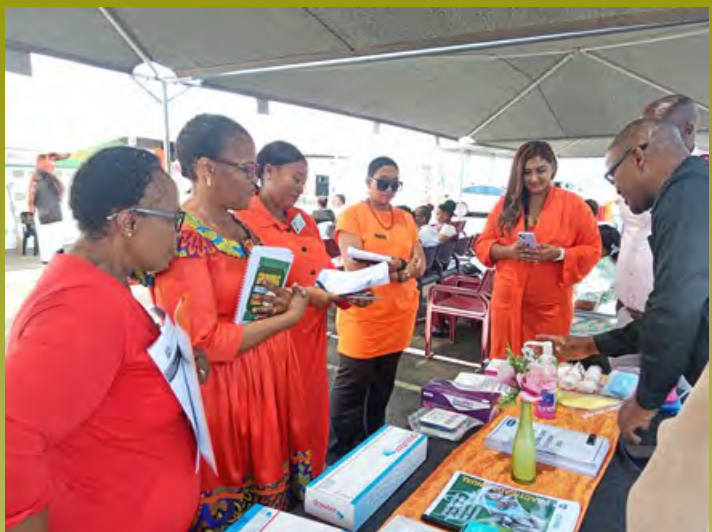
JUDGES STANDING STILL WATCHING CLOSE TO SIR KHUMALO, PRESENTING HIS STAND (IPC)

Standardize processes and structure to reduce variation, achieve predicable results and improving outcome for the patients, healthcare system and quality improvement focuses on care that is safe, timely , effectively, efficient equitable and patient – centered this was the message that was carried at the Quality day held on the 22nd November 2024 at Hlengisizwe clinic we must say it was not just a normal day on its own it was a day that strive for excellence in our work is a responsibility we all share it is not just an end result it's a process a mindset, and a commitment as we reflect on what quality means to all of us.