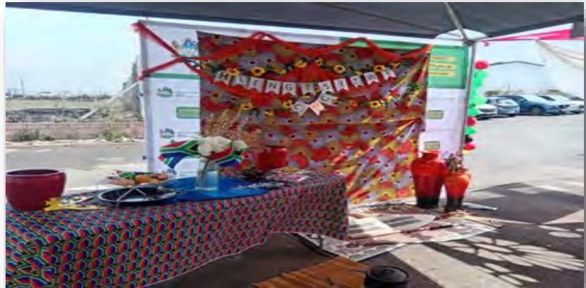
HLENGISIZWE COLOR OF THE DAY OR THE DECO

We managed to achieved our goal which were the reflection of society, our own staff at the clinic, everyone around on the day including patients, were present and the message was very informative on the day. Our main goal was the maintaining of cultural diversity fostering sense of belonging, and passing down knowledge of future generations. We achieved our goal throughout forms of activities including traditional dance category, traditional singing in isiZulu, traditional dance category in isiPedi, Xhosas, including traditional praying in Afrikaans, traditional dance in traditional Indian. Hlengisizwe Heritage was a must not to be forgotten to date around the clinic people including staff still talk about it. We recognized the fact that the nation's strength lies in its diversity.