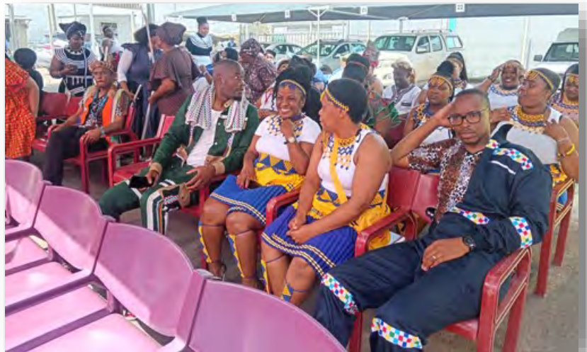
Page indicate some of the performers on the Heritage day at the clinic

Me must said that Heritage is woven into our daily lives and ways of being. Our sense of belonging and identity is often informed by the world we grow we must say this and the traditions that we part of our lives , by understanding one another ways of being in the world and the things that we value , we can connect more